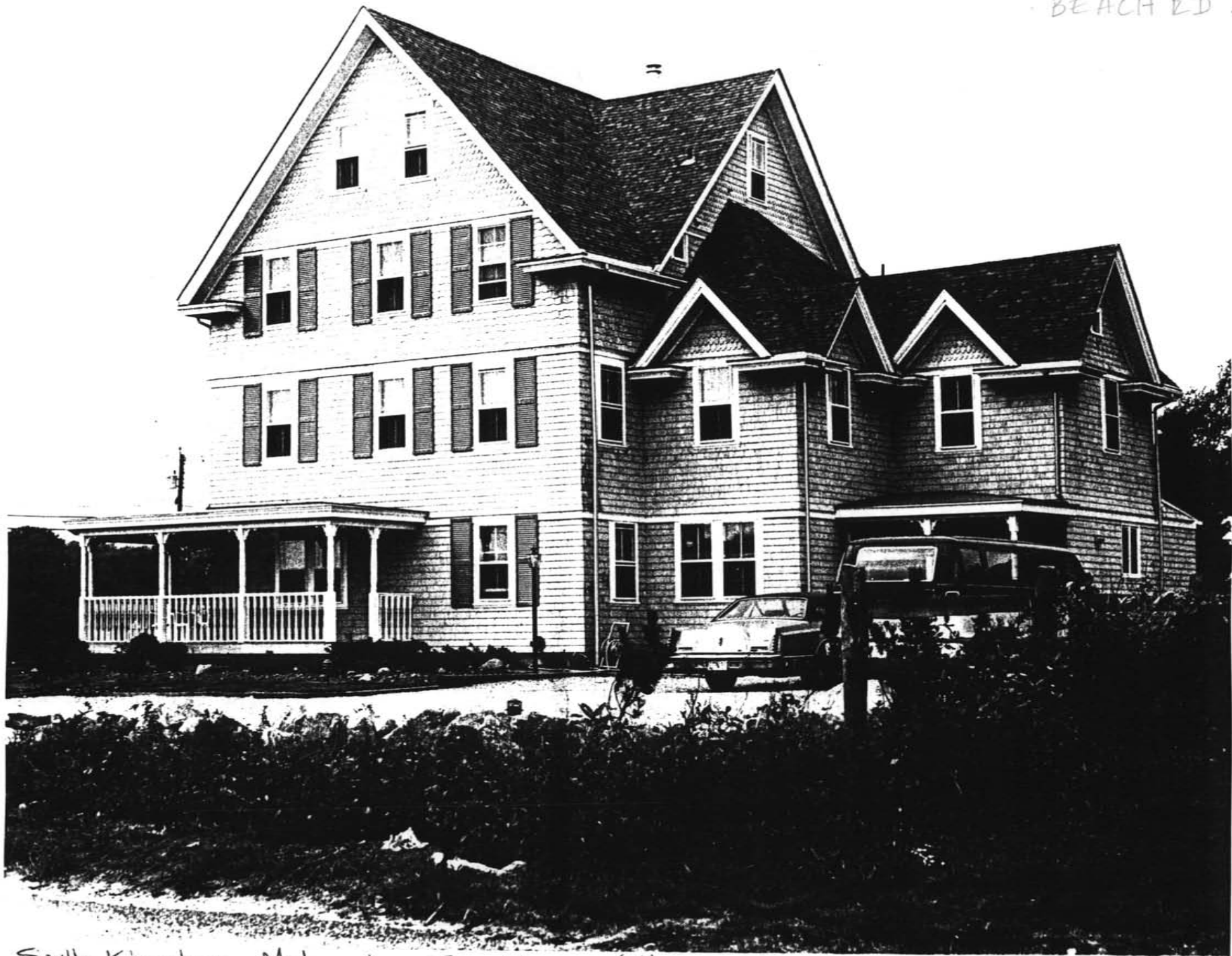
South Kingstown, Matunuck, The Dewey Cottage