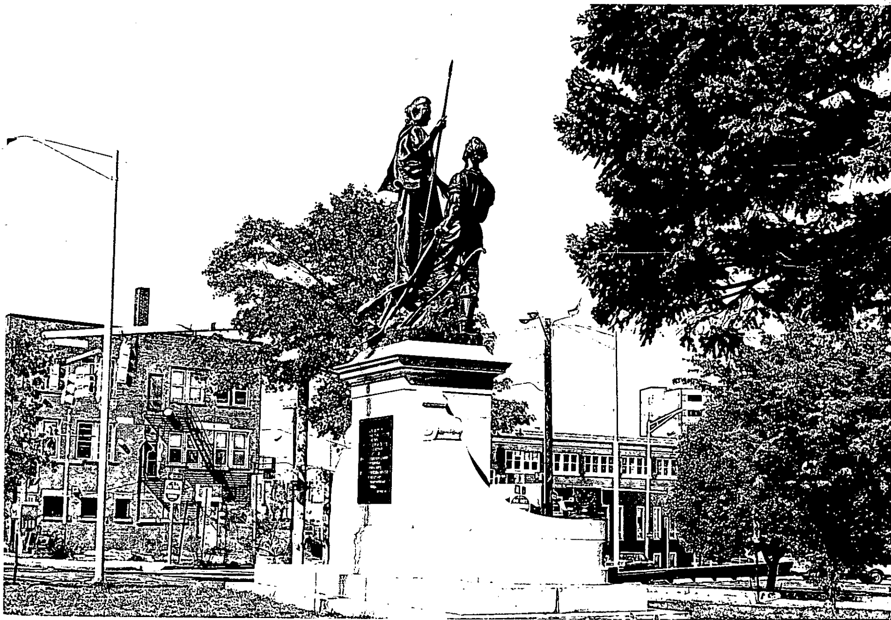
Liberty Arming the Patriot Providence City, Pawtucket, R.I. Photo # 1 of 4