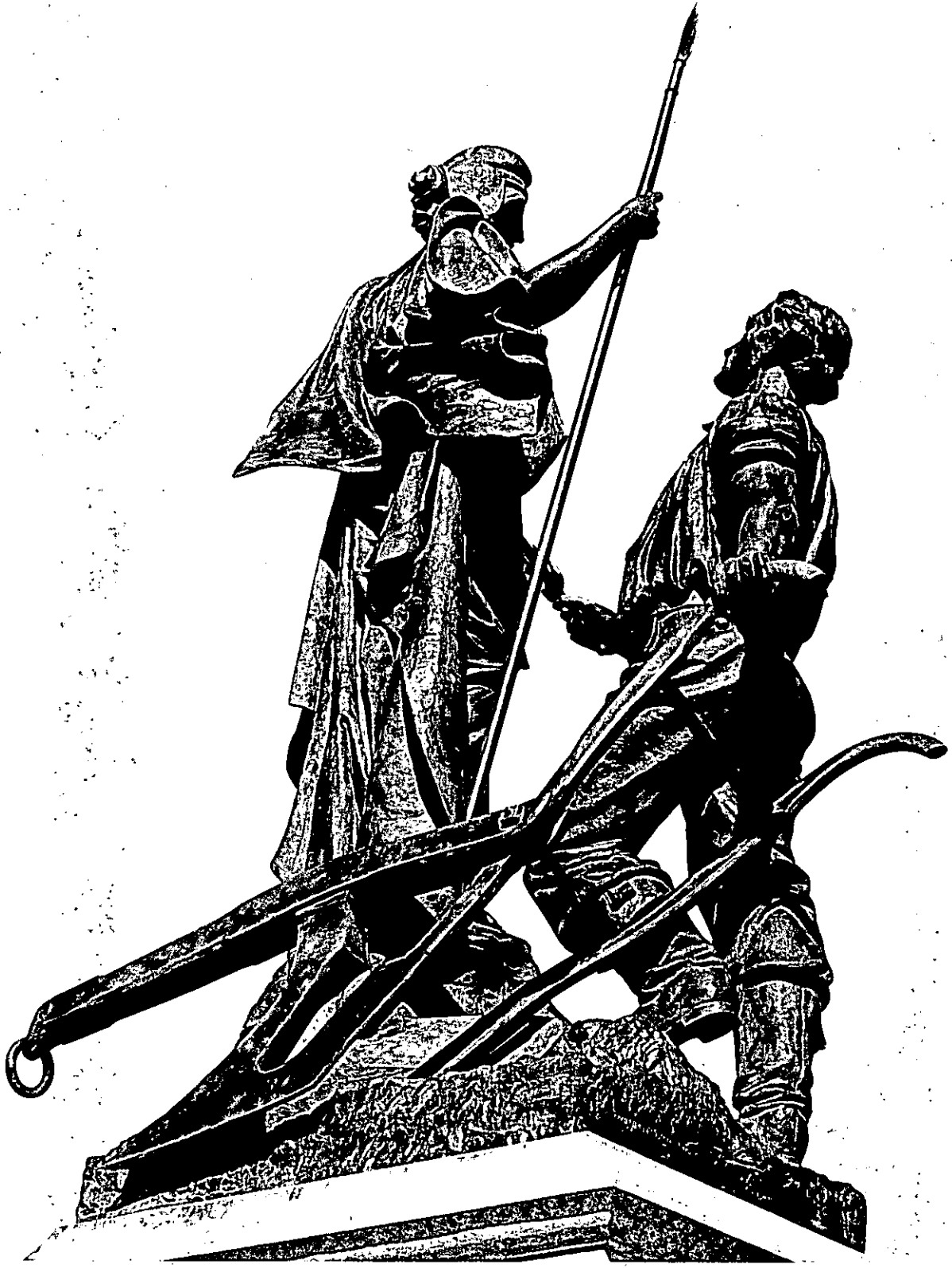
Liberty Arming the Patriot Providence City, Pawtucket, R.I. Photo # 3 of 4