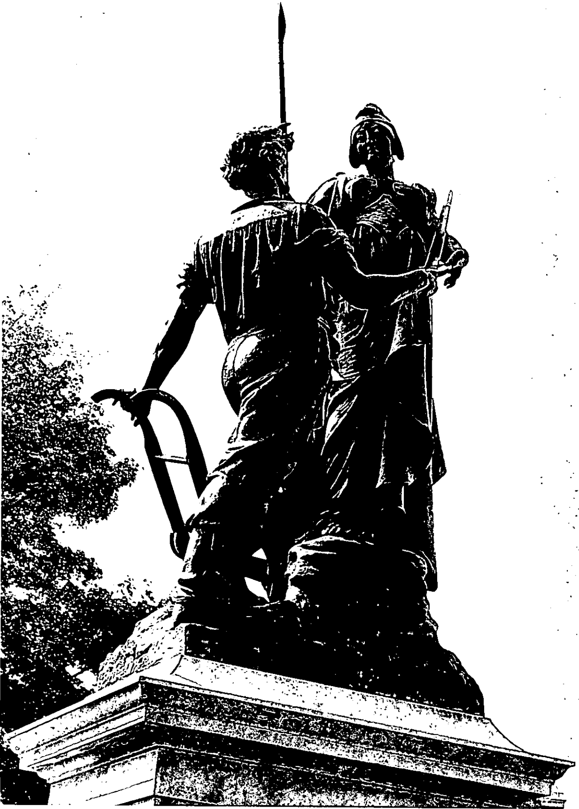
Liberty Arming the Patriot Providence City, Pawtucket, R.I. Photo # 2 of 4