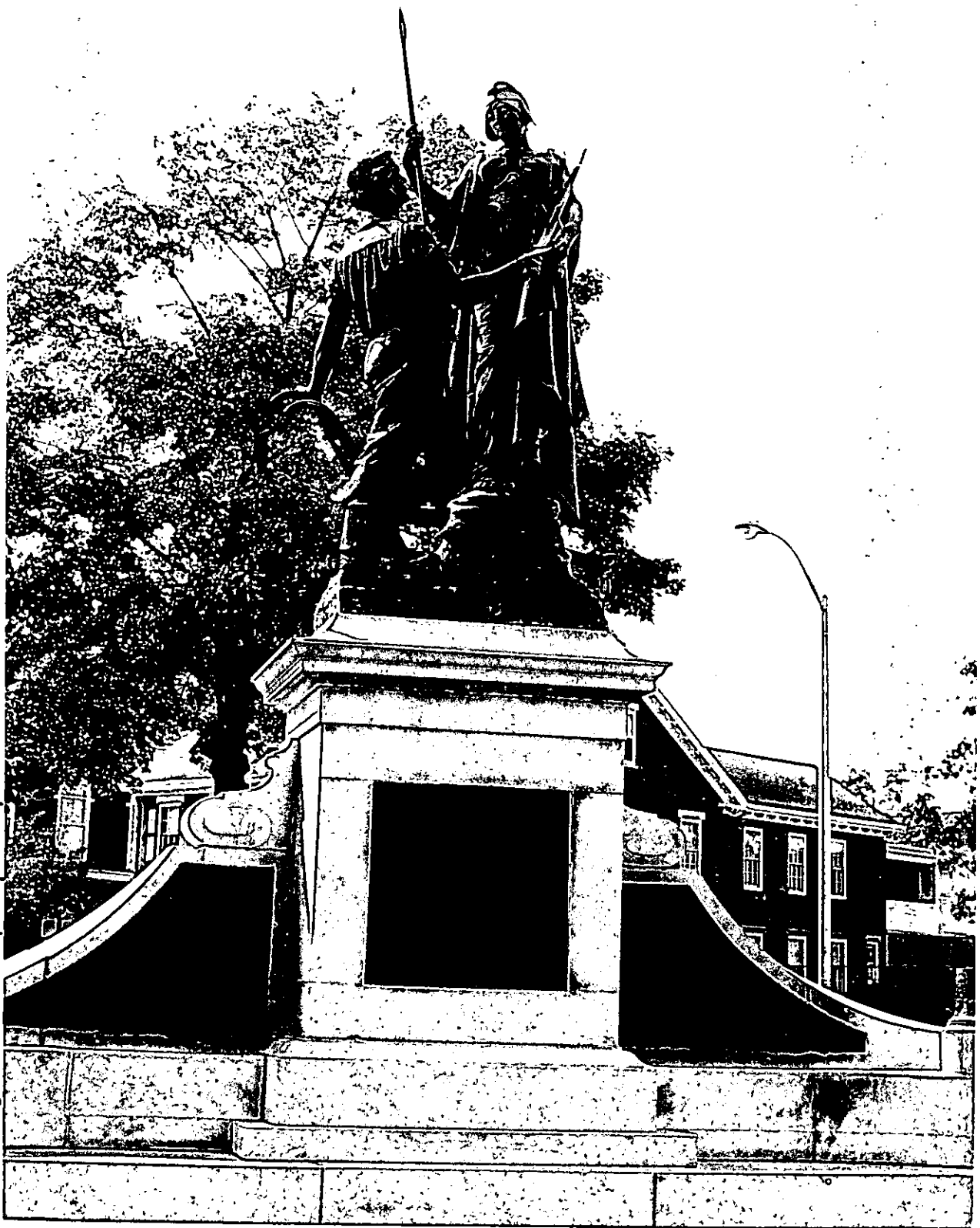
Liberty Arming the Peasant Providence City, Pawtucket, R.I. Photo # 4 of 4