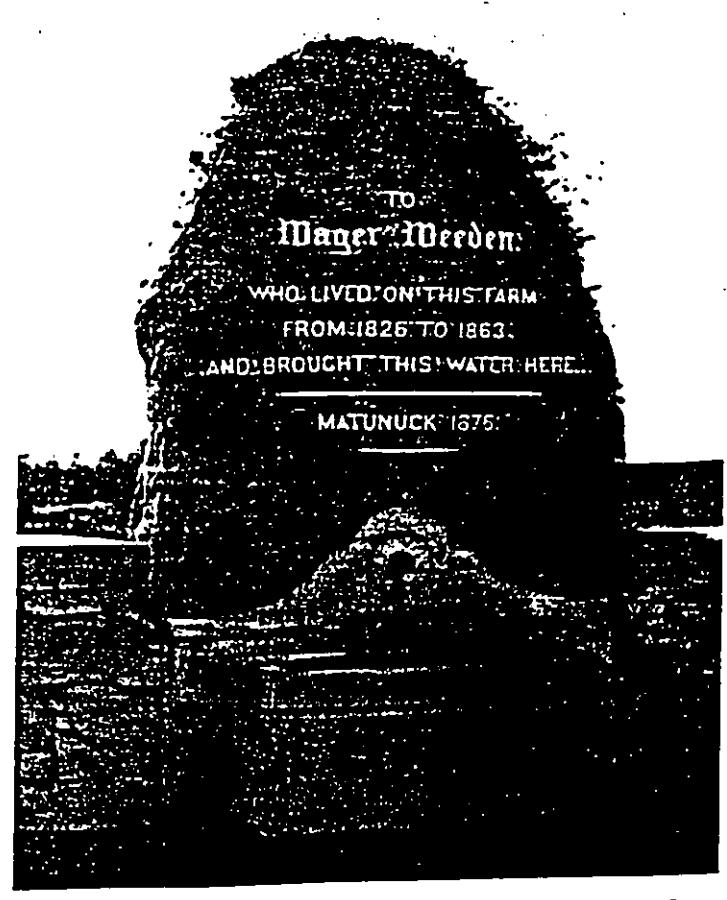
The Weeden Memorial Fountain at Matunuck

FIGURE 2 WAGER WEEDEN MEMORIAL FOUNTAIN