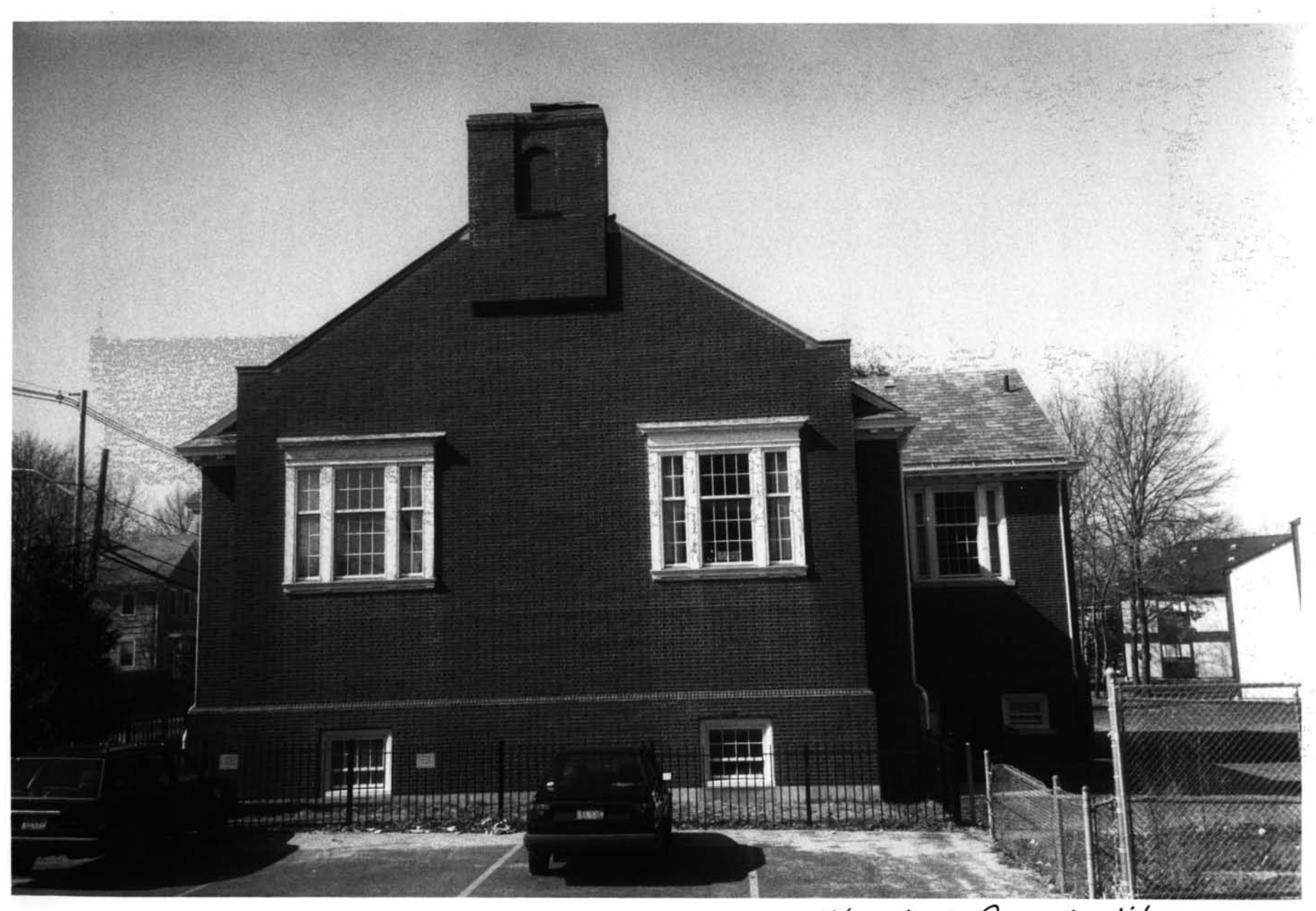
Wanshul Branch Library Providence Cty., fro v., R.I. Photo #2 of 3