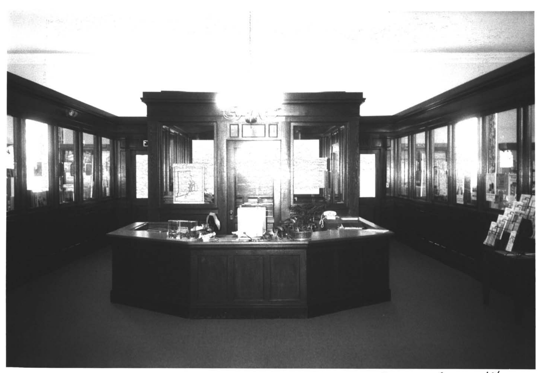
Wanskuck Branch Library Providence Cty, Prov. R.I. Photo #3 of 3