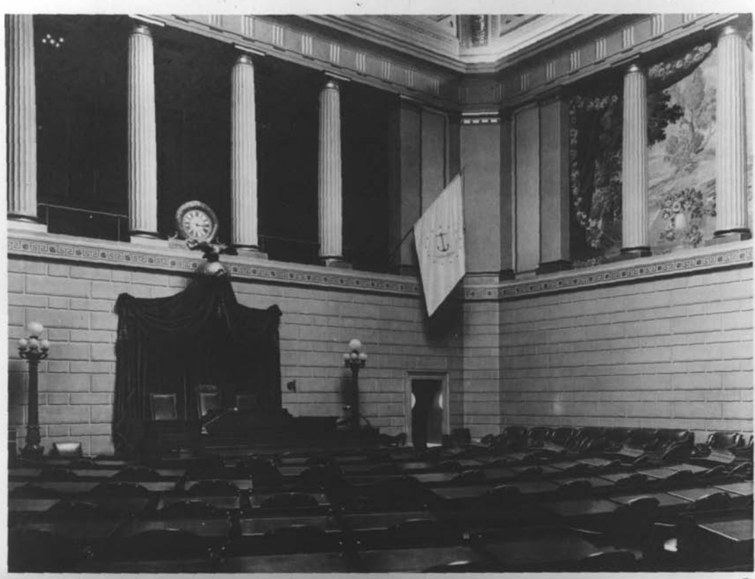
HOUSE OF REPRESENTATIVES