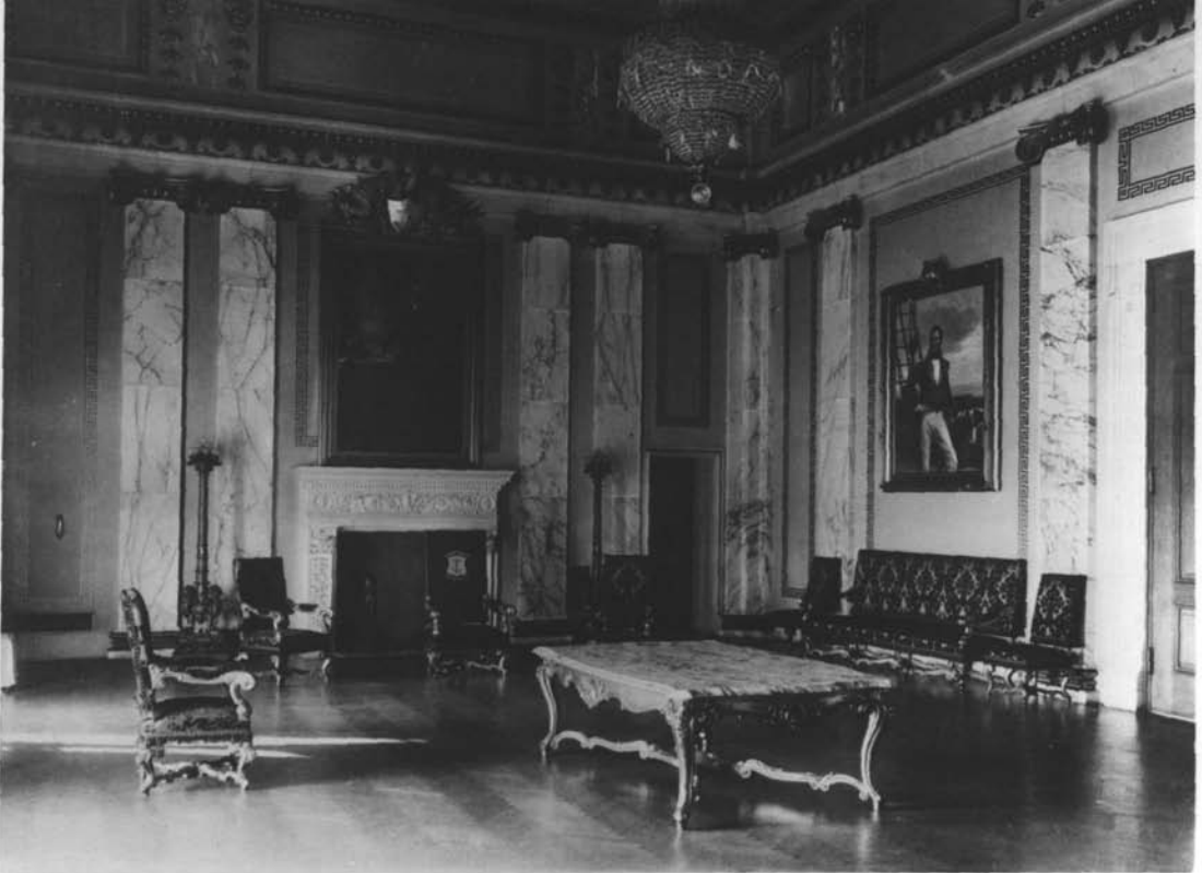
GOVERNOR'S RECEPTION ROOM