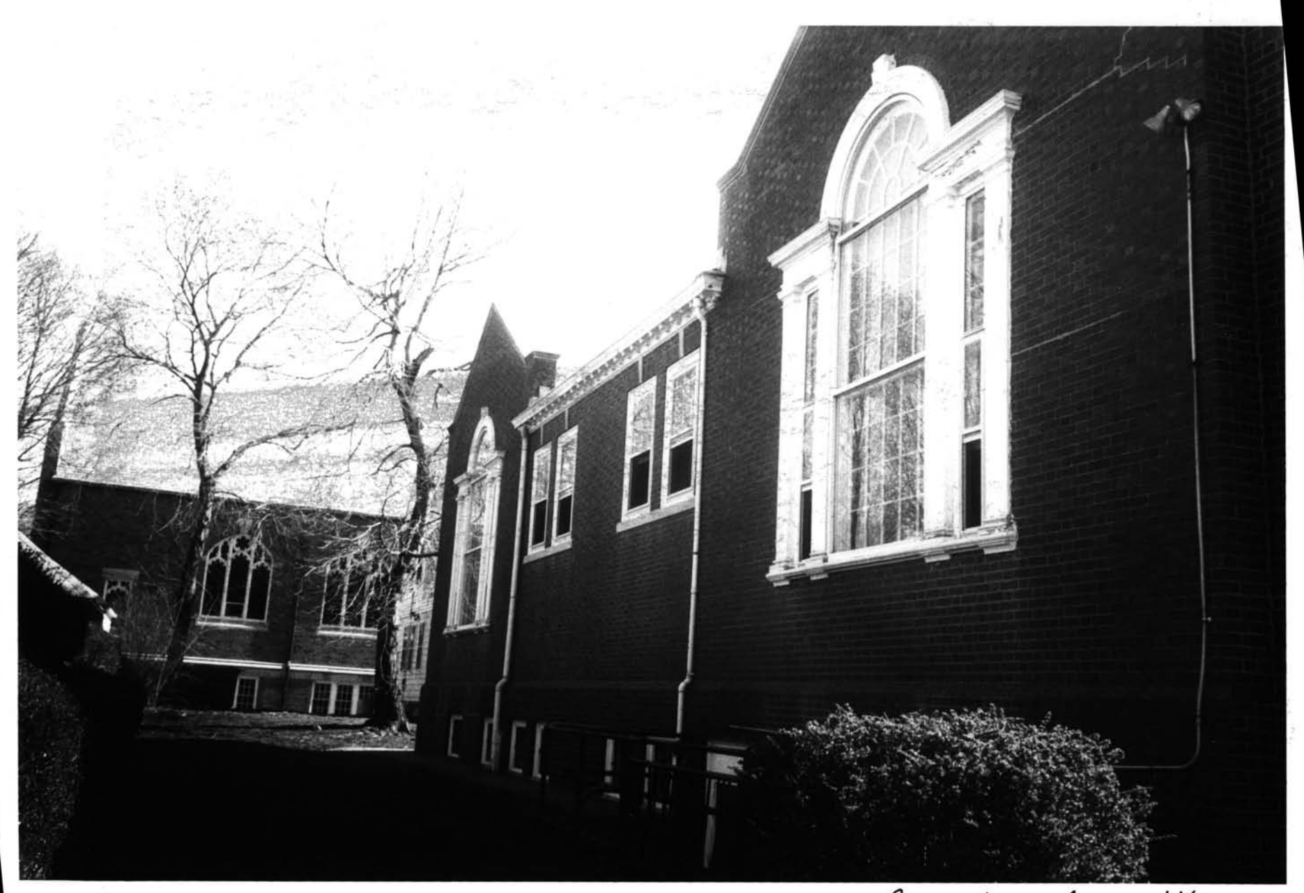
Rochambeau Branch Library Providence Cty., Prov., R.I. Photo #2 of 3