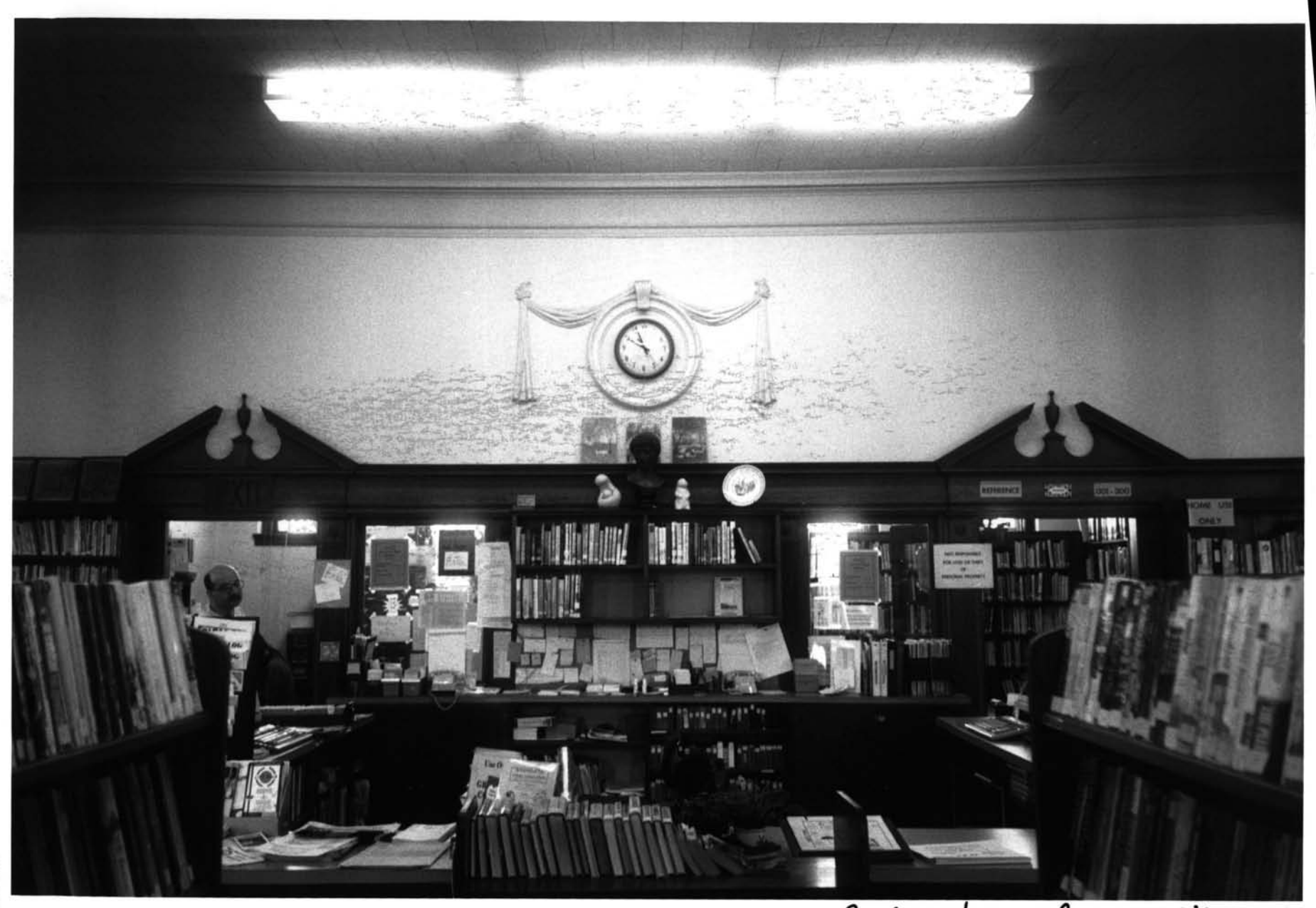
Richambeau Branch Library Providence Cty., Prov., R.I. Photo # 3 of 3