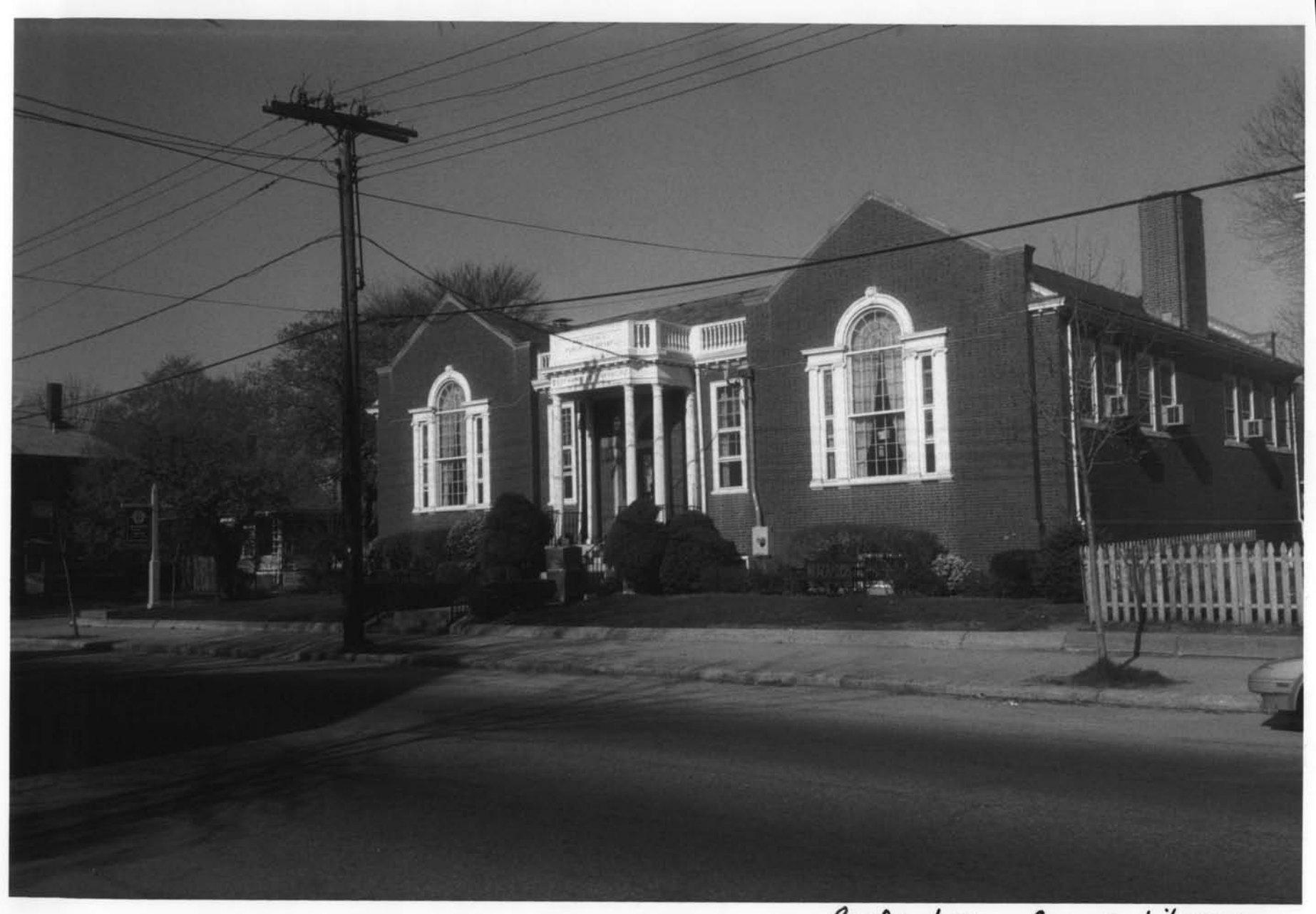
Rochambeau Branch Library Providence Etg., Prov., R.I. Photo # 1 of 3