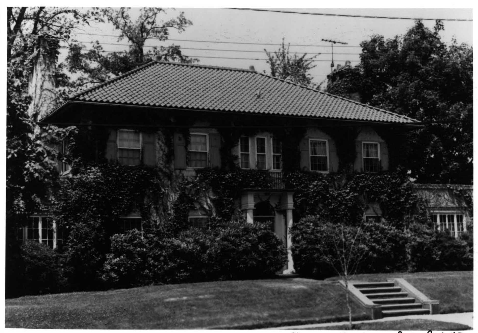
Blackstone Boulevard Realty Plat H.D. Providence County, Rhade I sland Photo # 5 of 13