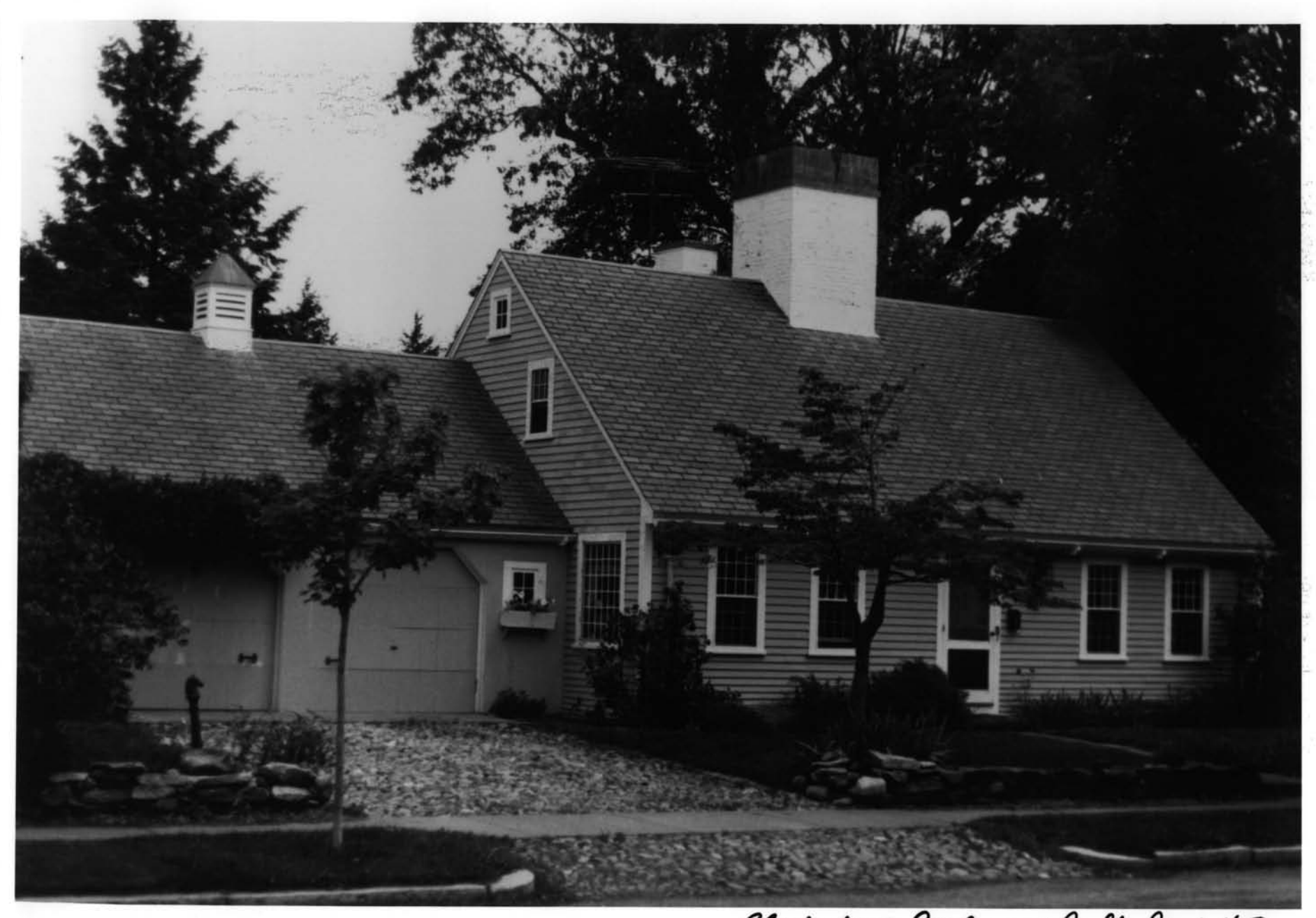
Blackstone Boulevard Realty Plat H.D. Providence County, Chode Island Photo #12 of 13