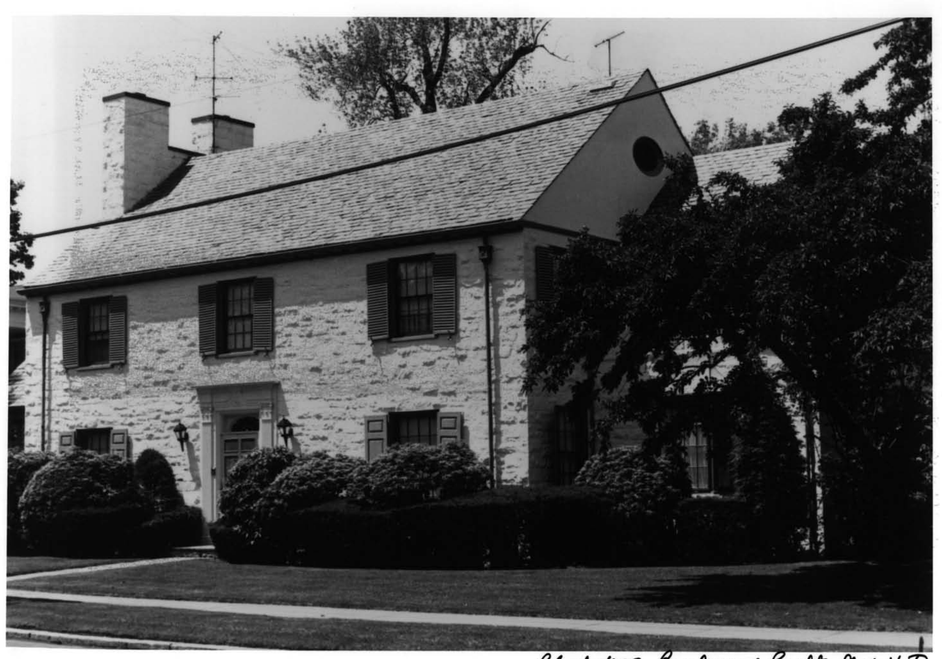
Blackstone Boulevard Realty Ret H.D. Providence County, Rhade I sland Photo#9 of B