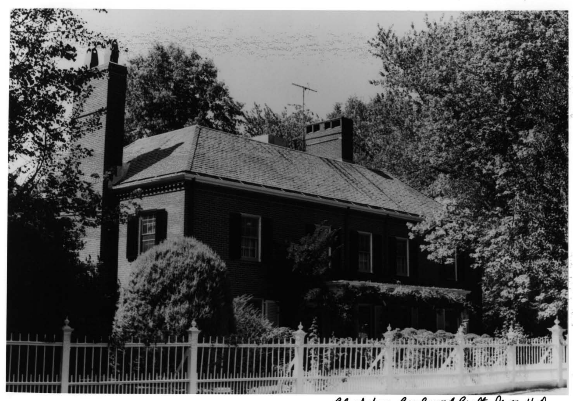
Blackstone Boulevard Realty Plat H. D. Providence County, Rhade Island Photo # 11 of 13