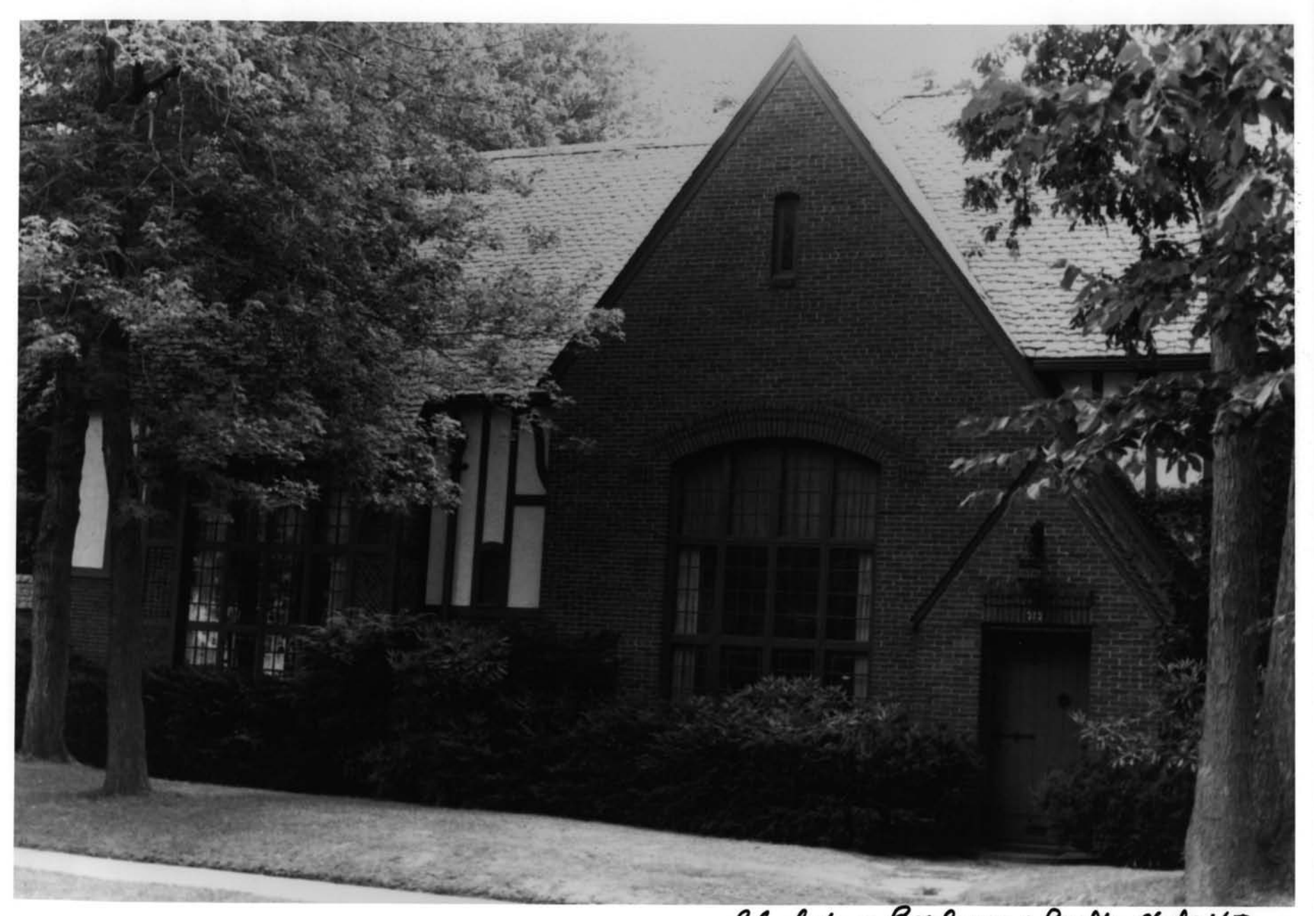
Blackstone Boulevard Realty Plat H.D. Providence County, Rhode Island Photo #7 of B