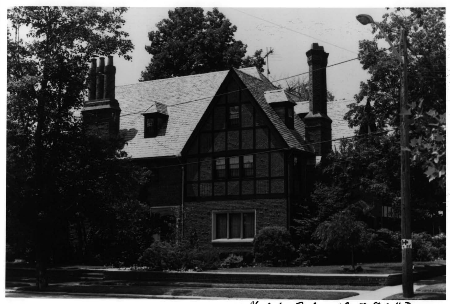
Blackstone Boulevard Realty Plat H. D. Providence County, Phode Island Broto #3 of 13