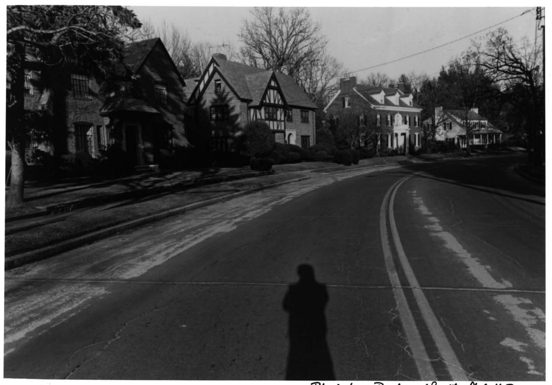
Blackstone Boulevard Realty Hat H.D. Providence County, Rhode Island Photo #1 of 13