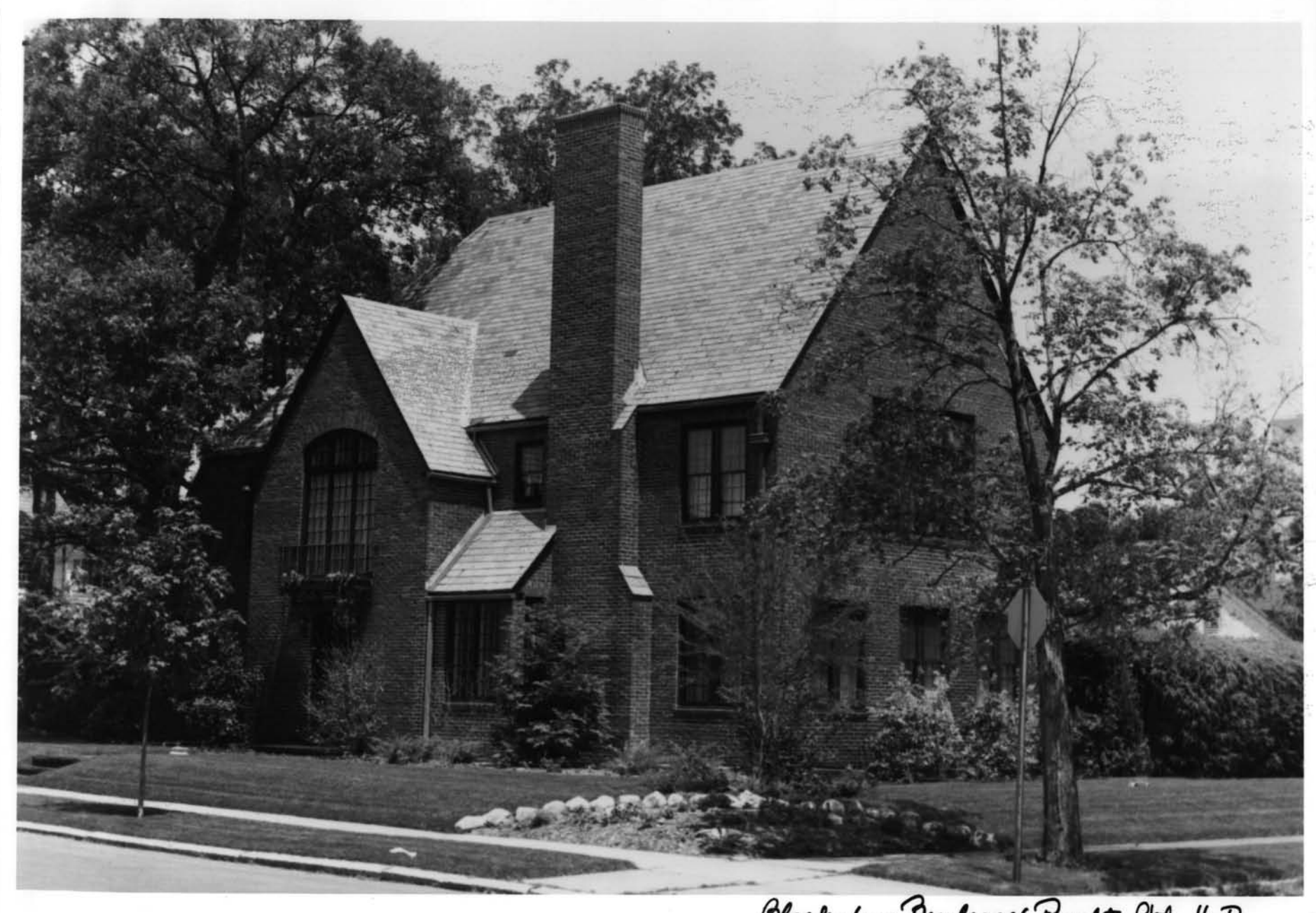
Blackstone Boulevash Realty Plat H. D. Providence County, Rhole I sland Photo # 4 of B