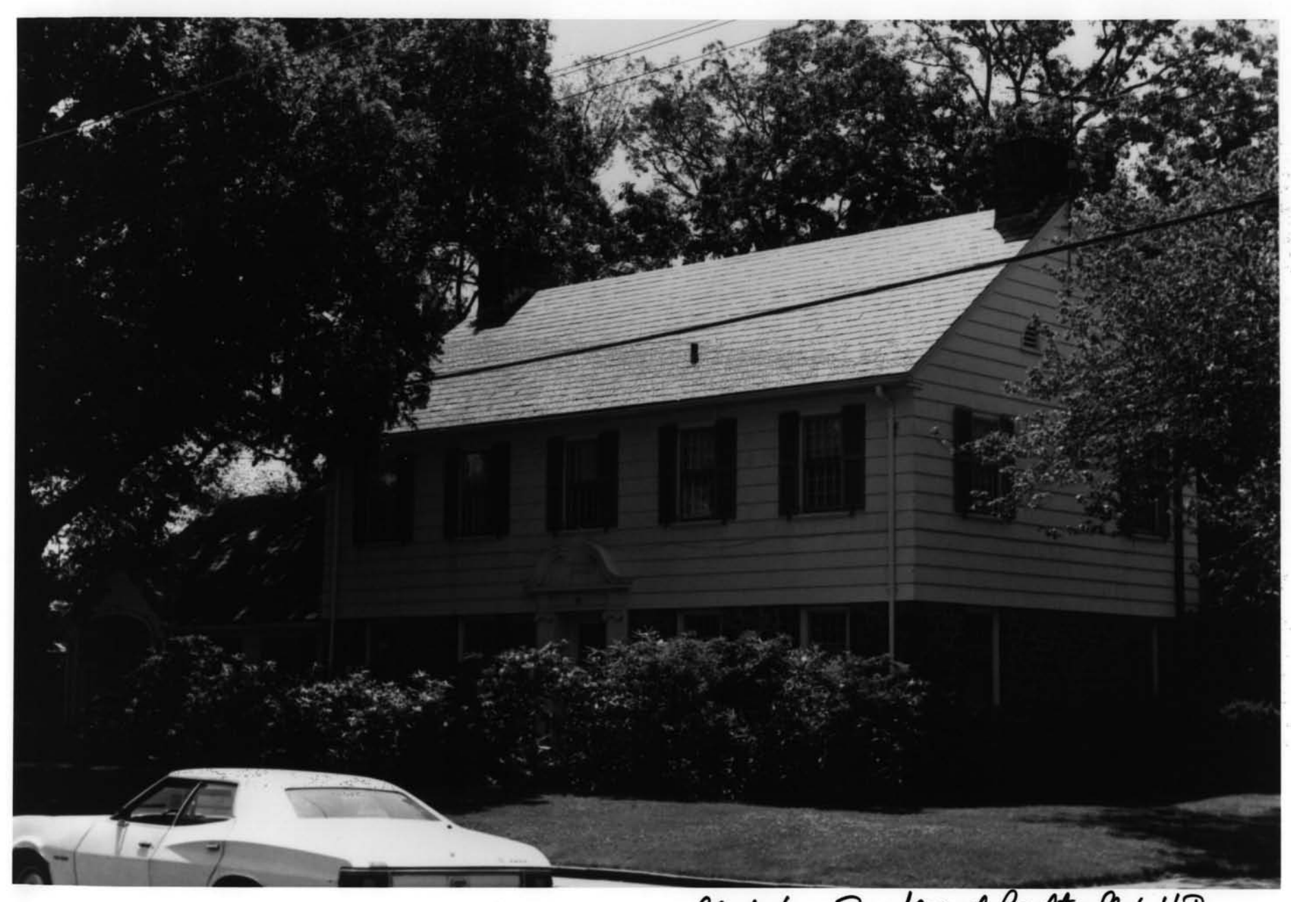
Blackstone Boulevard Realty Plat H.D. Providence County, Ehdle Island Photo #13 of 13