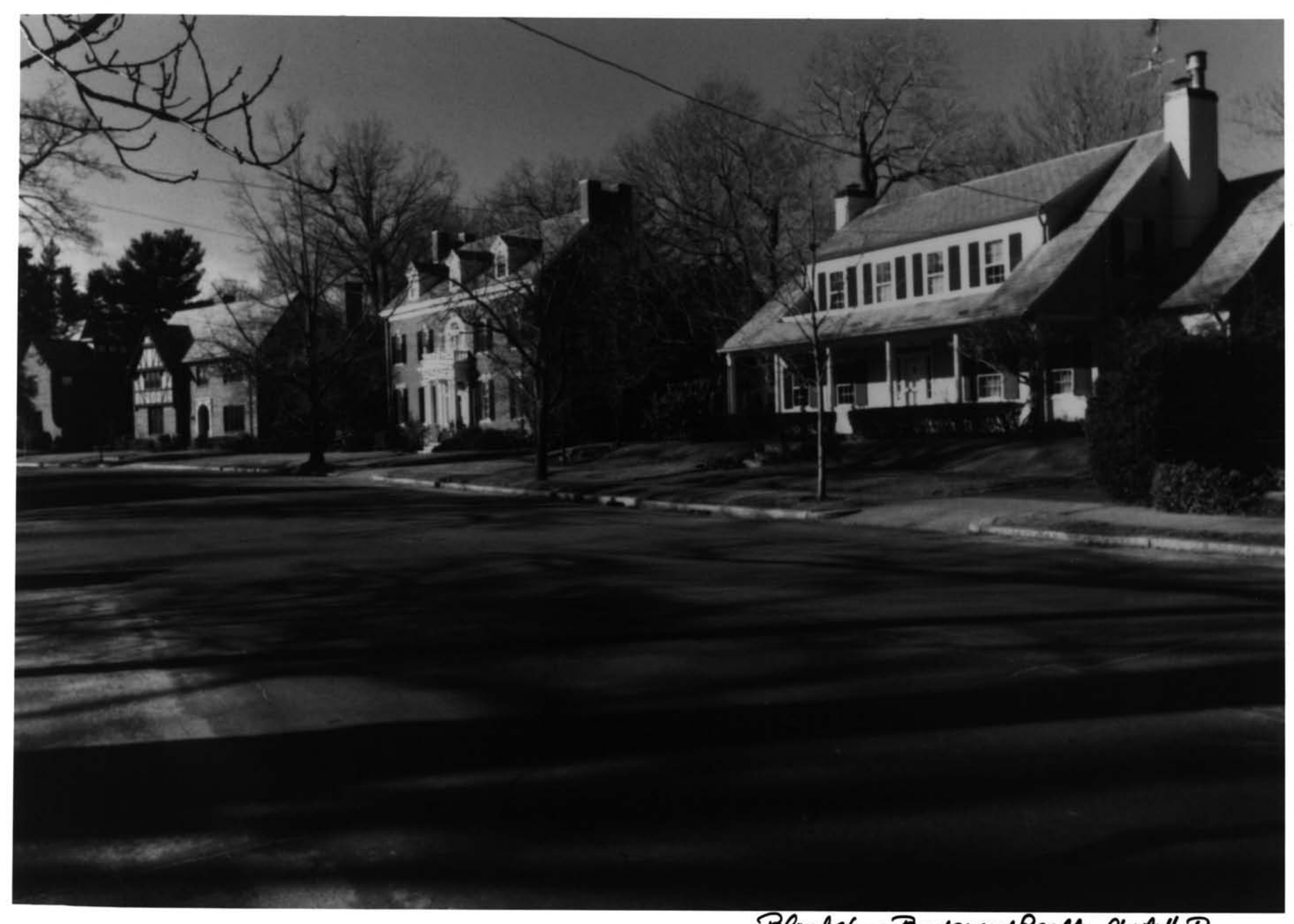
Blackstone Bowevard Realty Plat H. D. Providence County, Rhode Island Photo #2 of 13