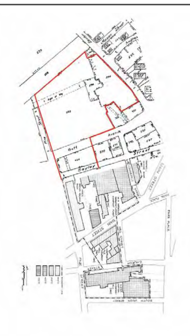
Church Hill Industrial District Boundary Increase indicated by red line