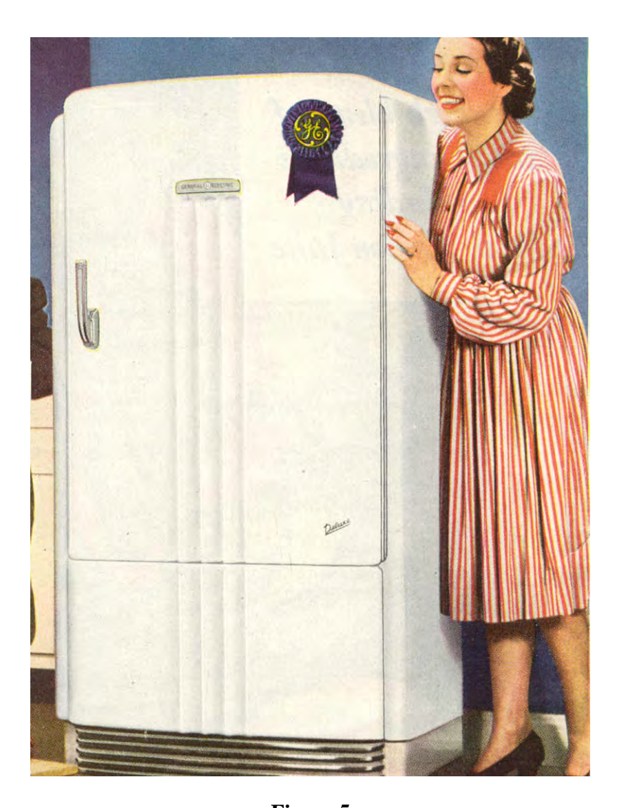
Figure 5 1939–40 General Electric refrigerator detail from Collier's Magazine advertisement Note tiered, tripartite design, vertical "speed stripes" in door, and stainless steel striping in the kick panel/vent