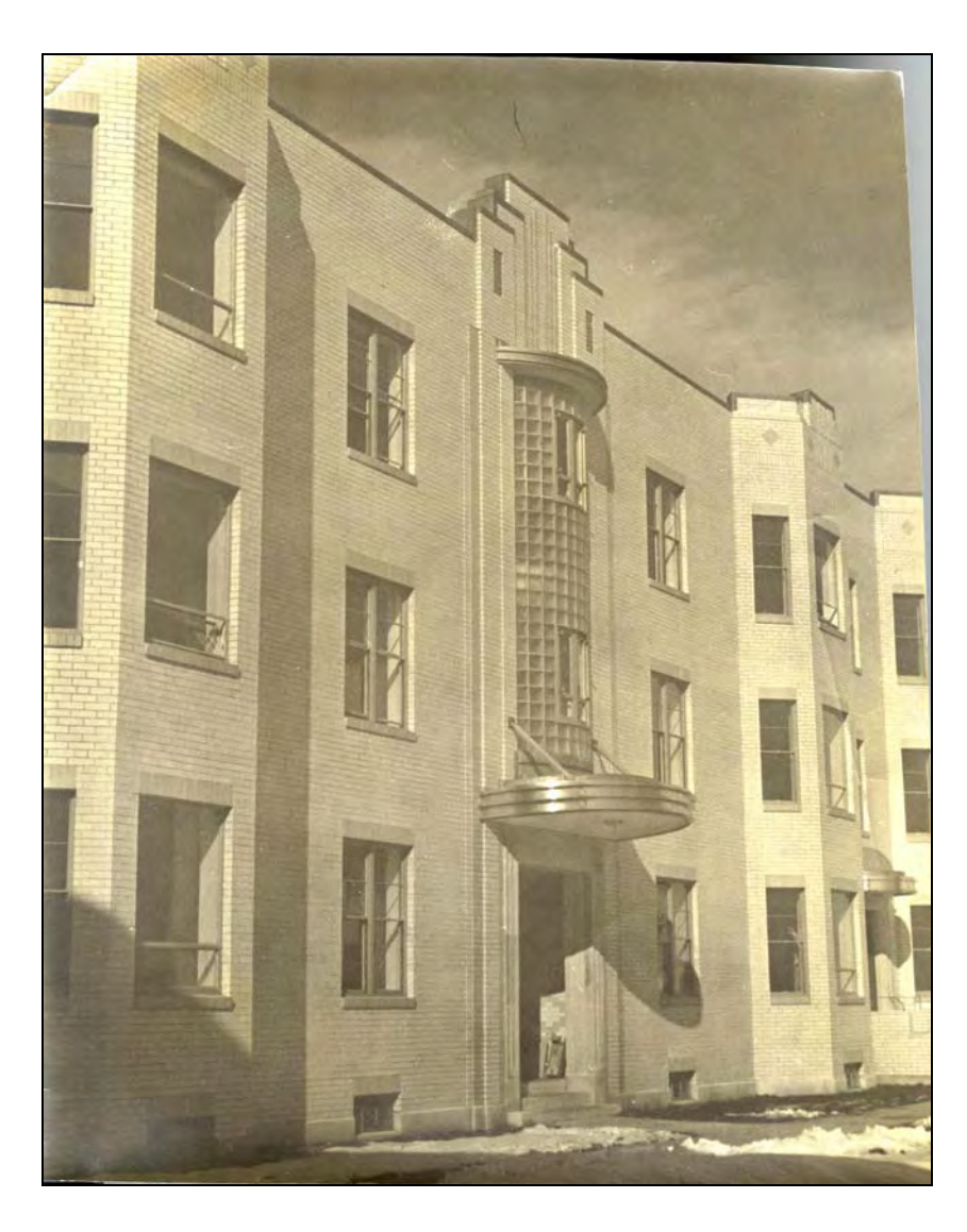
Figure 2 Historical photo of Rosedale Apartments Rear elevation, ca 1940