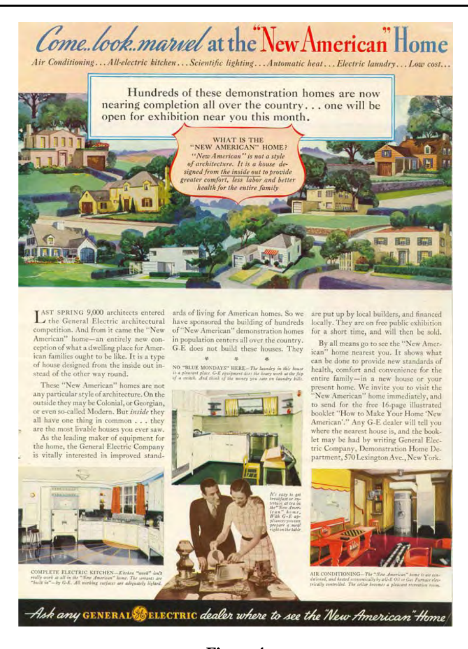
Figure 4 General Electric's "New American" Home From Better Homes and Gardens, November 1935