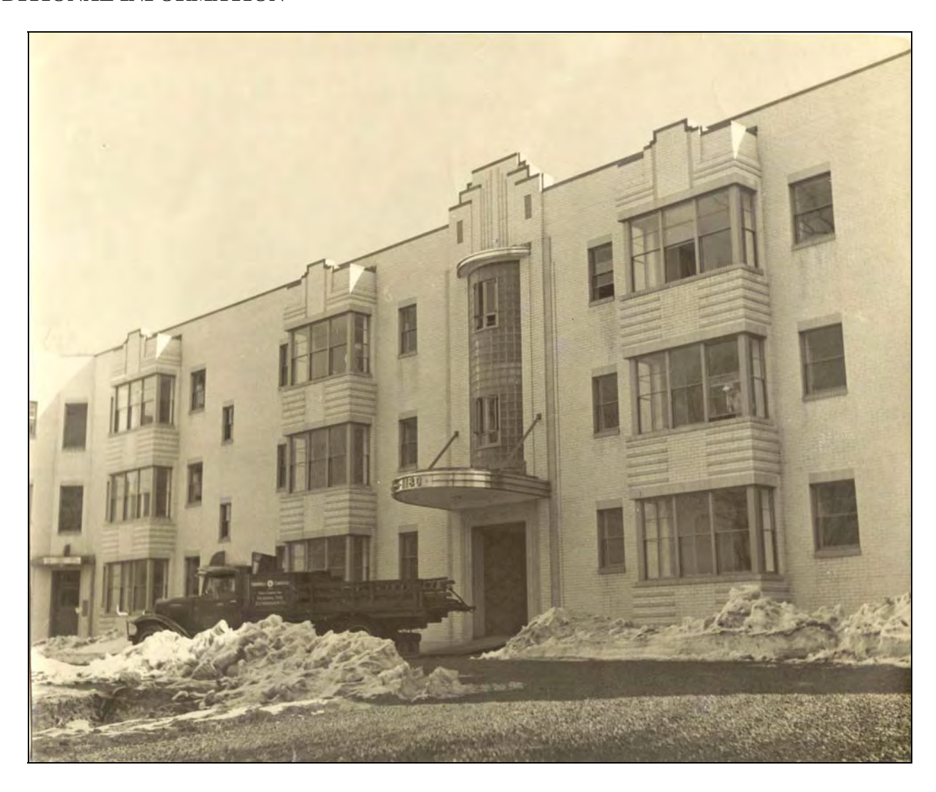
Figure 1 Historical photo of Rosedale Apartments Front elevation, ca 1940