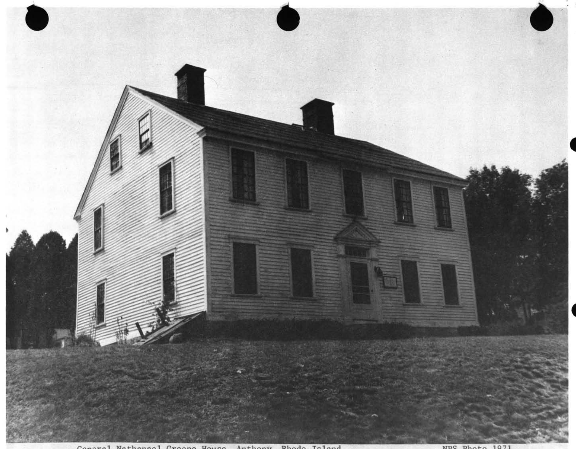
General Nathanael Greene House, Anthony, Rhode Island