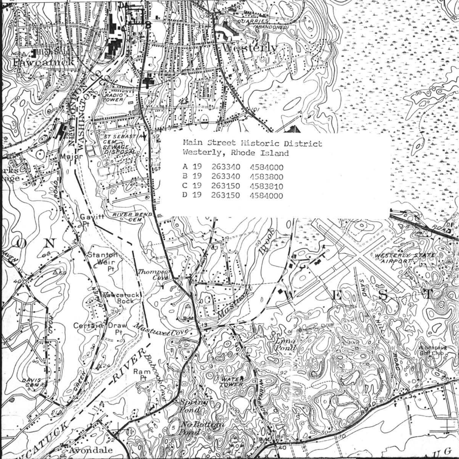
Main Street Historic District Westerly, Rhode Island