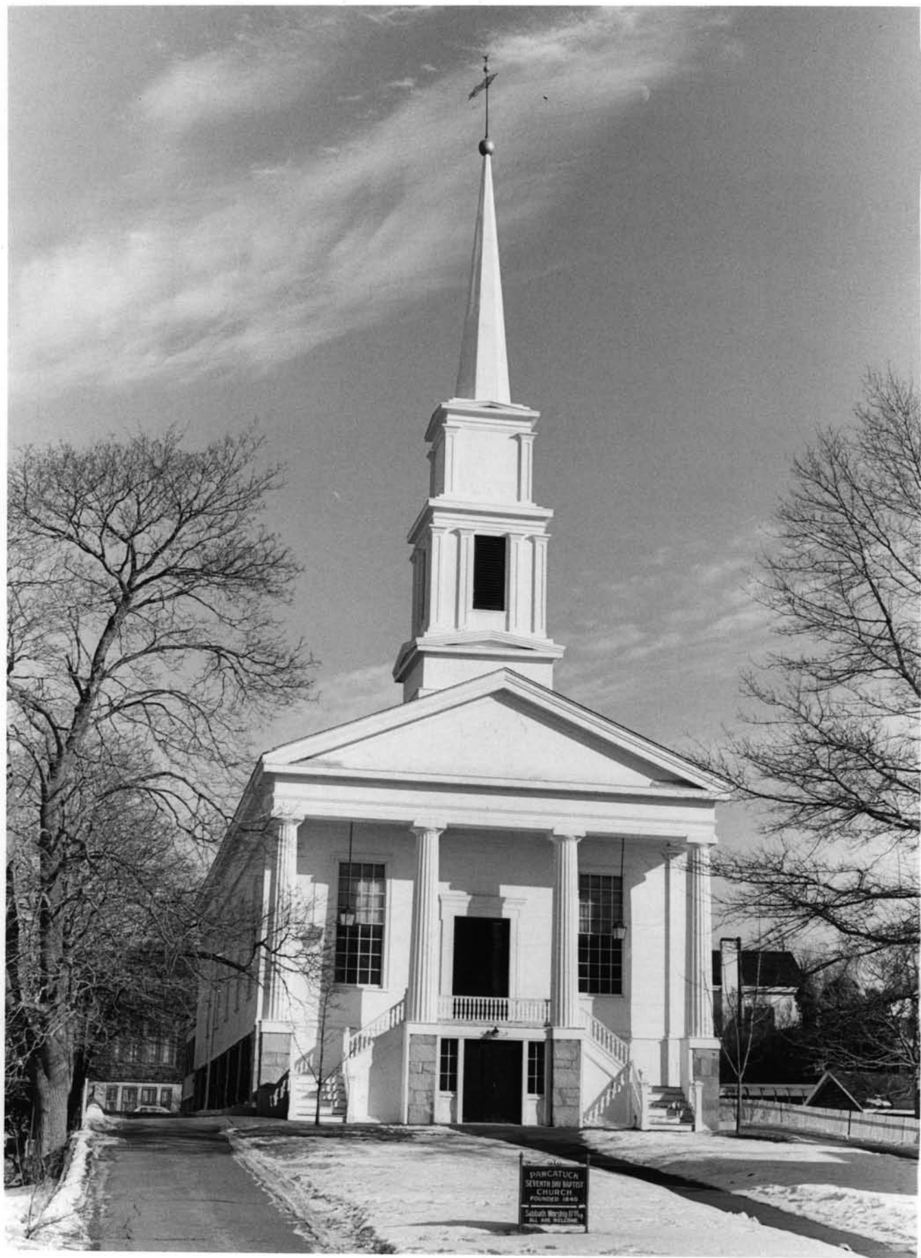
PAWCATUCK SEVENTH DAY BAPTIST CHURCH FOUNDED 1840 Sabbath School 10:00 AM ALL ARE WELCOME