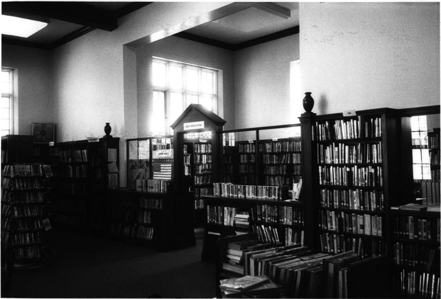
Smith Hill Branch Library Providence City, Prov., R.I. Photo # 4 of 4