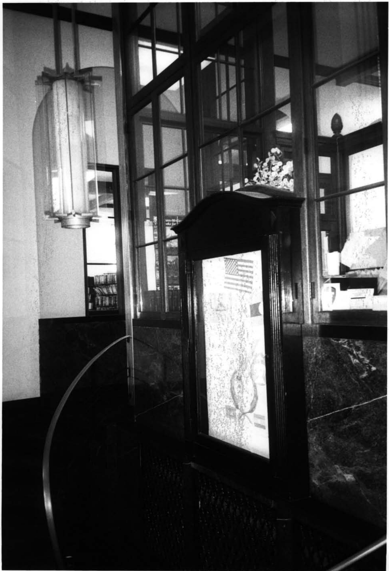
Smith Hill Branch Library, Prov. Ctr., R.I. Photo # 3 of 4