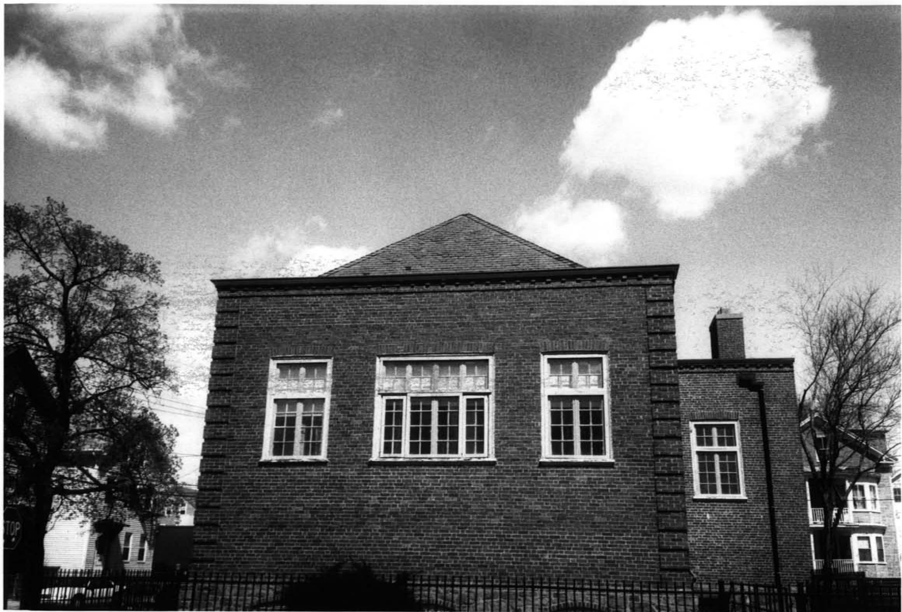
Smith Hill Branch Library Providence City, Prov., R.I. Photo # 2 of 4