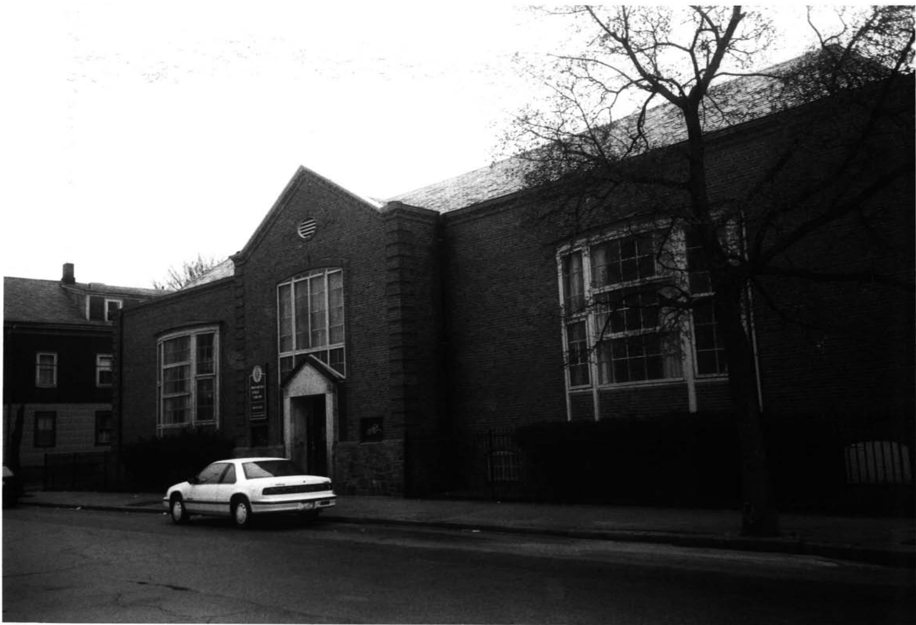
Smith Hill Branch Library Providence City, Prov., R.I. Photo #1 of 4