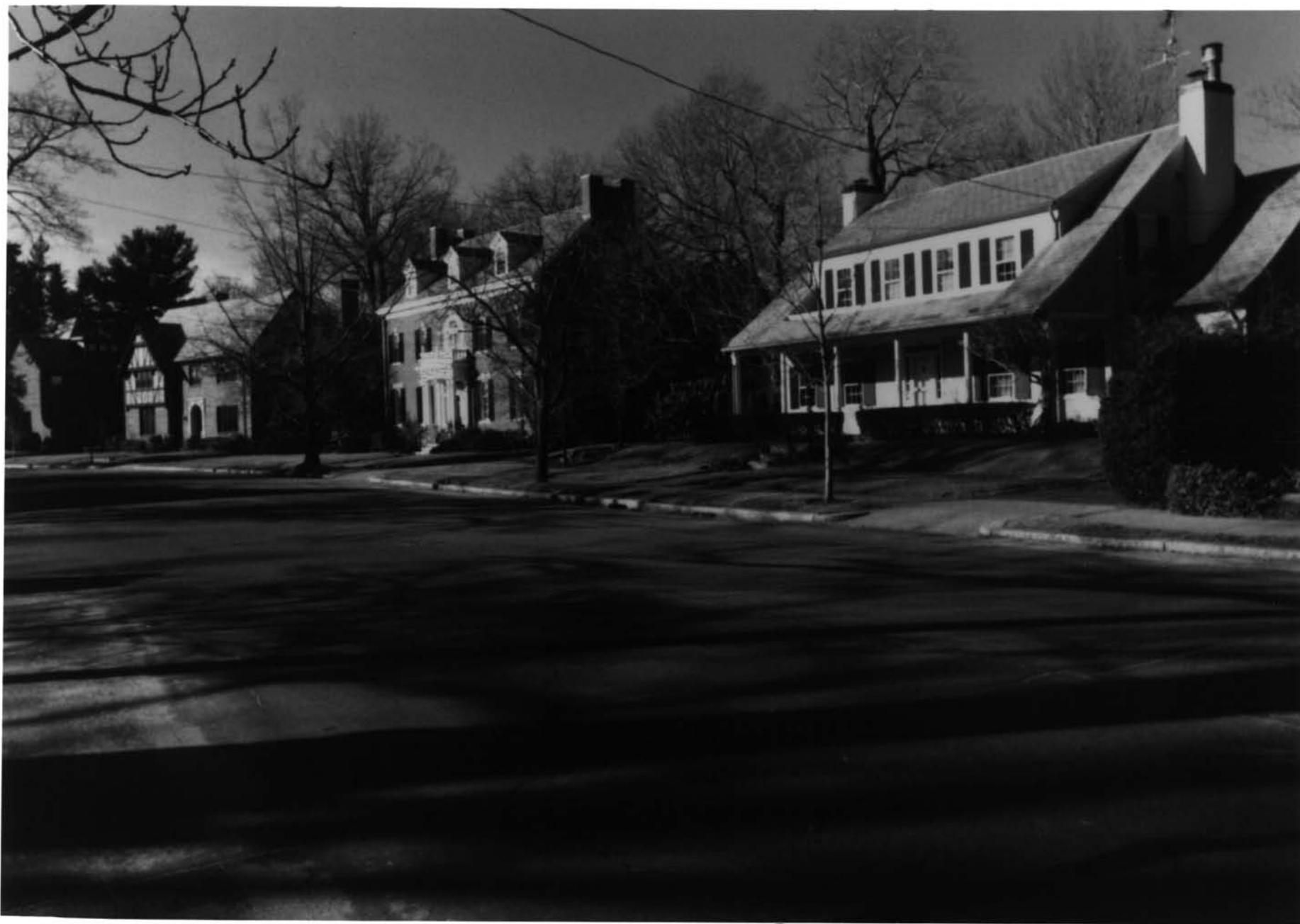
Blackstone Boulevard Realty Plat H. D. Providence County, Rhode Island Photo #2 of 13