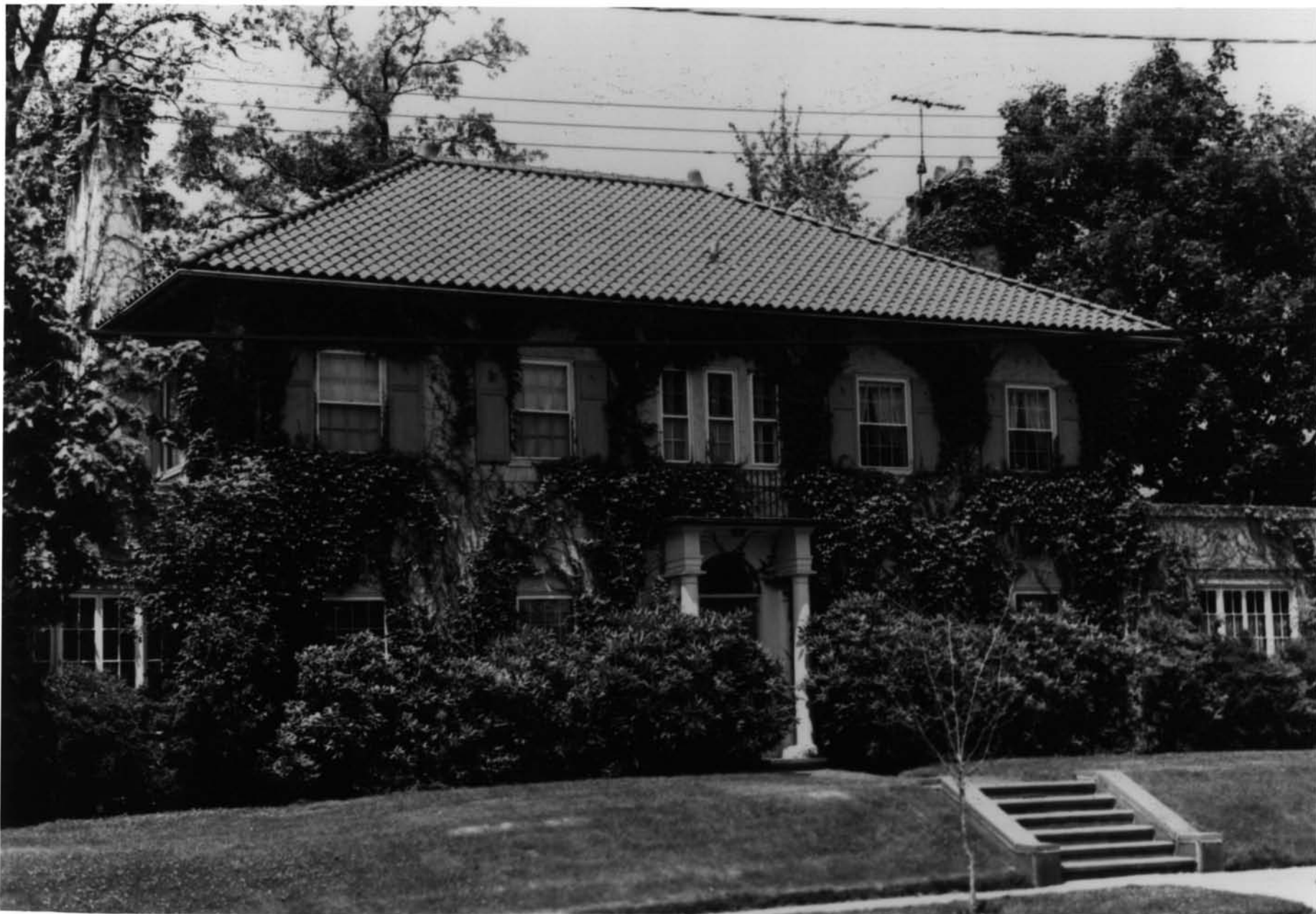
Blackstone Boulevard Realty Plat H.D. Providence County, Rhode Island Photo # 5 of 13