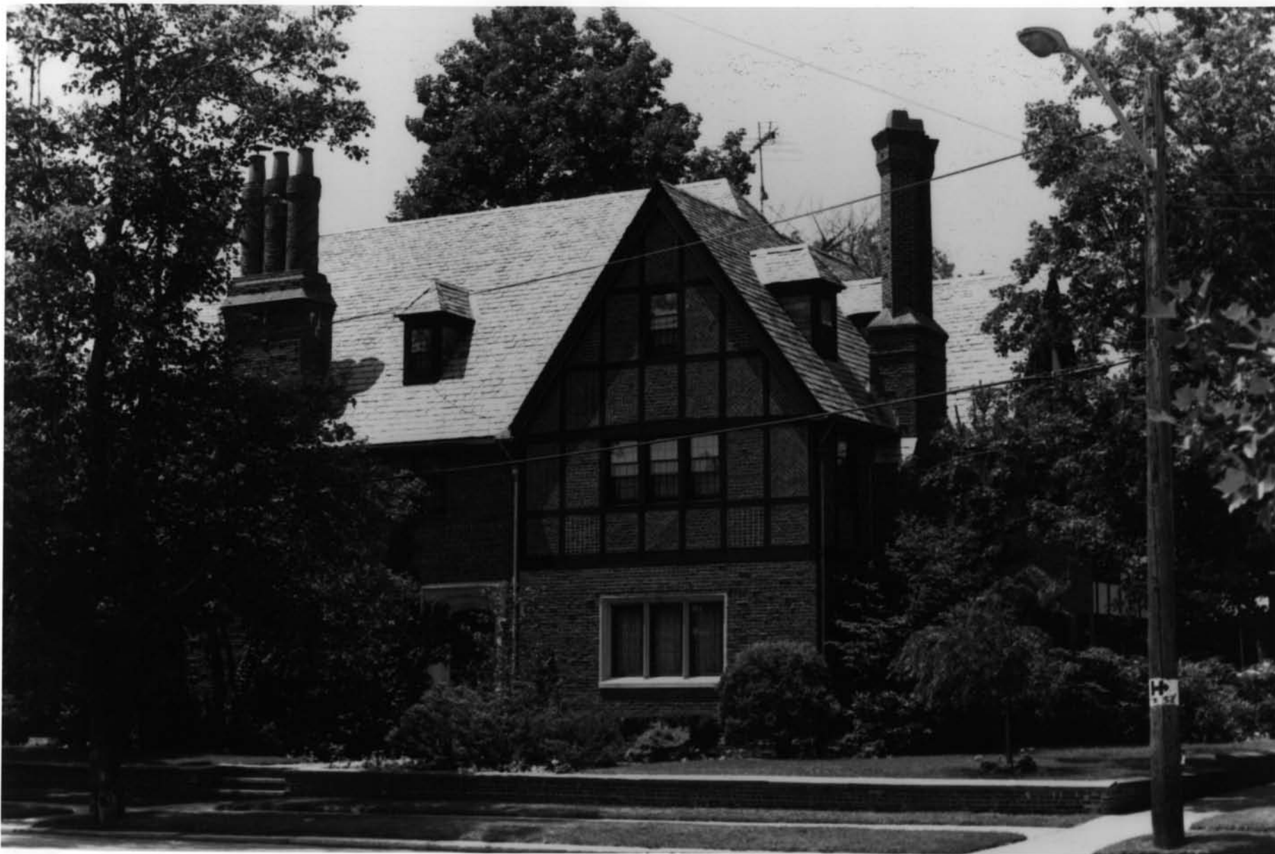
Blackstone Boulevard Realty Plat H. D. Providence County, Rhode Island Photo #3 of 13