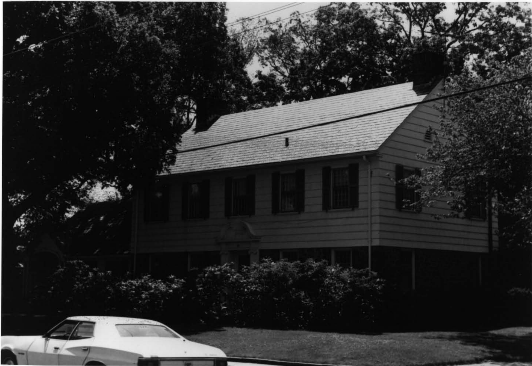
Blackstone Boulevard Realty Plot H.D. Providence County, Rhode Island Photo # 13 of 13