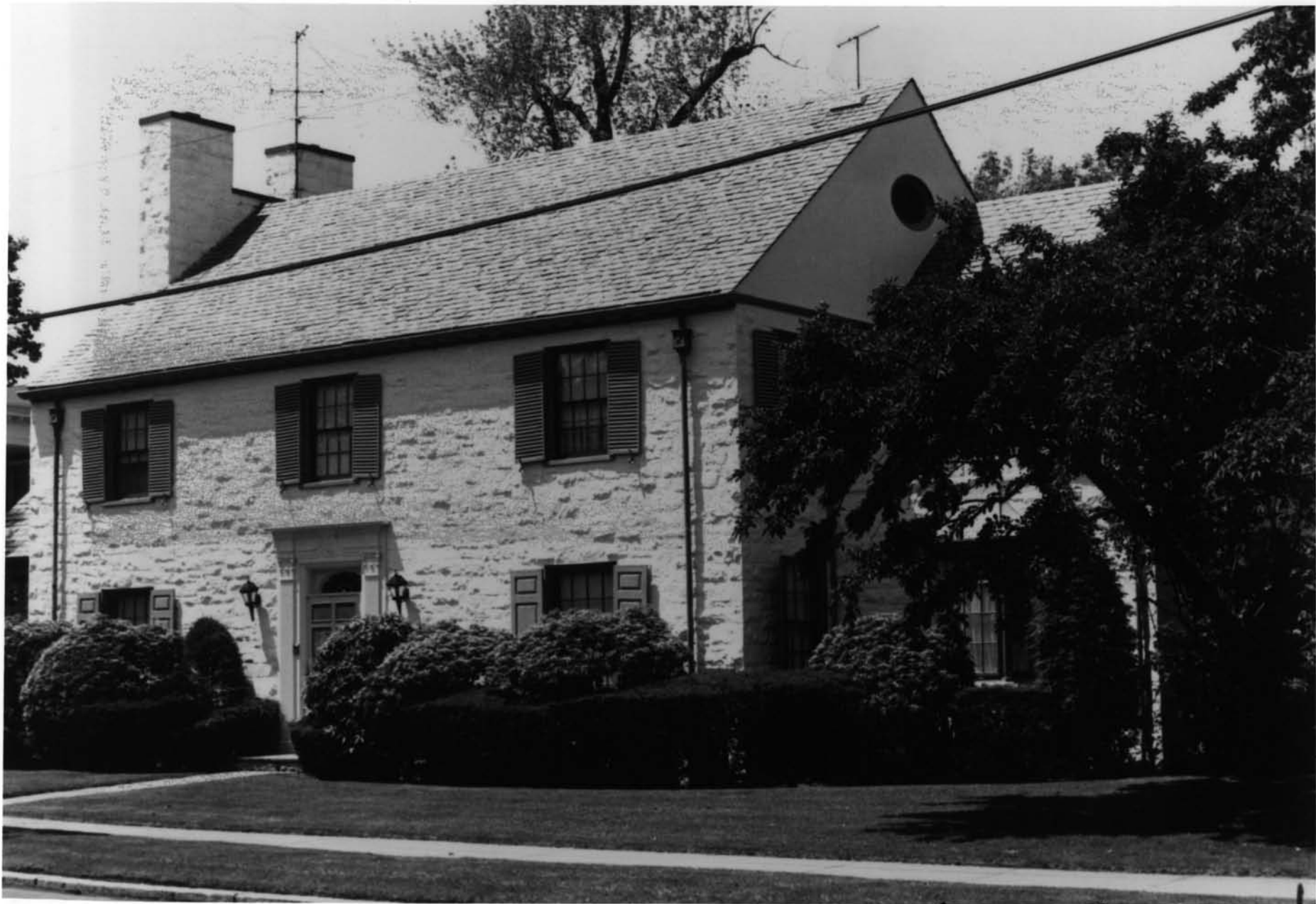
Blackstone Boulevard Realty Plot H D, Providence County, Rhode Island Photo # 9 of 13