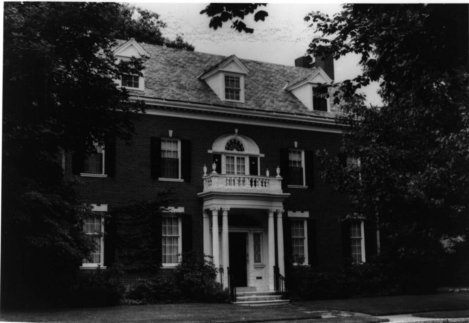
Blackstone Boulevard Realty Plot H. D. Providence County, Rhode Island Photo #10 of 13