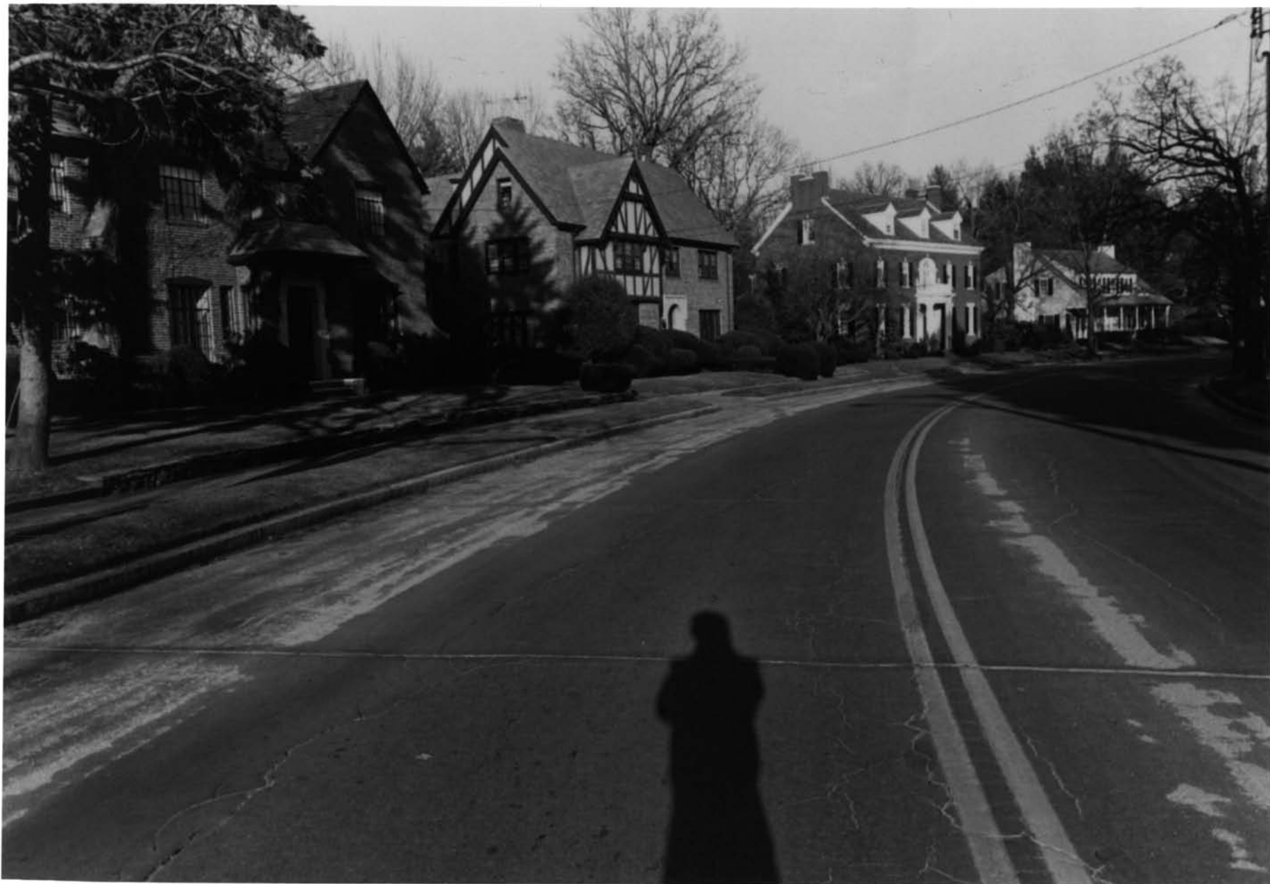
Blackstone Boulevard Realty Plat H. D. Providence County, Rhode Island Photo # 1 of 13