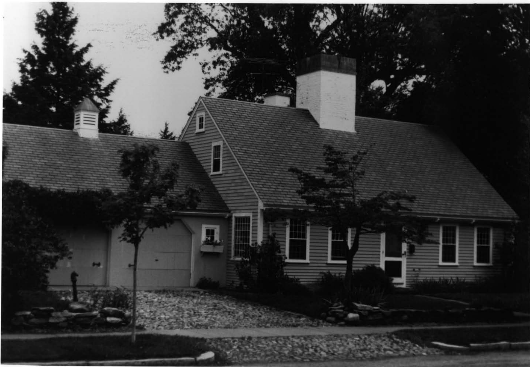
Blackstone Boulevard Realty Plat H.D. Providence County, Rhode Island Photo #12 of 13