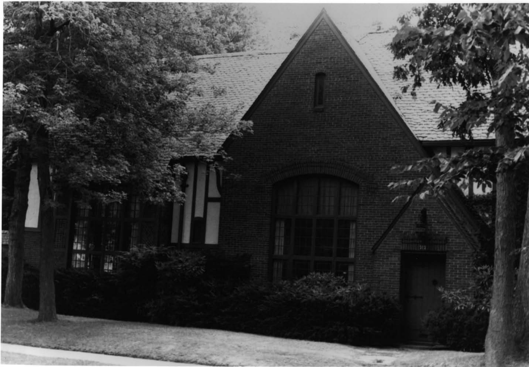
Blackstone Boulevard Realty Plat H.D. Providence County, Rhode Island Photo #7 of 13