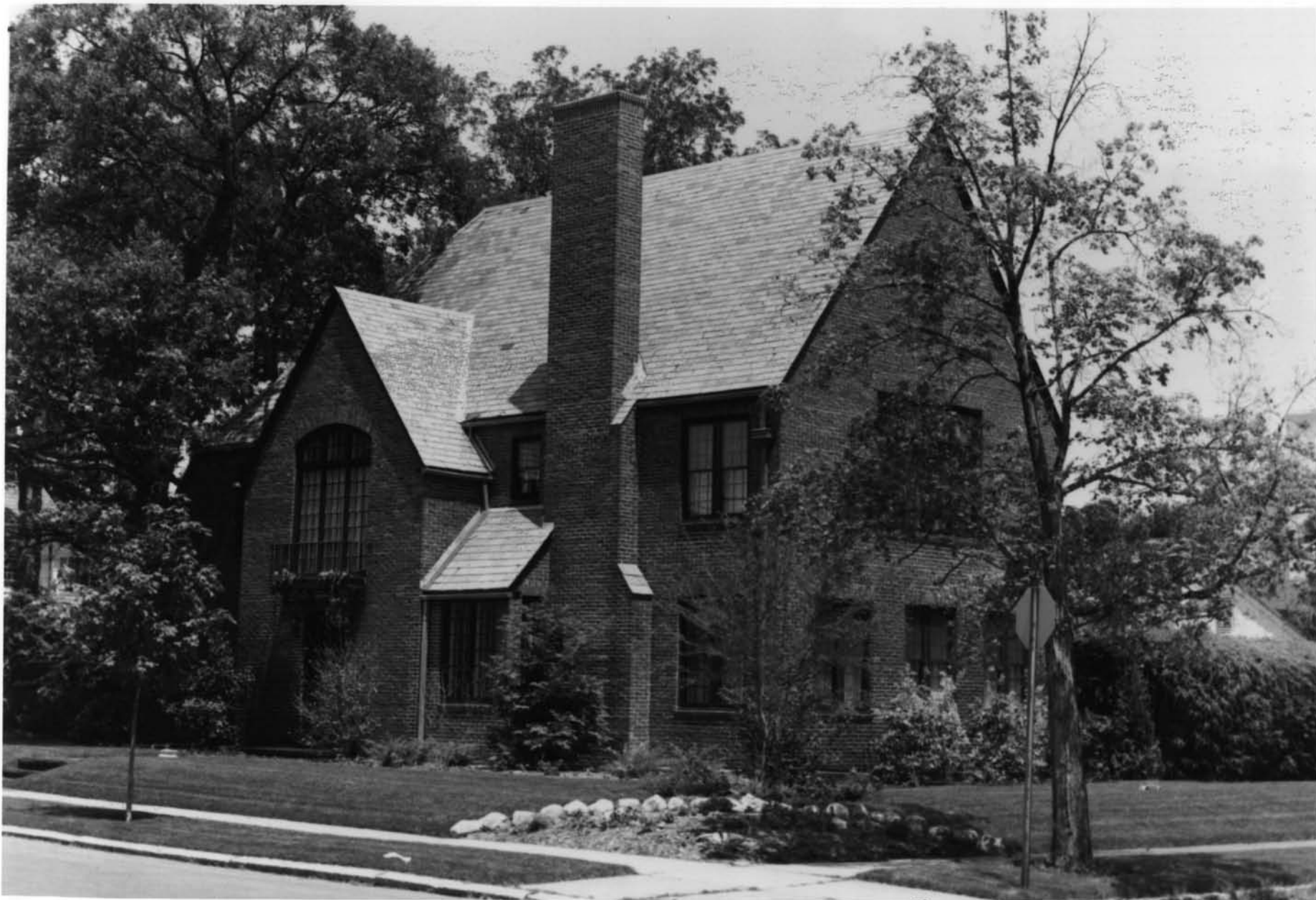
Blackstone Boulevard Realty Plat H. D. Providence County, Rhode Island Photo #4 of 13