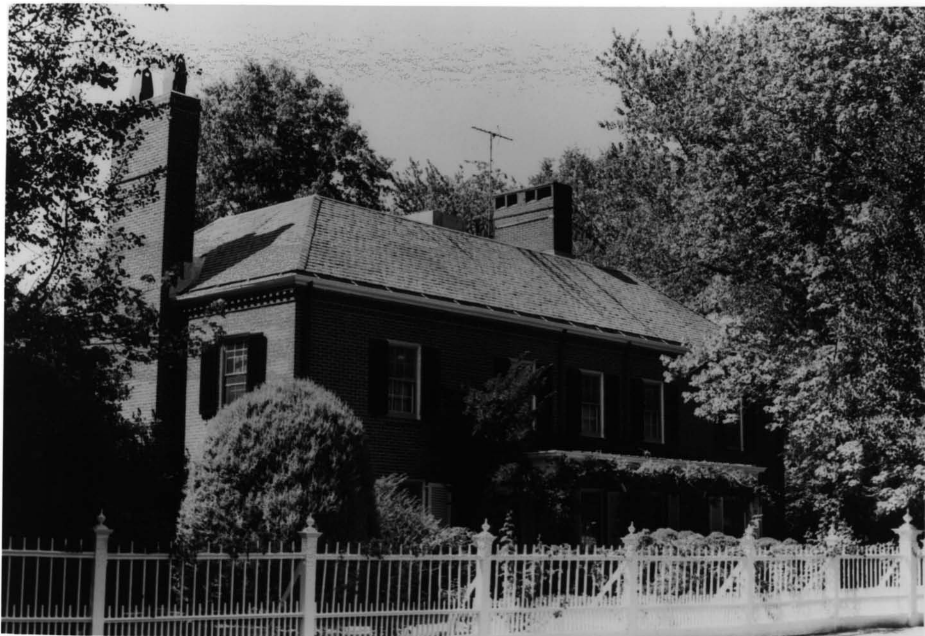
Blackstone Boulevard Realty Plat H. D. Providence County, Rhode Island Photo # 11 of 13