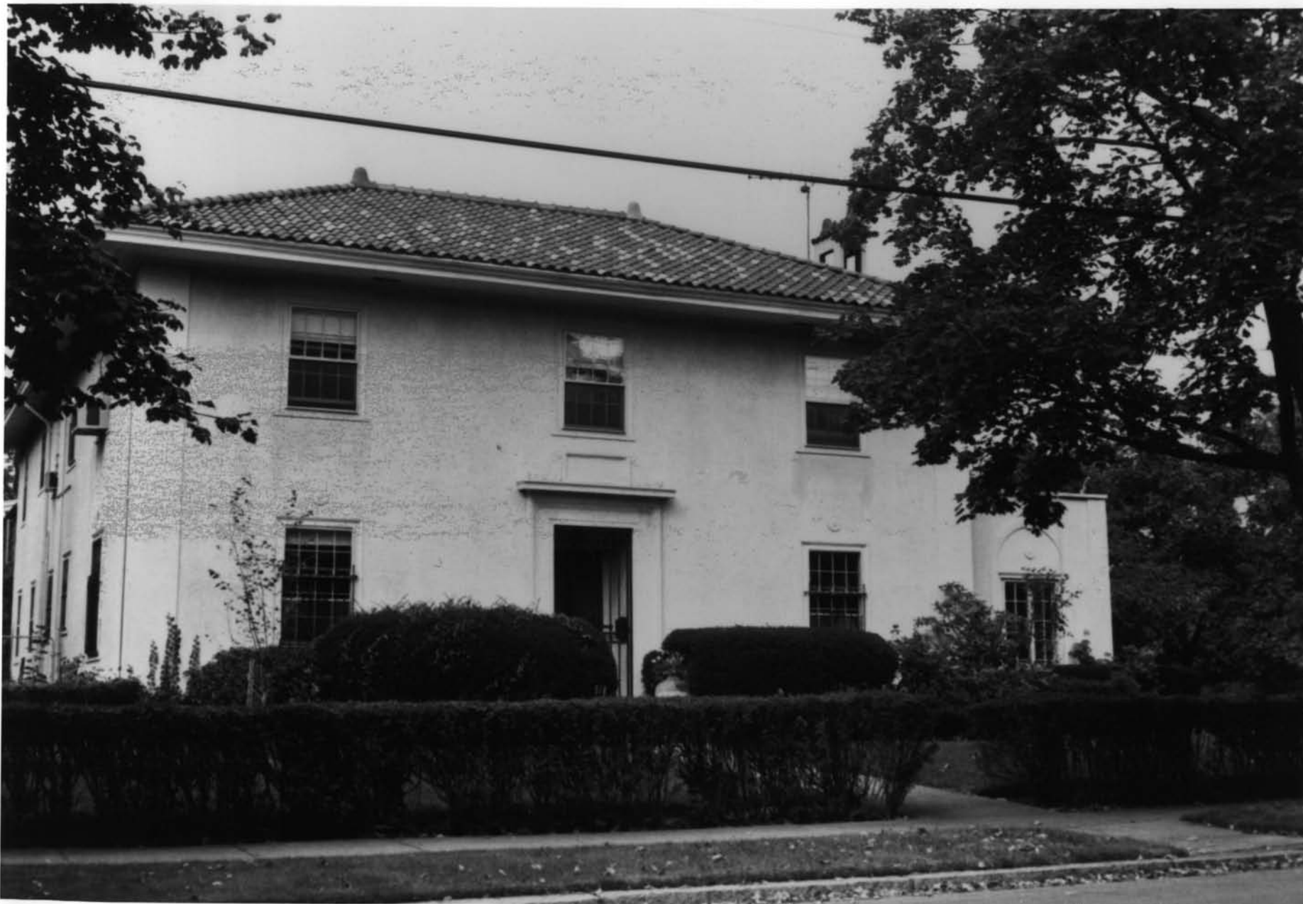
Bleakstone Boulevard Realty Plat H. D. Providence County, Rhode Island Photo #6 of 13