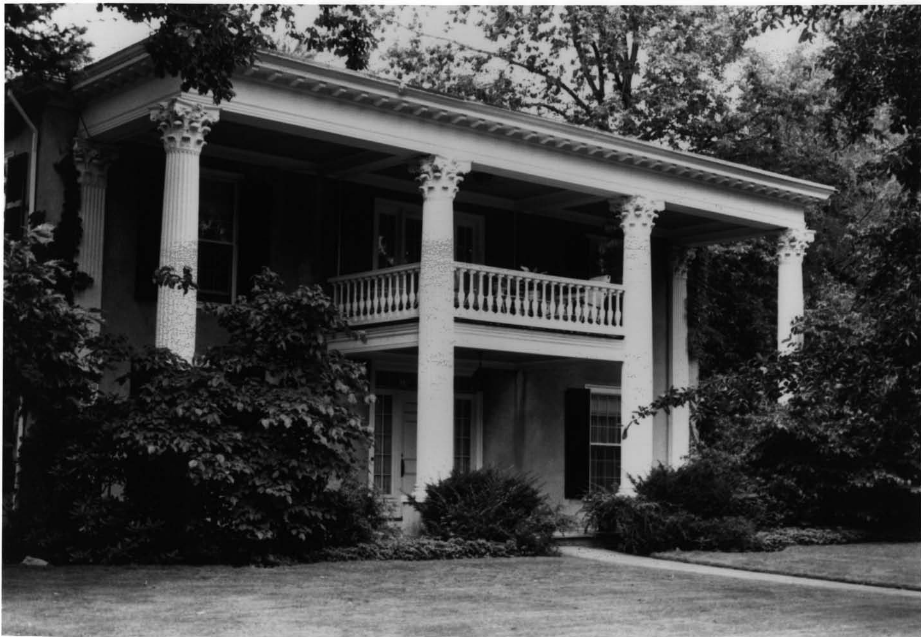
Blackstone Boulevard Realty Plot H. D. Providence County, Rhode Island Photo # 8 of 13