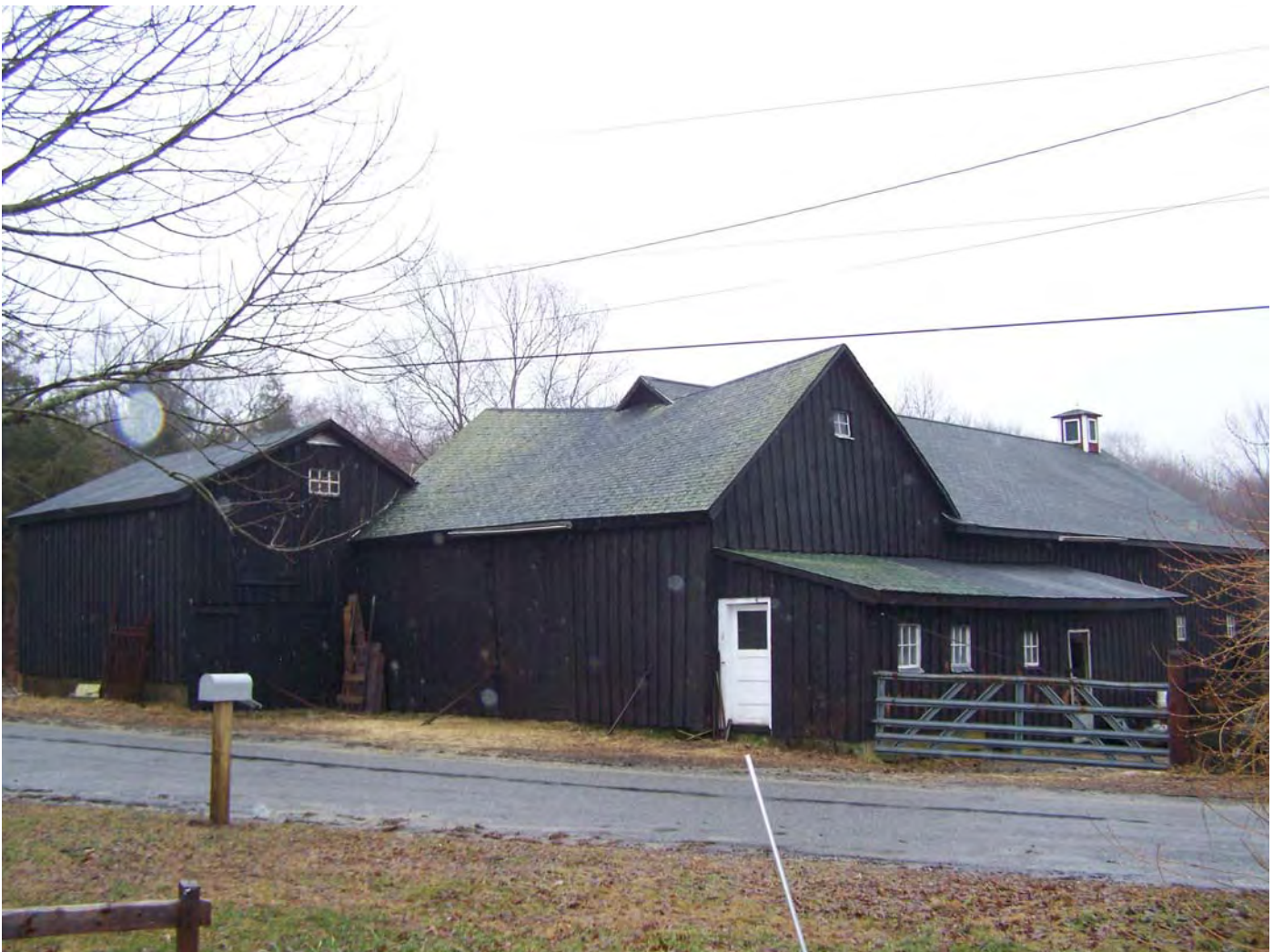
Photograph 9 of 17 Borders Farm, 31 North Road, Foster, Providence County, RI Allen Hill Farm Barn, view looking southeast R. Youngken, Photographer, 2007.