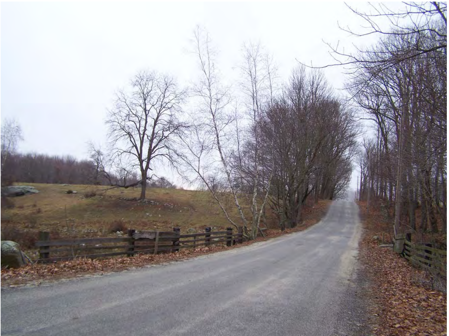
Photograph 2 of 17

Borders Farm, 31 North Road, Foster, Providence County, RI Fields on North Road, view looking east, R. Youngken, Photographer, 2007