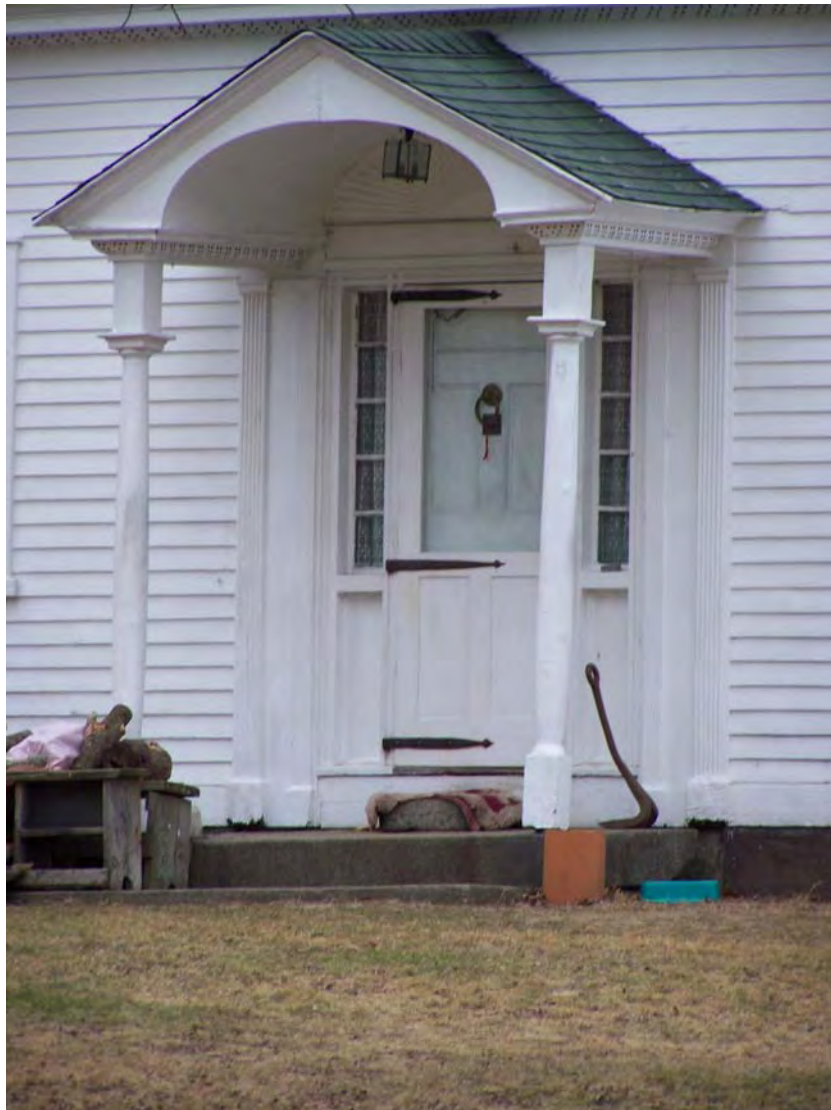
Photograph 4 of 17

Borders Farm, 31 North Road, Foster, Providence County, RI George Phillips House, detail of front porch, view looking northwest 2007