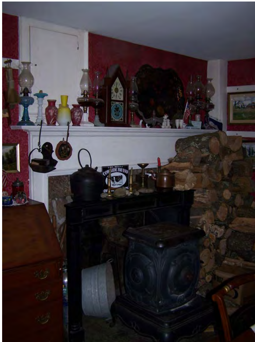
Photograph 11 of 17

Borders Farm, 31 North Road, Foster, Providence County, RI