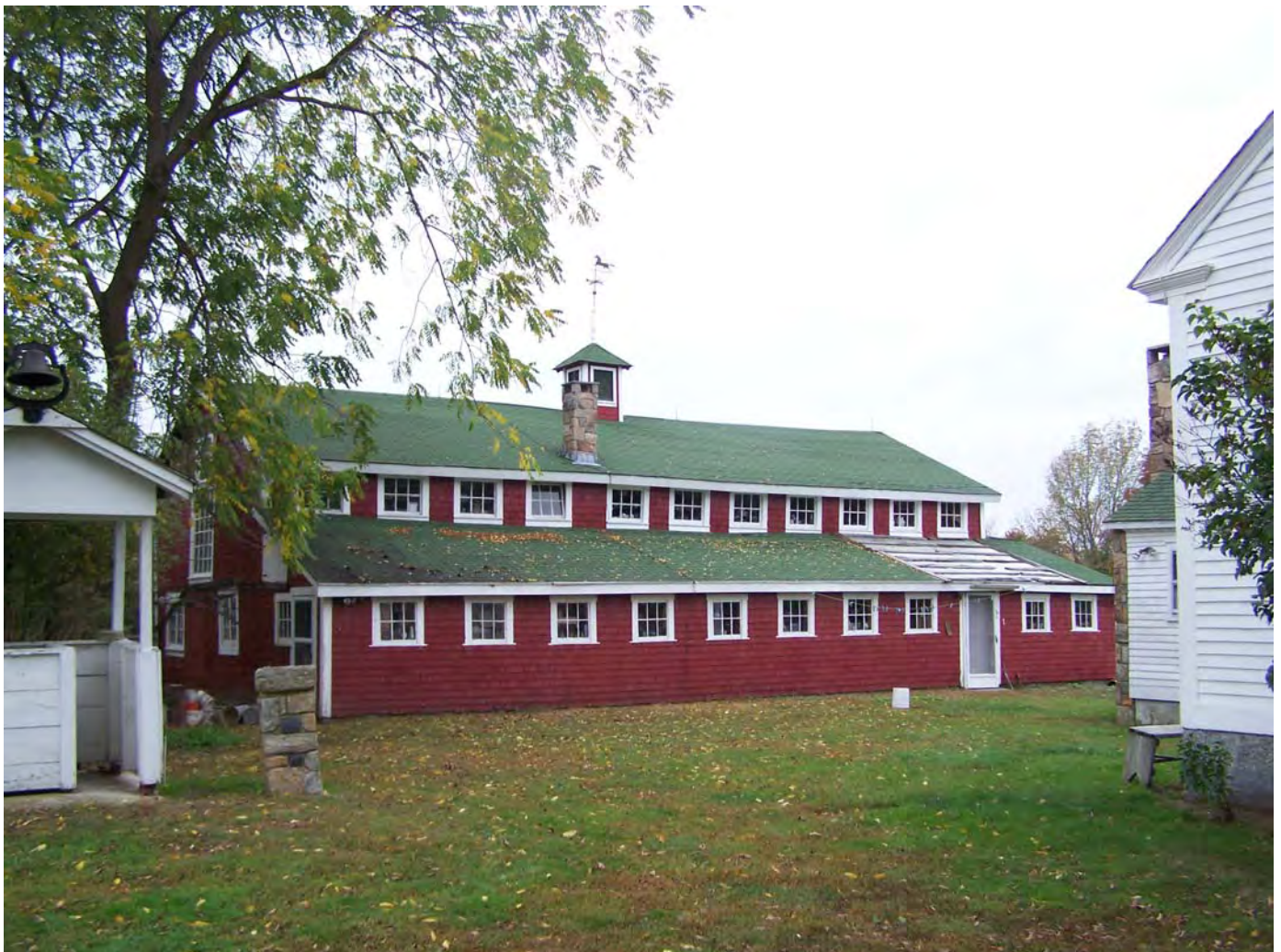
Photograph 5 of 17

Borders Farm, 31 North Road, Foster, Providence County, RI Carriage Barn, well house, view looking northeast 2007