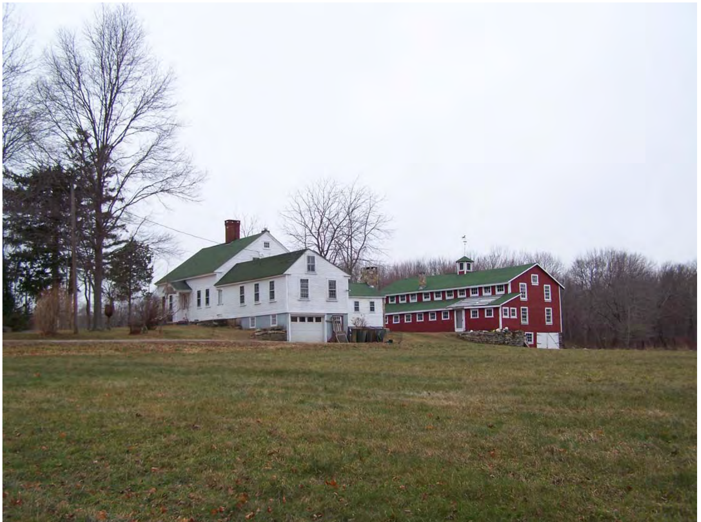
Photograph 1 of 17

Borders Farm, 31 North Road, Foster, Providence County, RI George Phillips House and Barn, view looking northwest, R. Youngken, Photographer, 2007