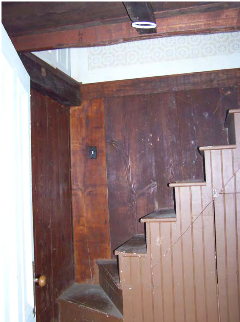
Photograph 17 of 17

Borders Farm, 31 North Road, Foster, Providence County, RI