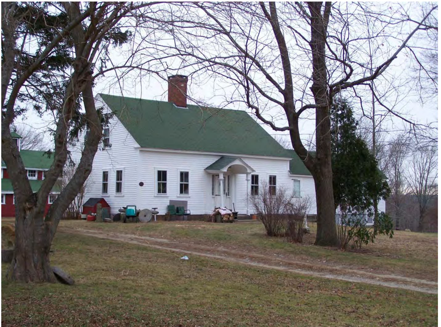
Photograph 3 of 17

Borders Farm, 31 North Road, Foster, Providence County, RI George Phillips House, view looking northeast R. Youngken, Photographer, 2007