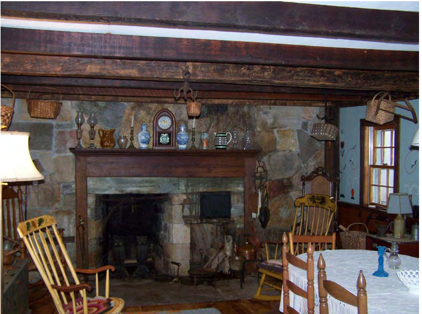
Photograph 13 of 17

Borders Farm, 31 North Road, Foster, Providence County, RI George Phillips House interior, view of summer kitchen looking north R. Youngken, Photographer, 2007.