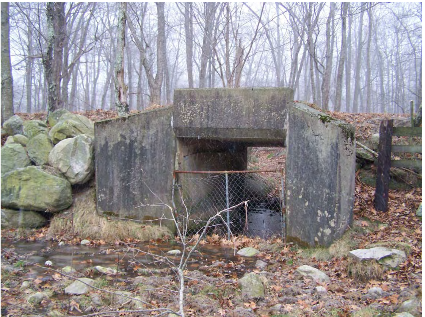
Photograph 6 of 17

Borders Farm, 31 North Road, Foster, Providence County, RI Dry Bridge, North Road, view looking southeast R. Youngken, Photographer, 2007