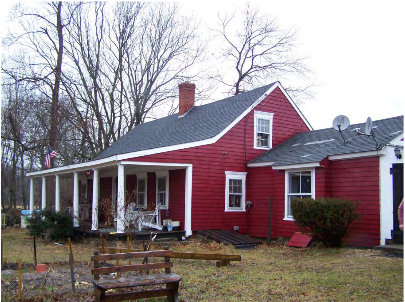
Photograph 7 of 17

Borders Farm, 31 North Road, Foster, Providence County, RI Allen Hill Farm House I, view looking northwest R. Youngken, Photographer, 2007