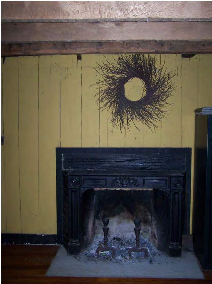
Photograph 16 of 17

Borders Farm, 31 North Road, Foster, Providence County, RI