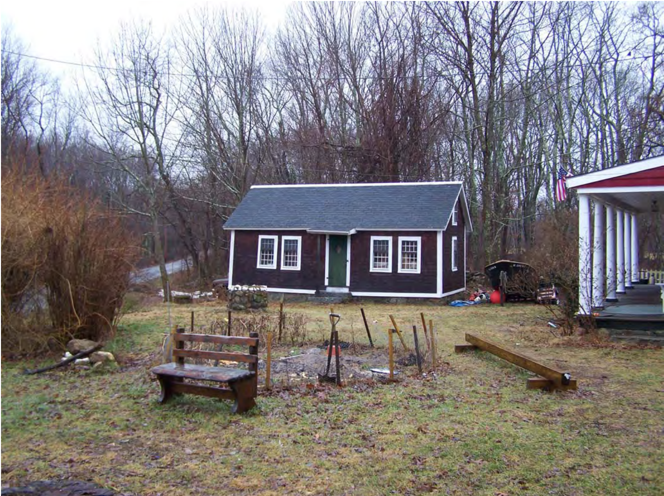
Photograph 8 of 17

Borders Farm, 31 North Road, Foster, Providence County, RI Allen Hill Farm House II, view looking west R. Youngken, Photographer, 2007