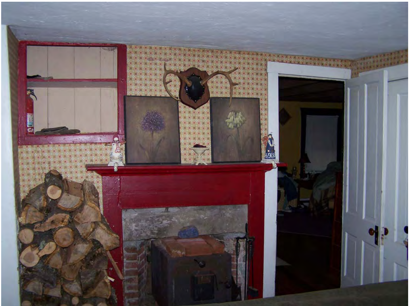
Photograph 15 of 17

Borders Farm, 31 North Road, Foster, Providence County, RI