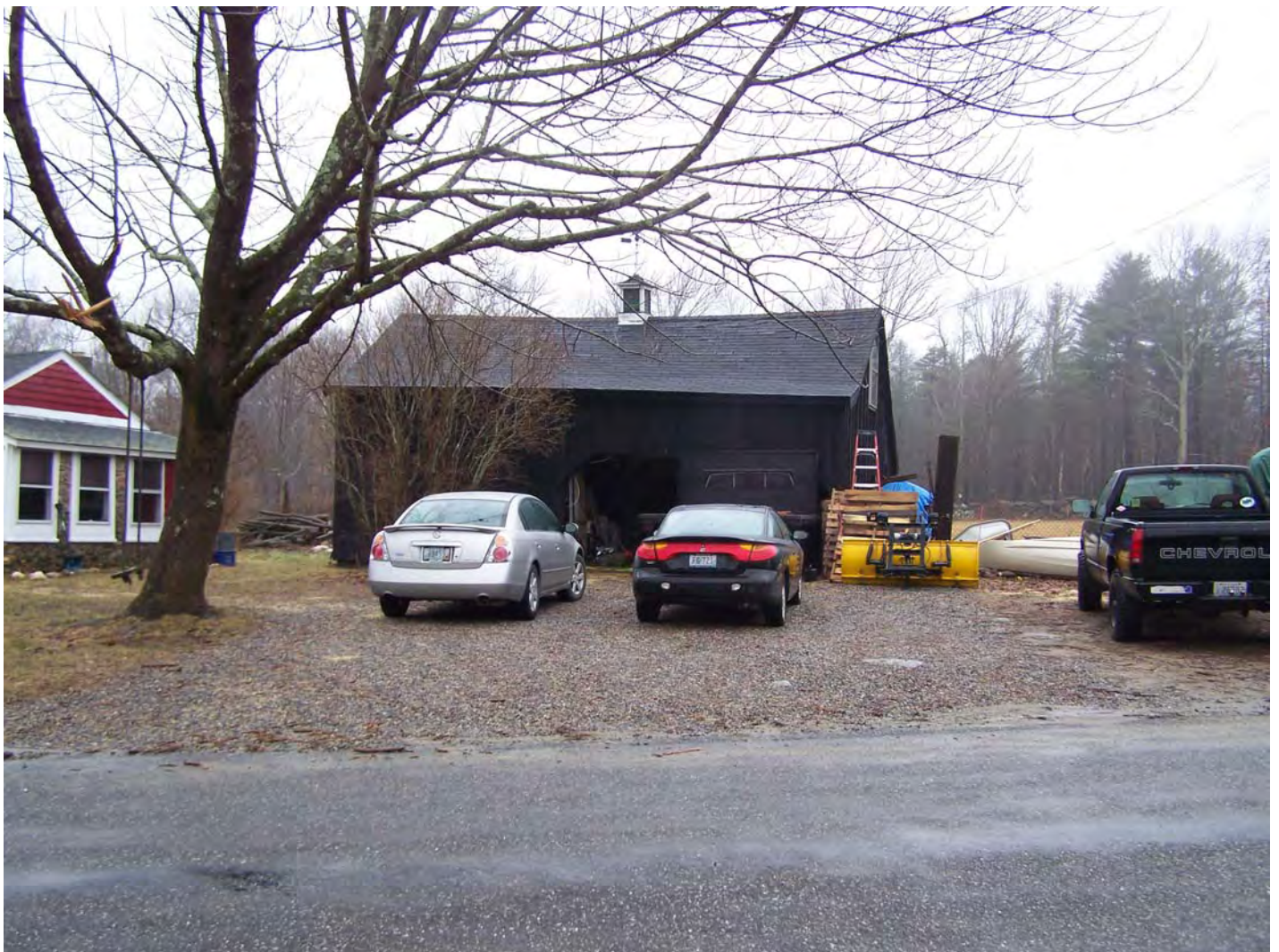
Photograph 10 of 17

Borders Farm, 31 North Road, Foster, Providence County, RI