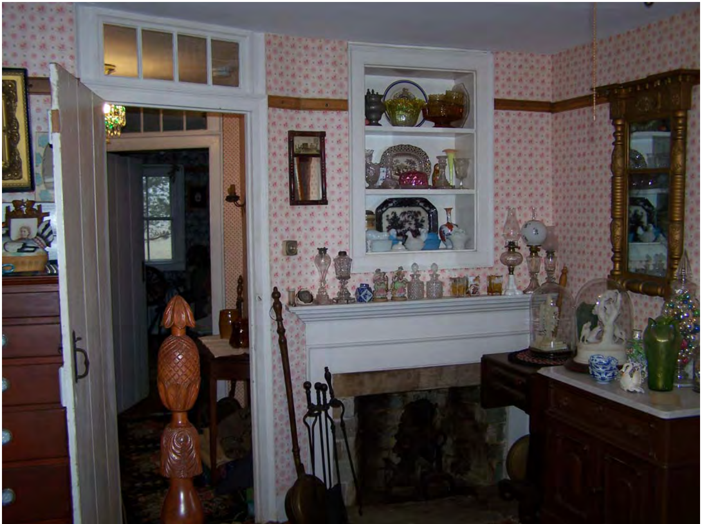
Photograph 14 of 17

Borders Farm, 31 North Road, Foster, Providence County, RI