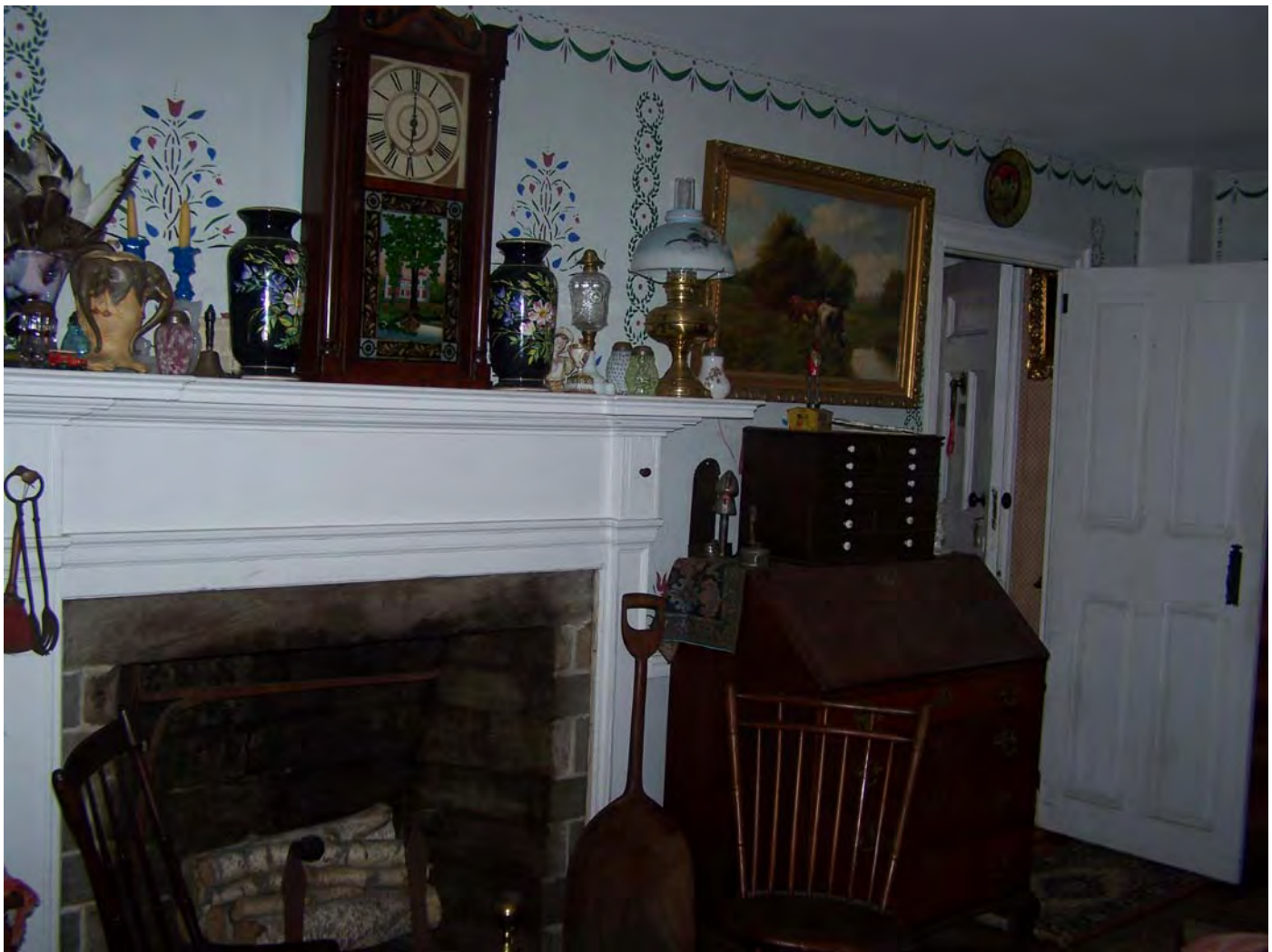
Photograph 12 of 17

Borders Farm, 31 North Road, Foster, Providence County, RI