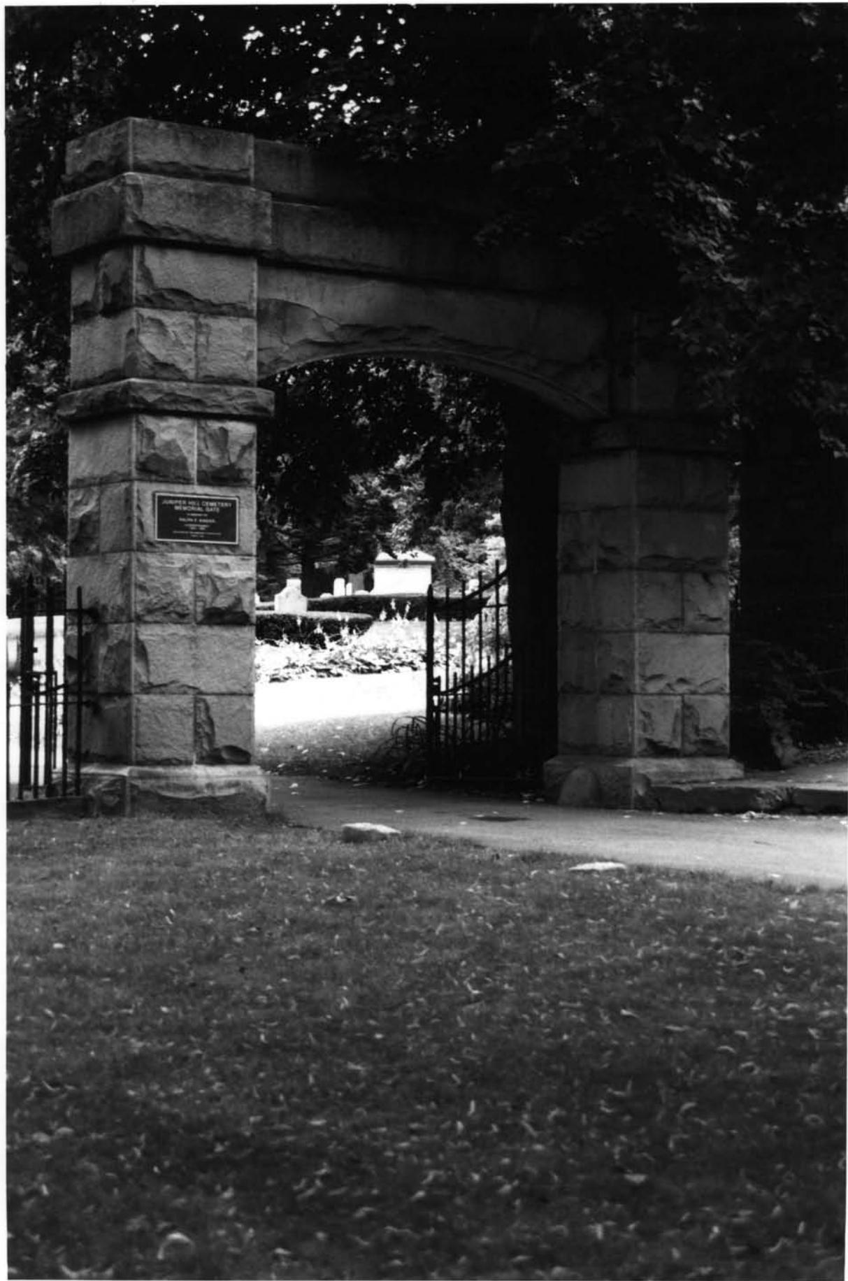
Juniper Hill Cemetery Bristol County Bristol, RI Photo # 1 of 10