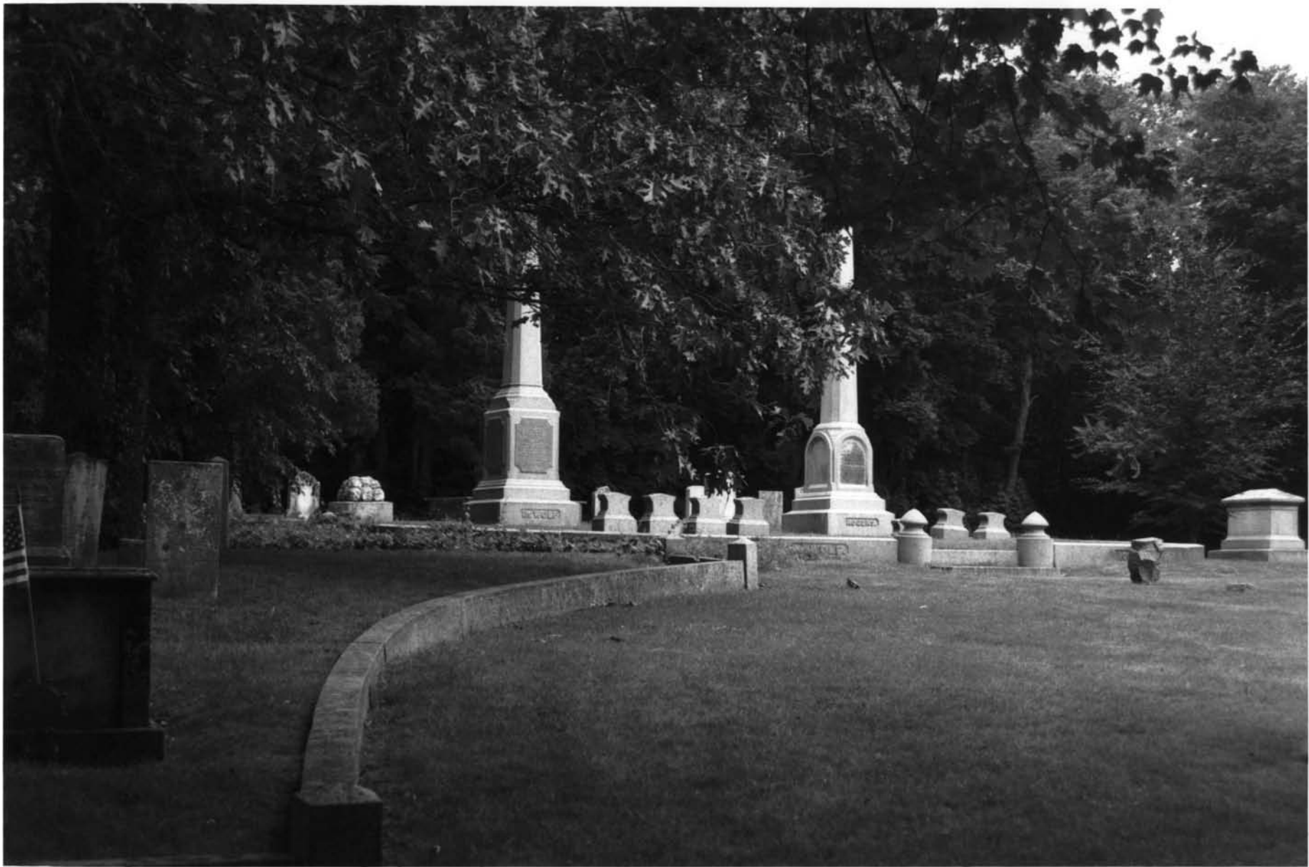
Juniper Hill Cemetery Bristol County Bristol, RI photo # 3 of 10