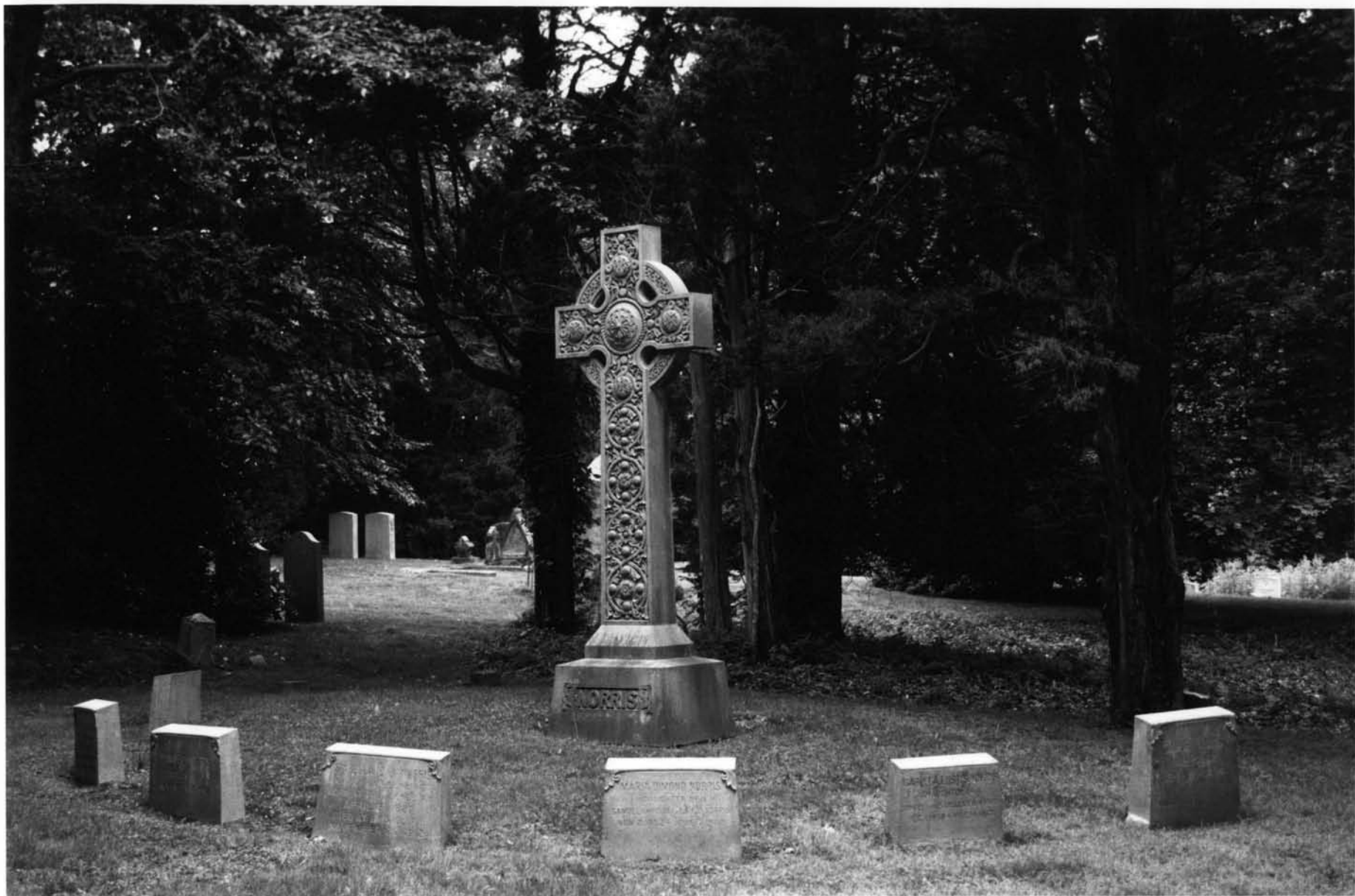
Juniper Hill Cemetery Bristol County Bristol, RI Photo # 7 of 10