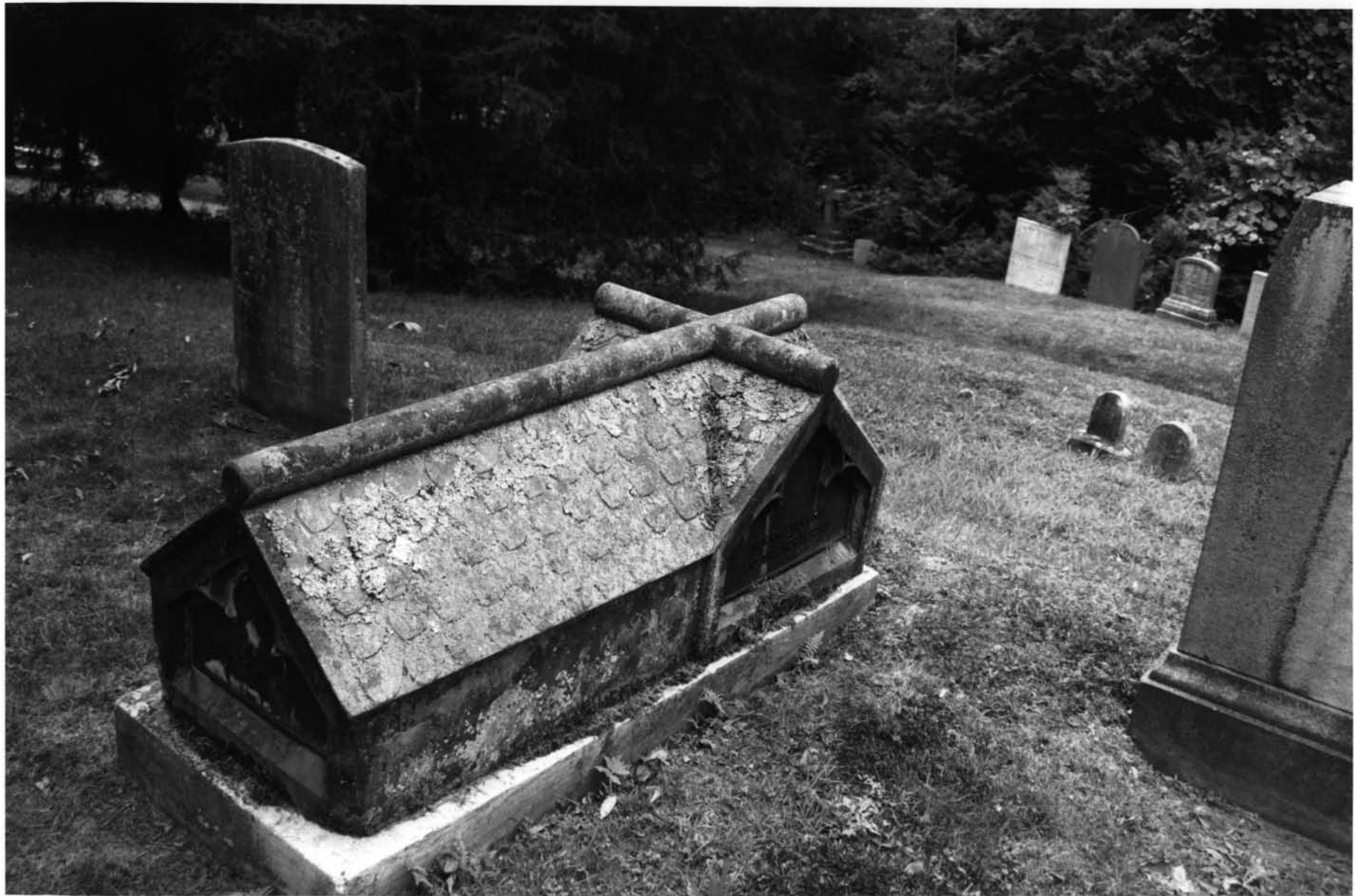
Juniper Hill Cemetery Bristol County Bristol, RI photo #6 of 10