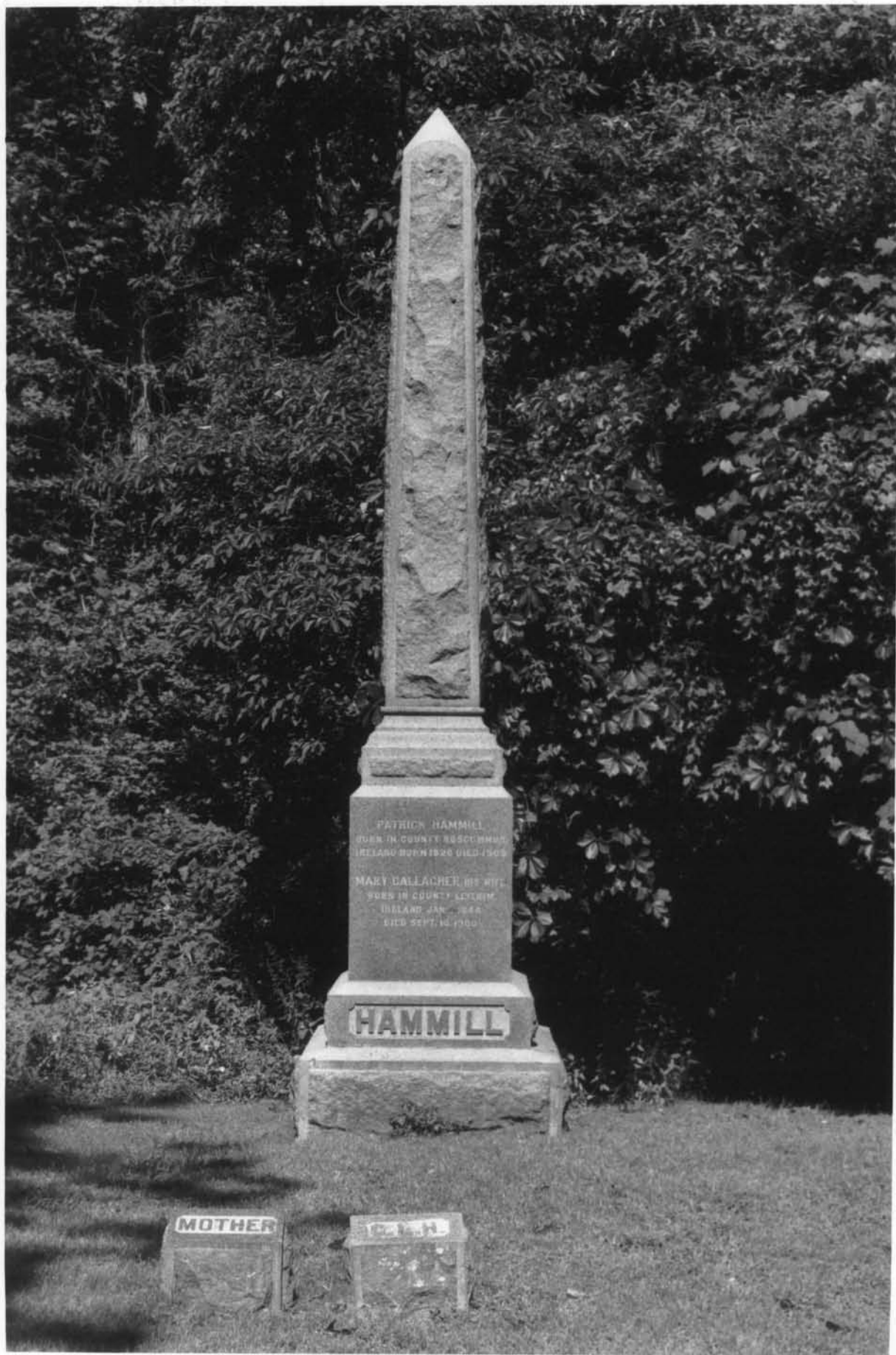
Juniper Hill Cemetery Bristol County Bristol, R.I. Photo # 8 of 10