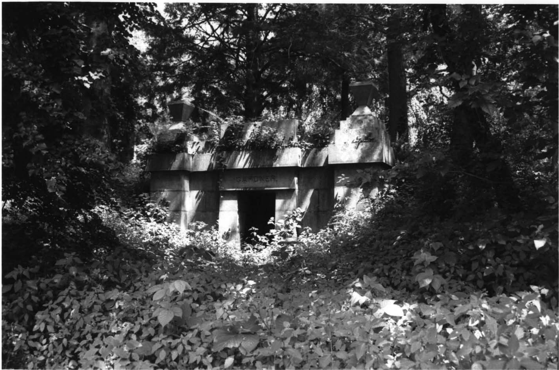
Juniper Hill Cemetery Bristol County Bristol, RI photo #5 of 10