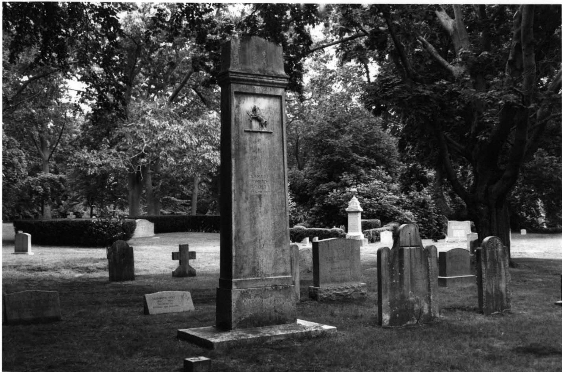
Juniper Hill Cemetery Bristol County Bristol, RI Photo # 10 of 10