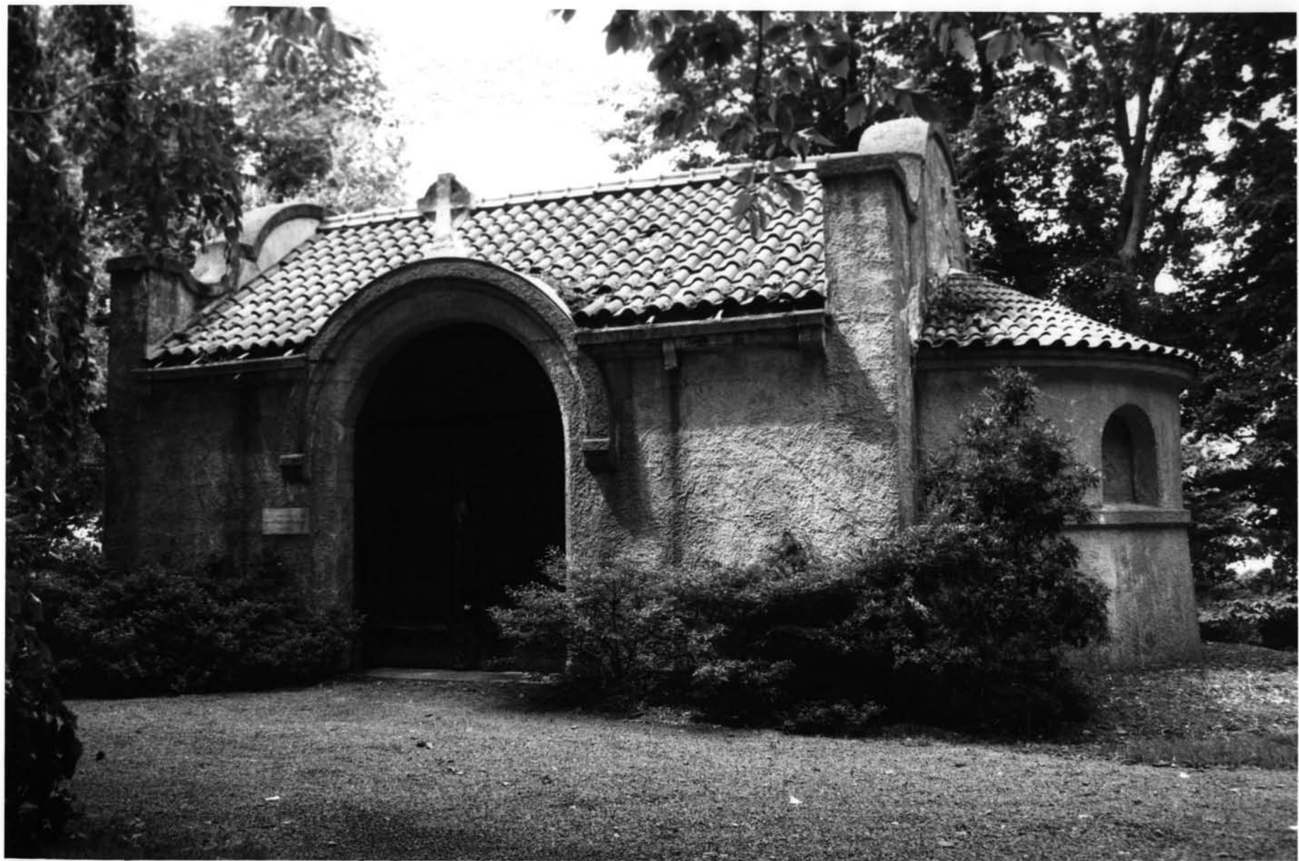
Juniper Hill Cemetery Bristol County Bristol, RI Photo # 2 of 10