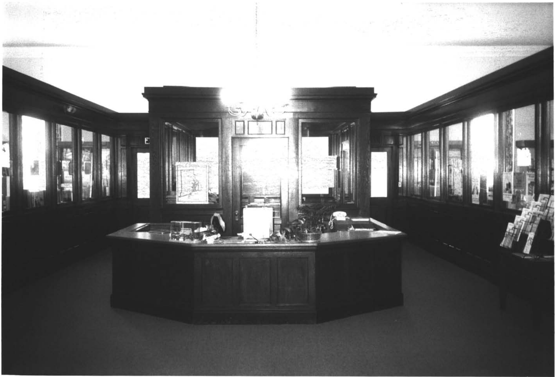
Wanskuck Branch Library Providence City, Prov., R. I. Photo #3 of 3