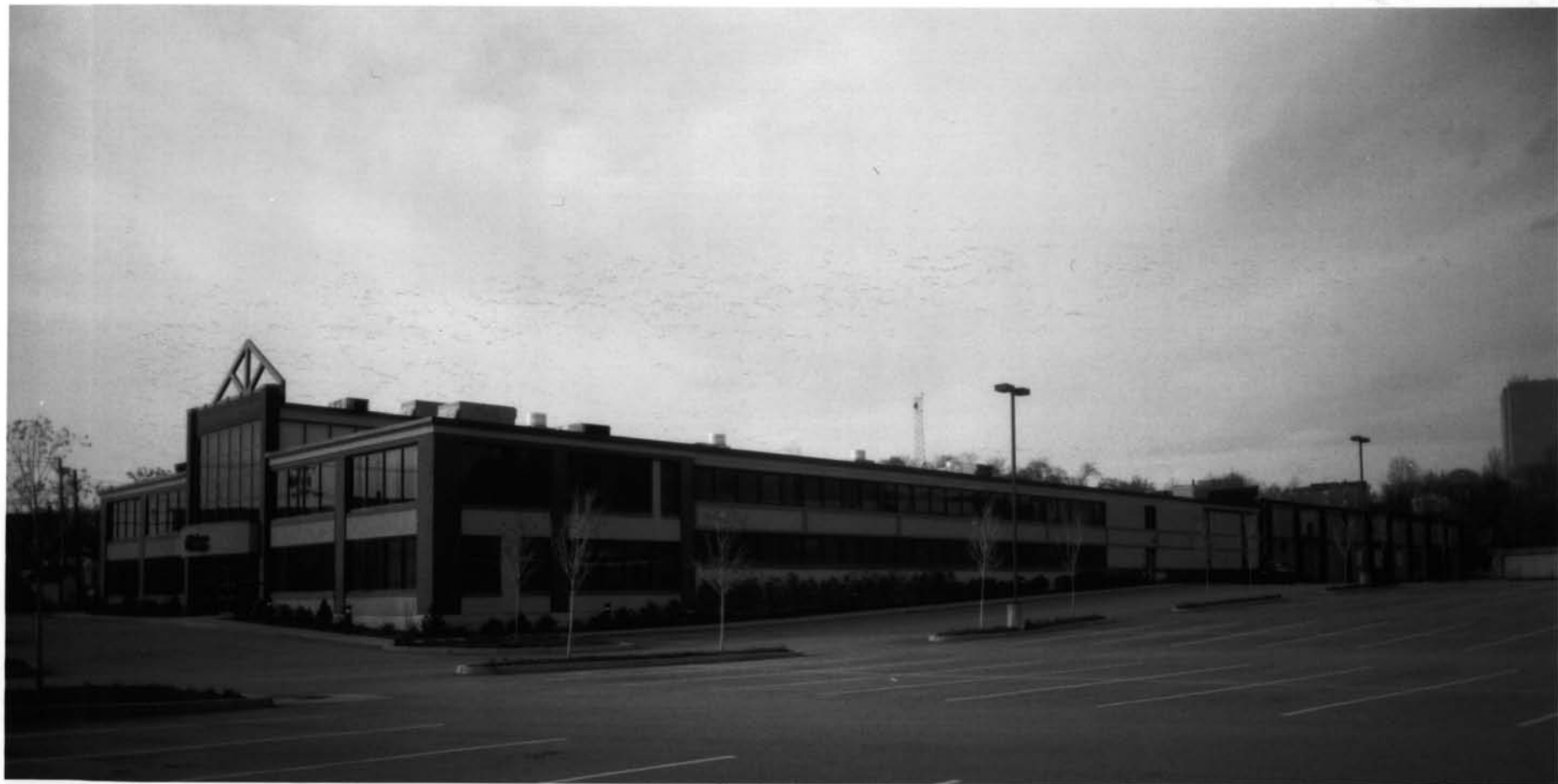
Brown + Sharpe Mfg. Co. Complex Providence County, Providence, R.I. Photo # 13 of 16