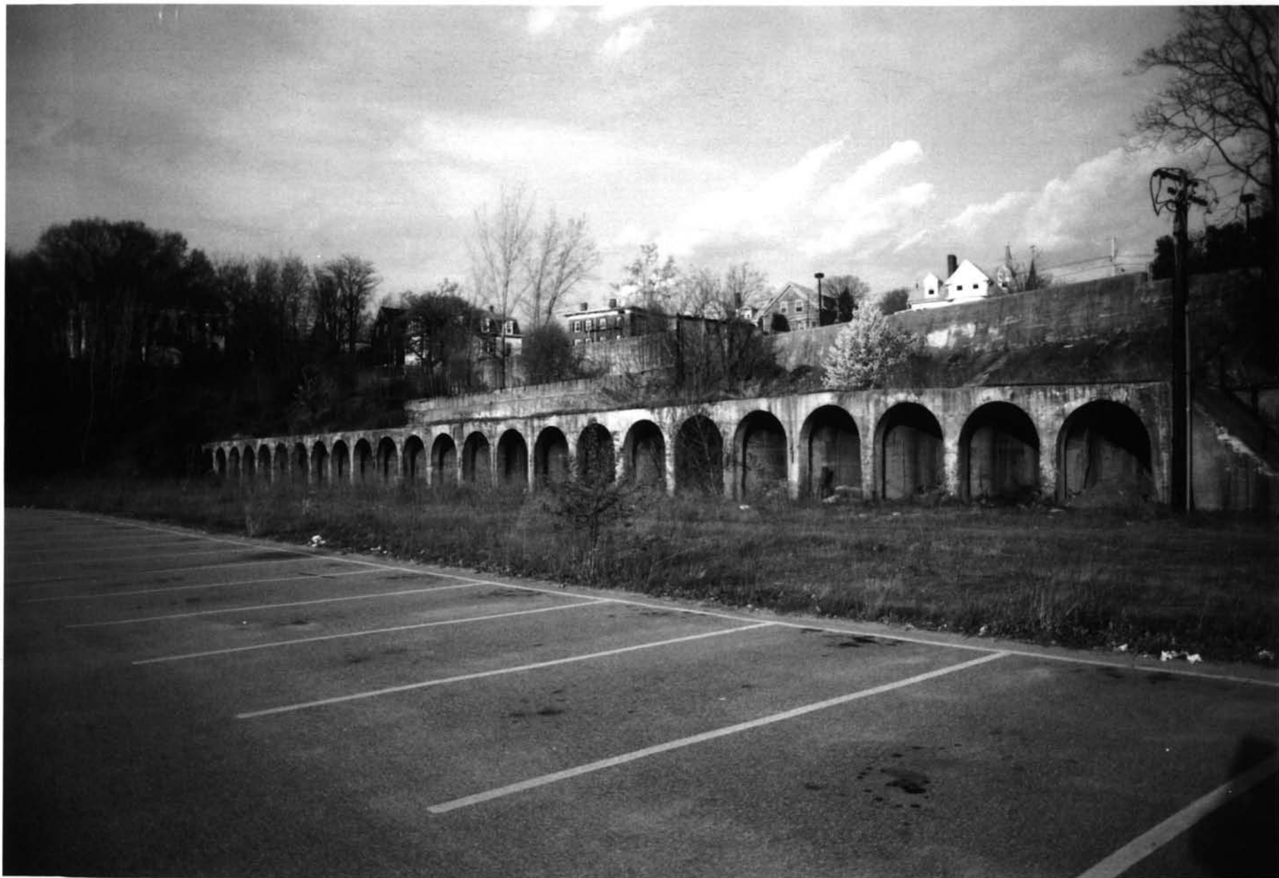
Brown + Sharpe Mfg. Co. Complex Providence County, Providence, R.I. Photo #12 of 16