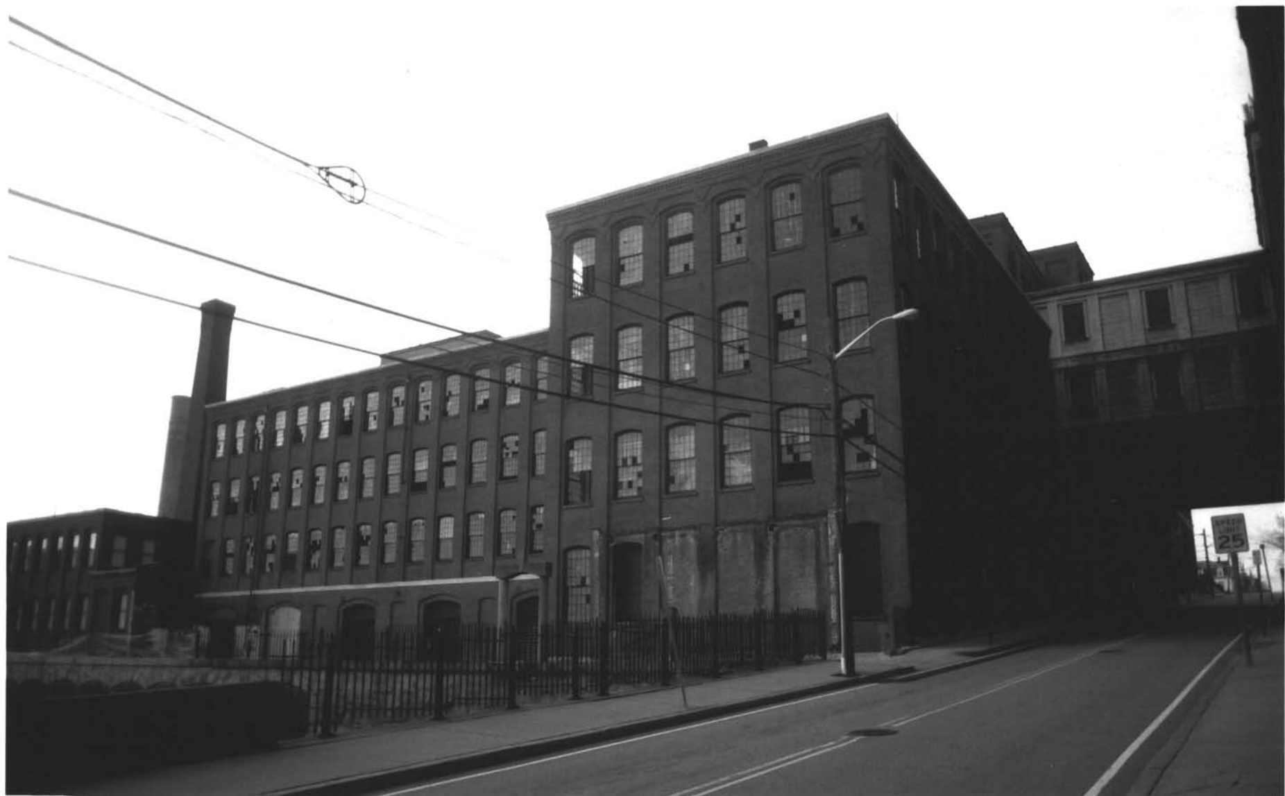
Brown + Sharpe Manufacturing Co. Complex Providence County, Providence, R.I. Photo # 2 of 16