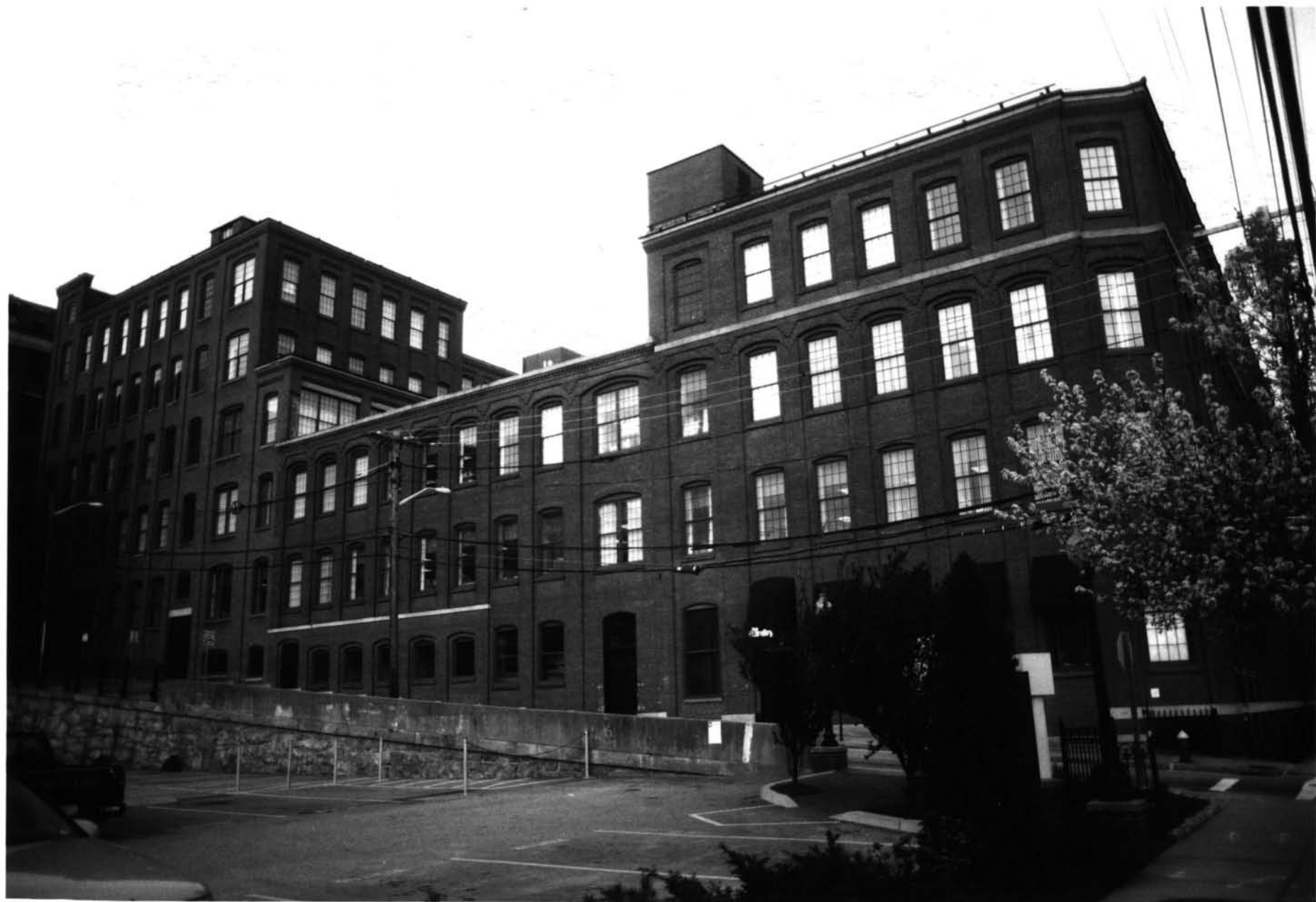
Brown & Sharpe Manufacturing Co. Complex Providence County, Providence, R.I. Photo #1 of 16