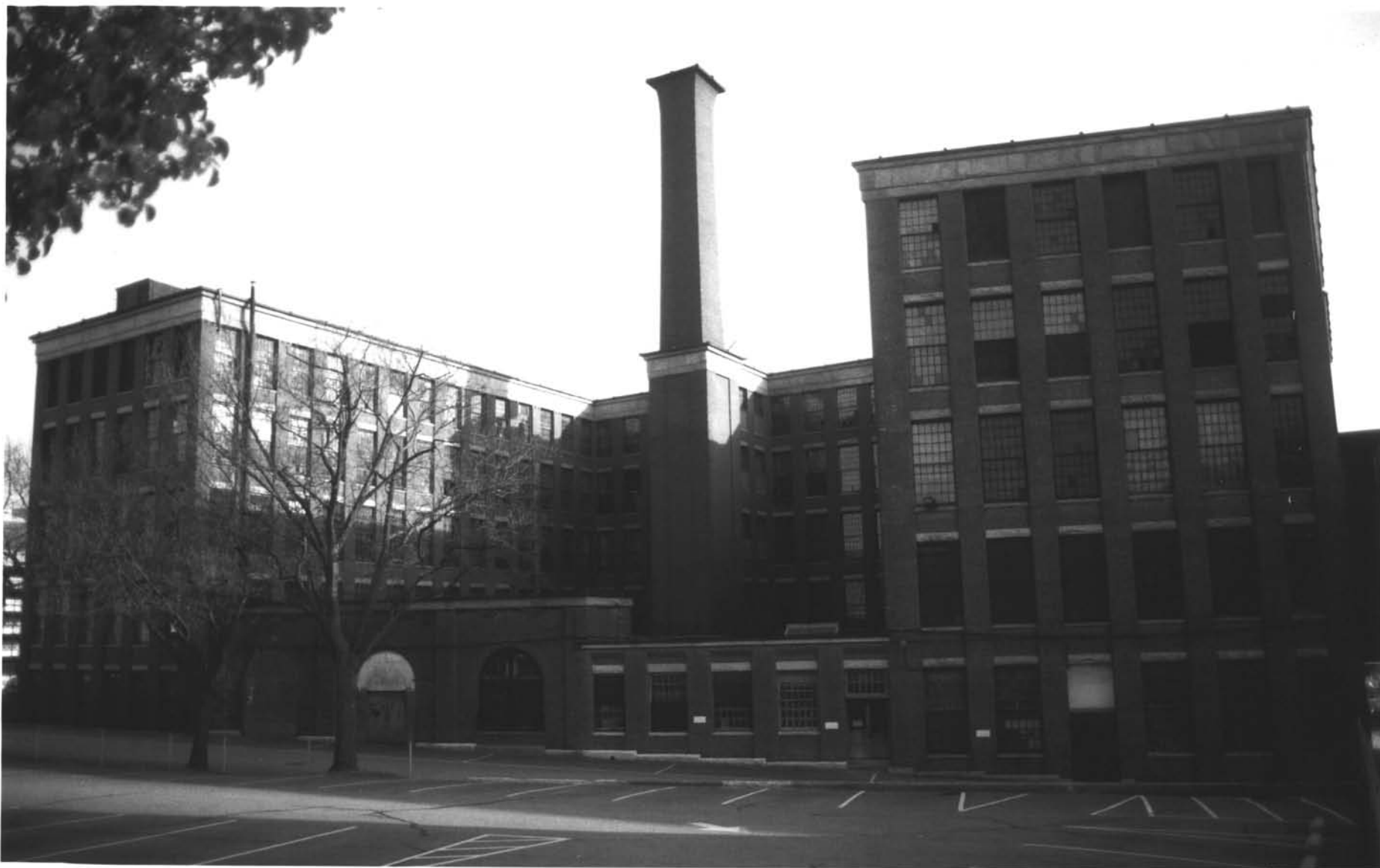
Brown + Shorge mfg. Co. Complex Providence County, Providence, RI Photo # 7 of 16.