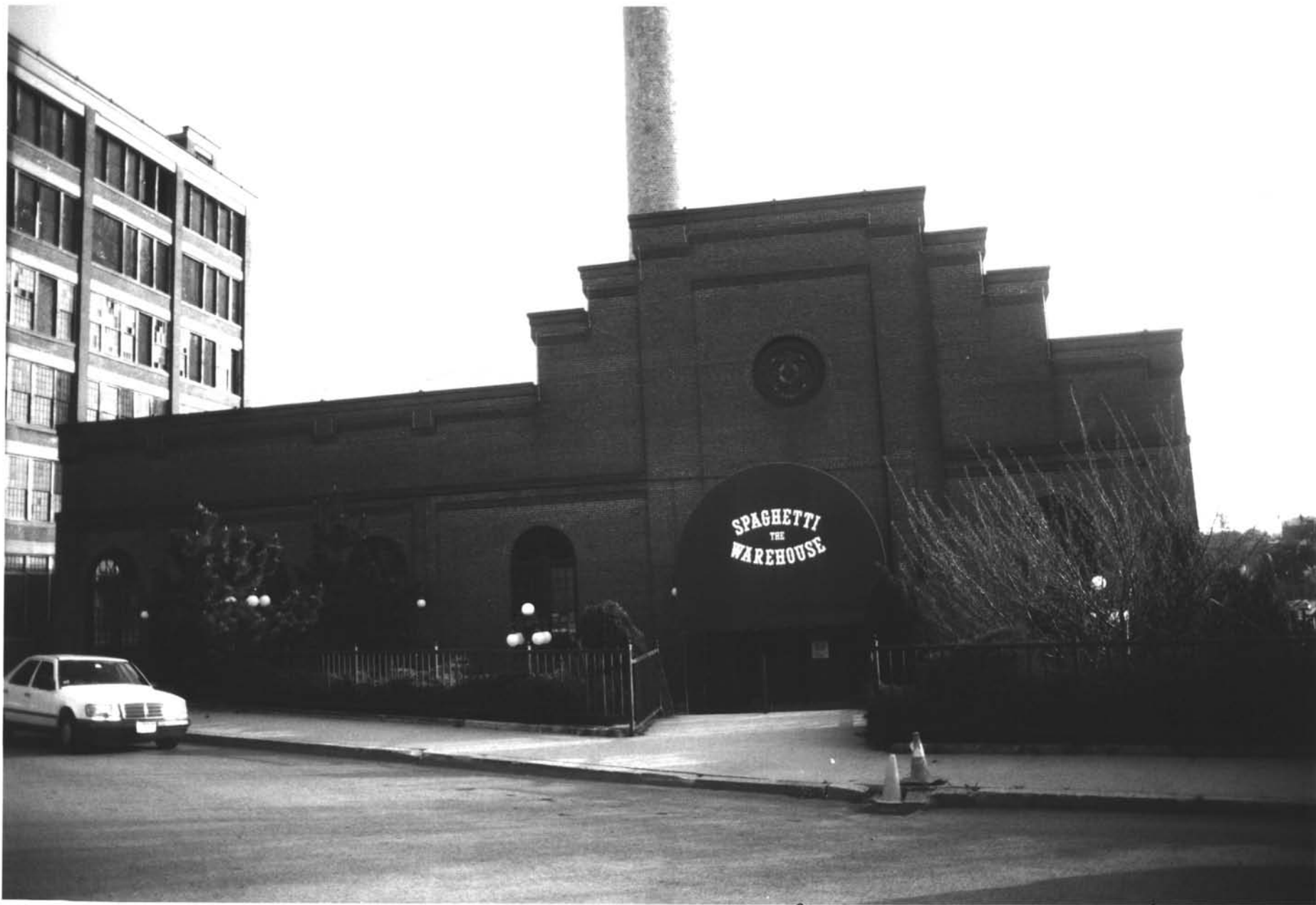
Brown + Sharpe mfg. Co. Complex Providence County, Providence, R.I. Photo # 14 of 16