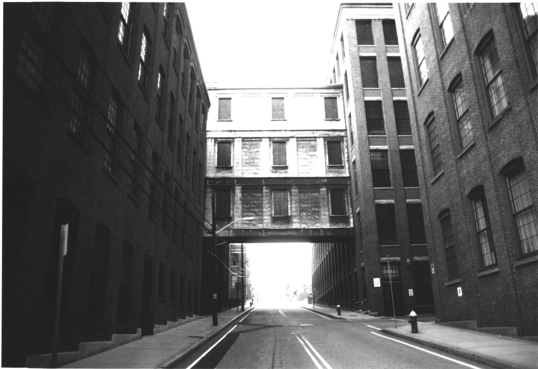
Brown + Sharpe Mfg. Co. Complex Providence County, Providence, R.I. Photo # 5 of 16