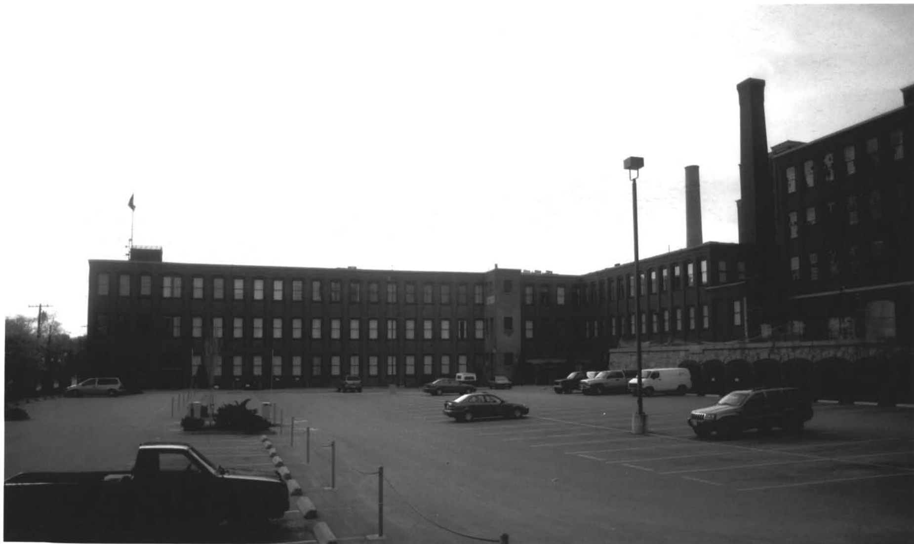
Brown & Sharpe Mfg. Co. Complex Providence County, Providence, RI Photo # 6 of 16