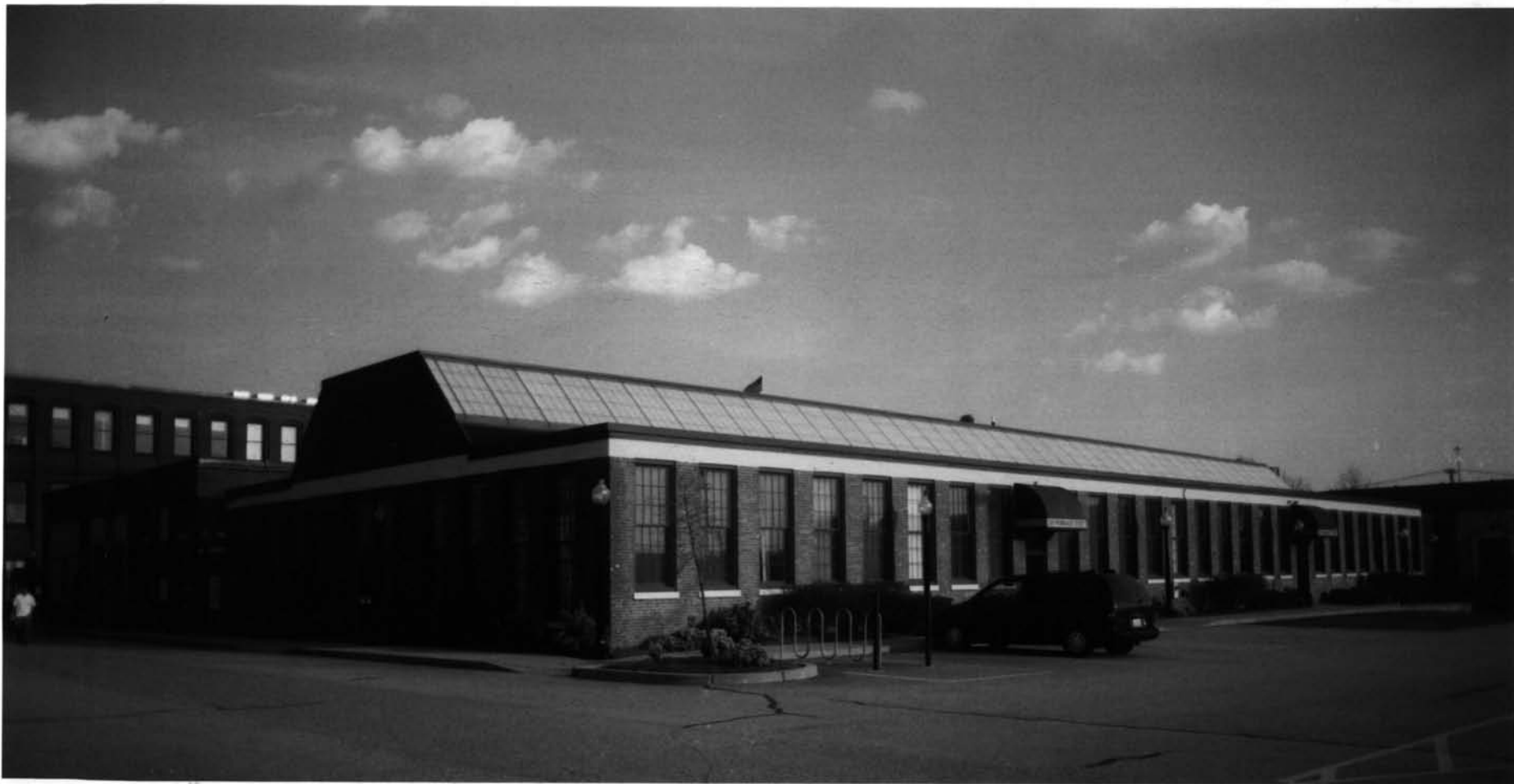
Brown + Sharpe Mfg. Co. Complex Providence County, Providence, RI Photo # 10 of 16