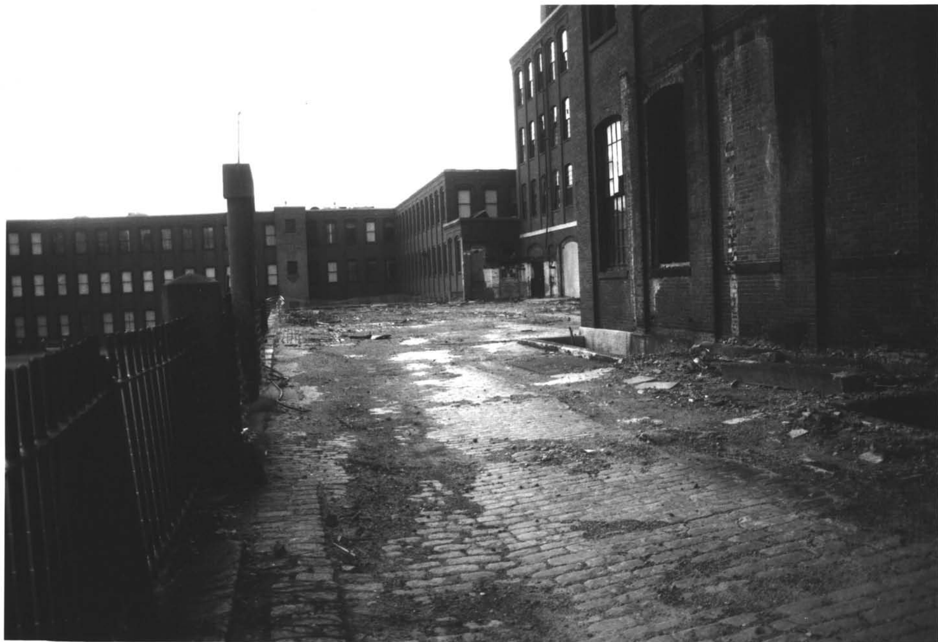
Brown + Shorge Manufacturing Co. Complex Providence County, Providence, R.I. Photo #3 of 16