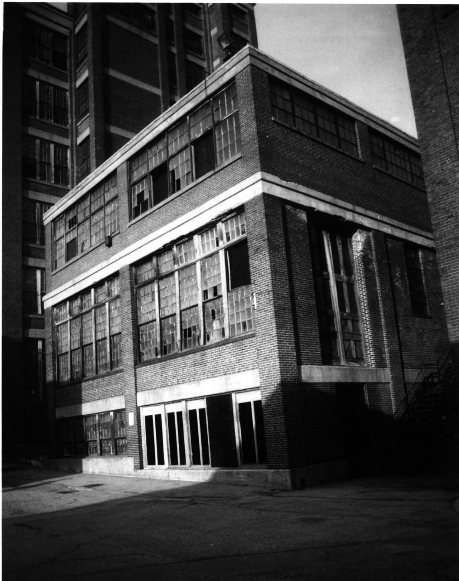
Brown & Sharpe Mtg. Co. Complect. Providence County, Prov., R.I. Photo # 9 of 16