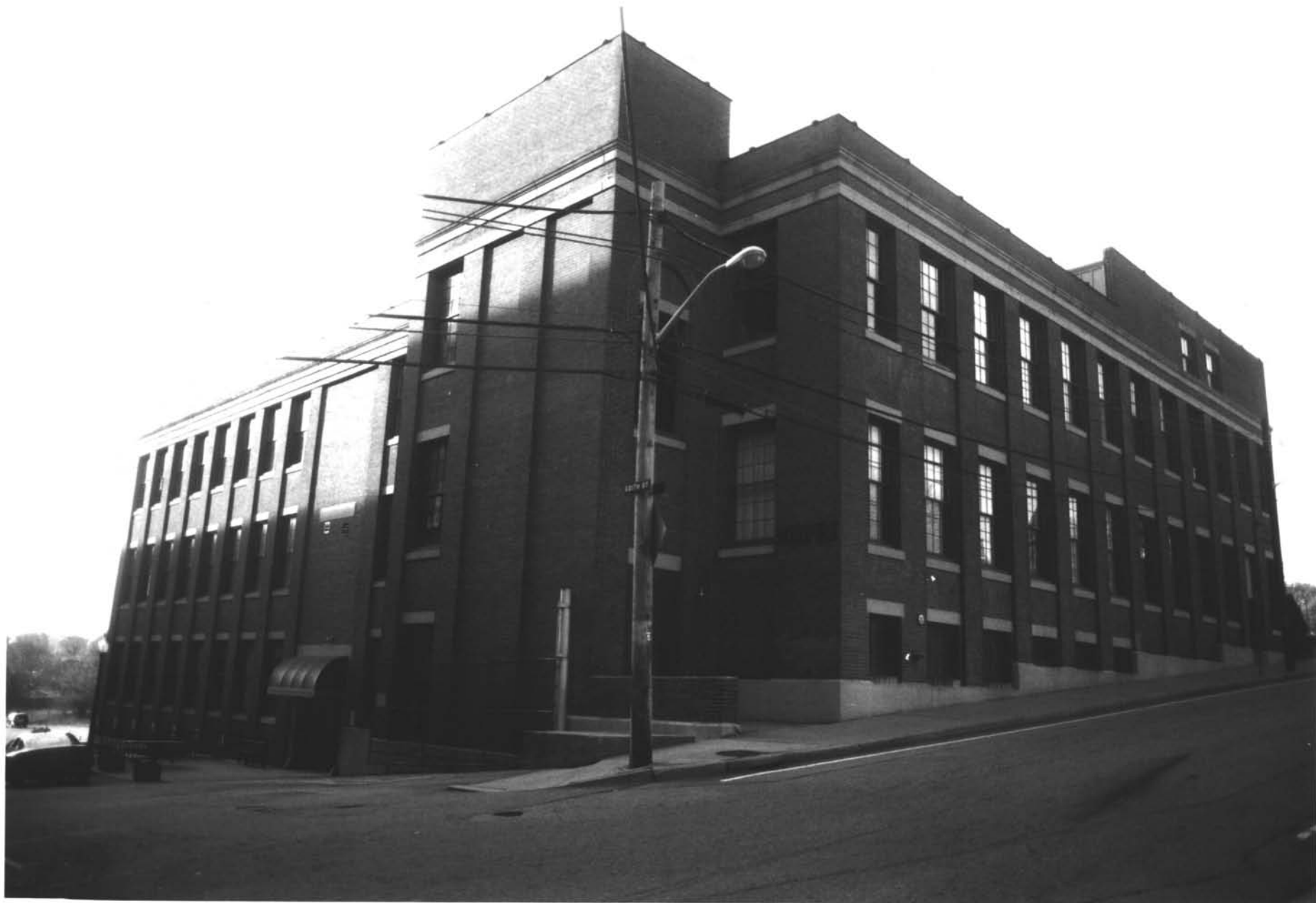
Brown + Sharpe mfg. Co. Complex Providence County, Providence, R.I. Photo # 11 of 16