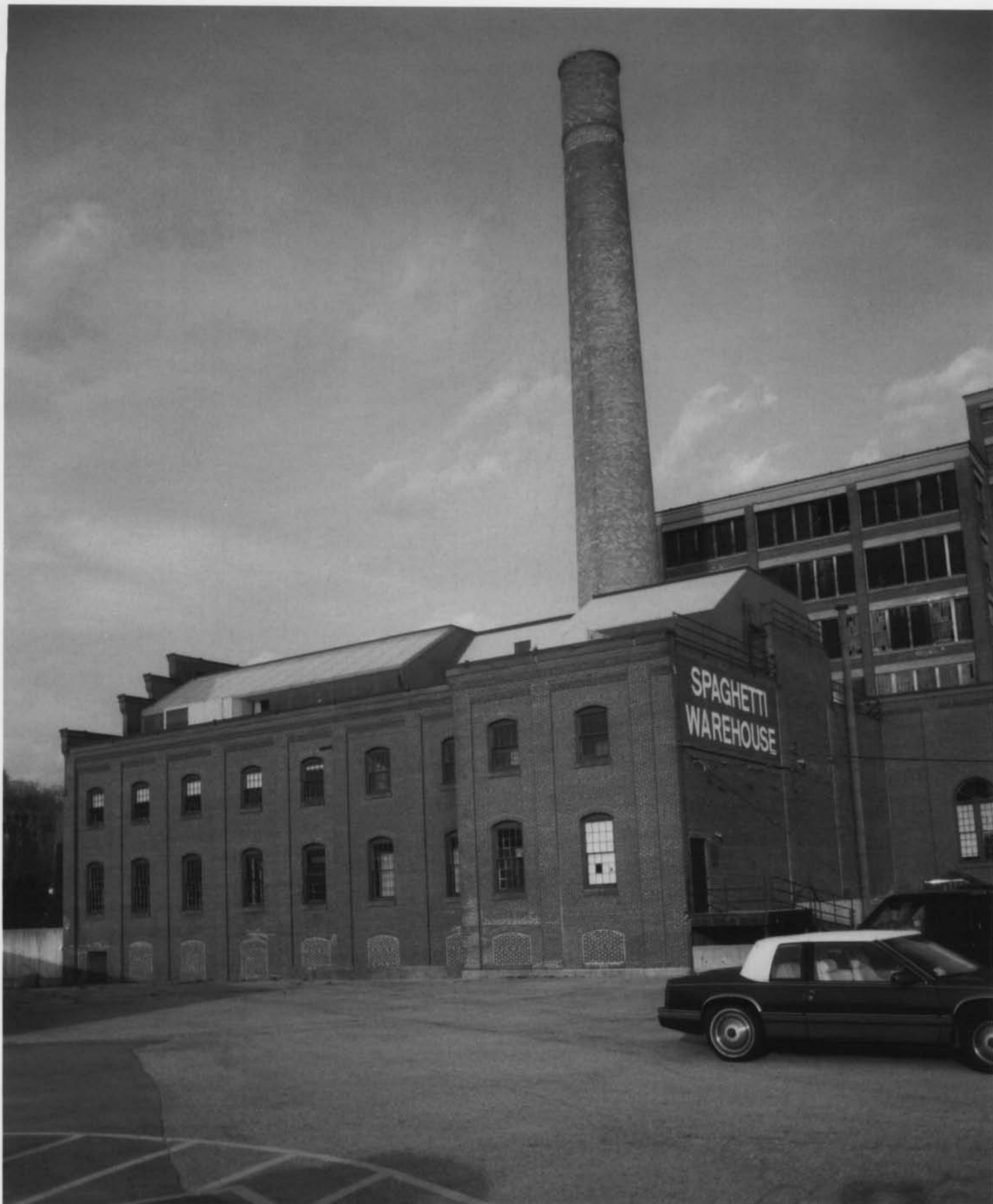
Brown & Sharpe Mfg. Co. Complex, Providence County, Providence, R.I. Photo # 15 of 16