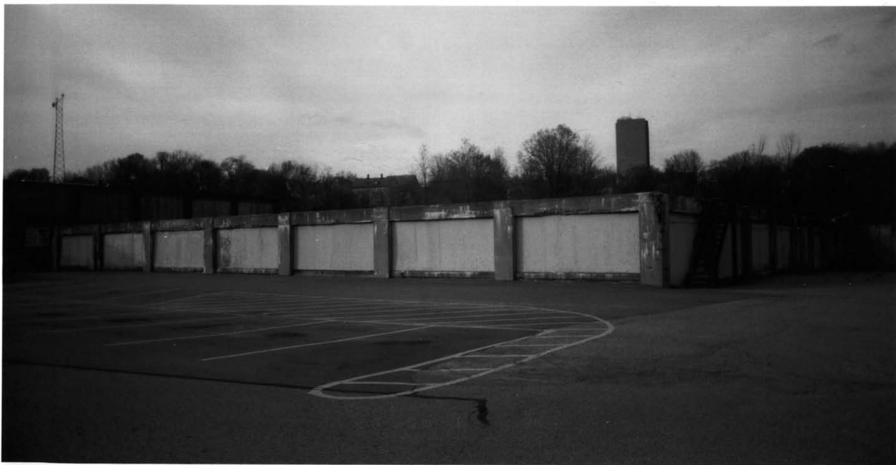
Brown + Sharpe mfg. Co. Complex Providence County, Providence, RI Photo # 8 of 16