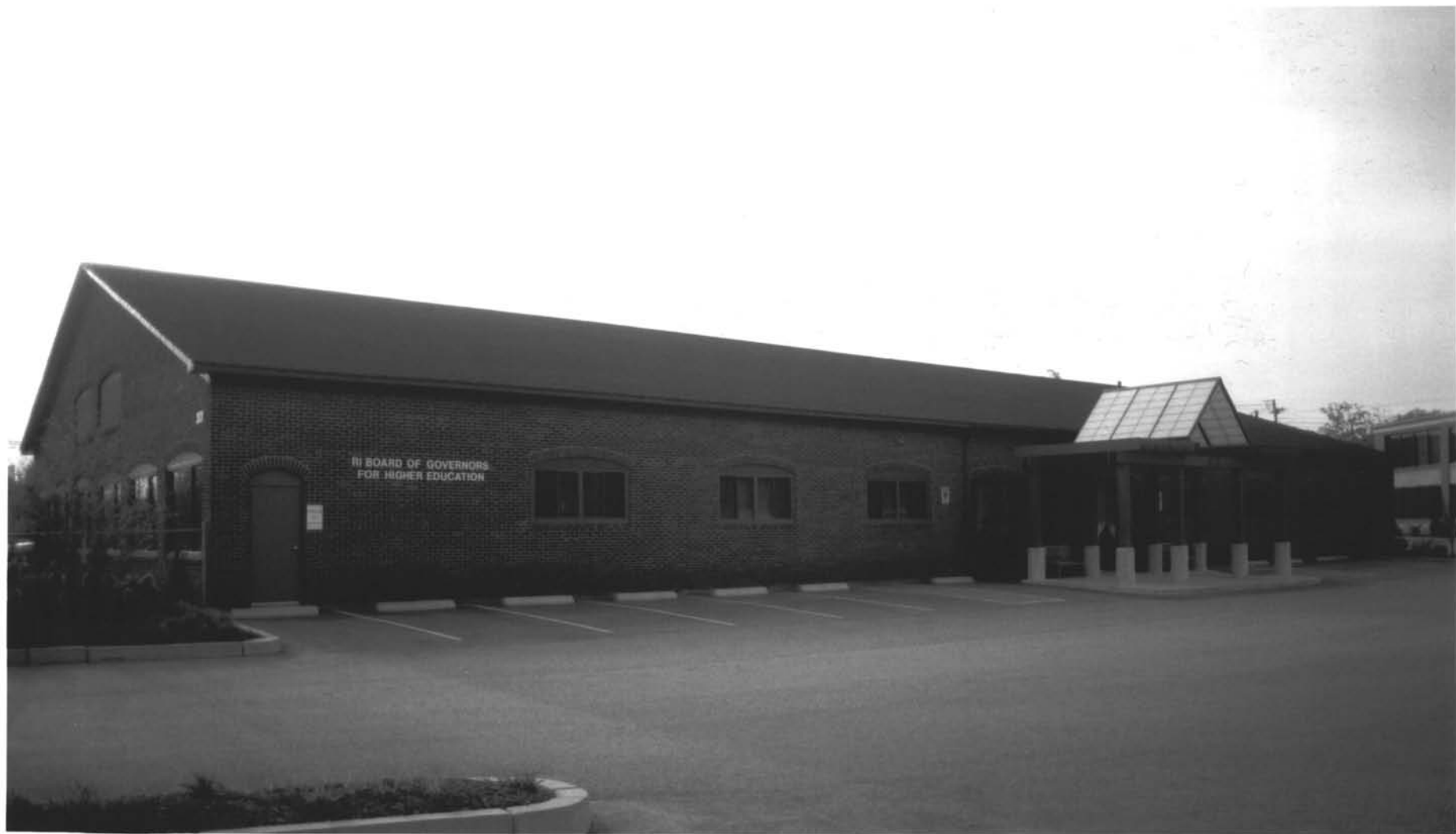
Brown + Shapc Mtg. Co. Complex Providence County, Providence, RI Photo # 16 of 16