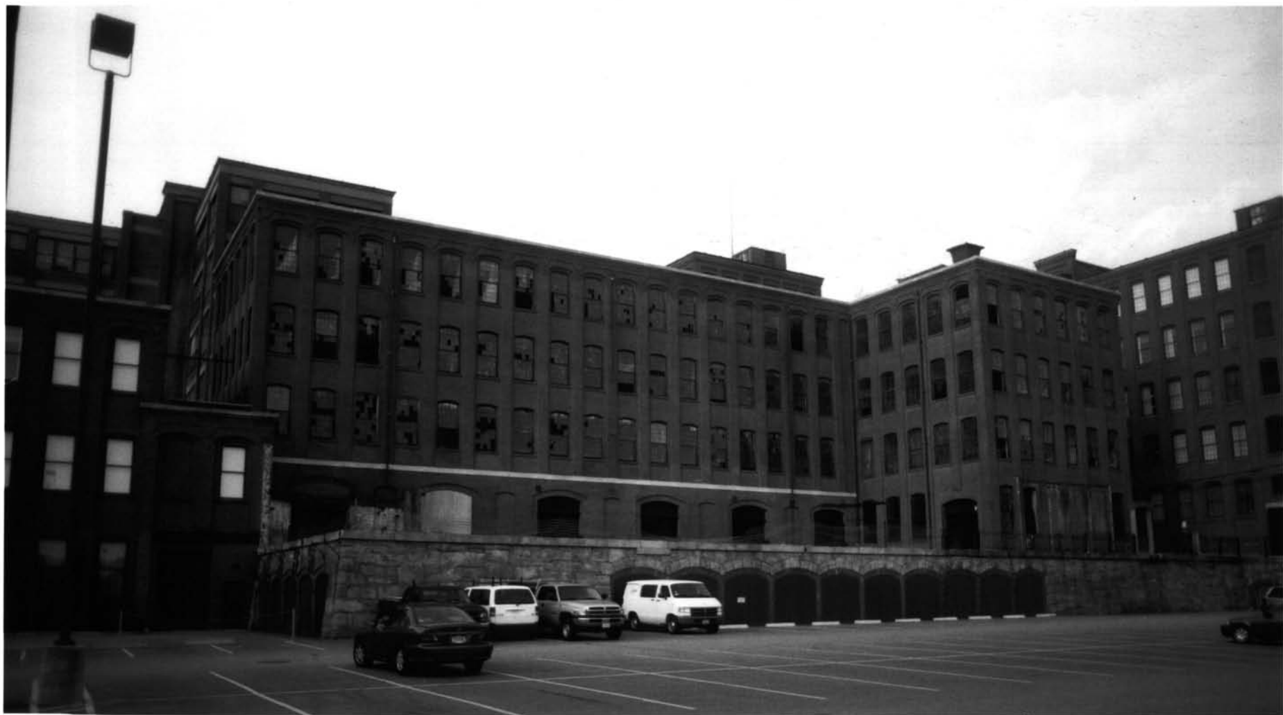
Brown + Sharp Mfg. Company Complex Providence County, Providence, R.I. Photo # 4 of 16