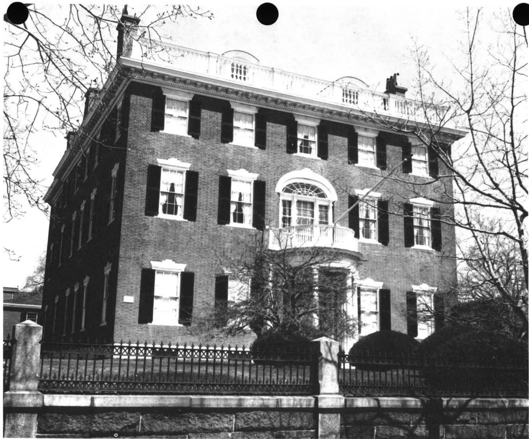
Thomas P. Ives House, Providence, Rhode Island