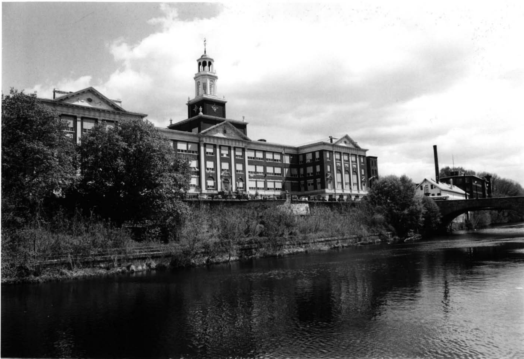
William E. Tolman High School Exchange Street Historic District Pawtucket, Providence County, Rhode Island Photograph No. 6