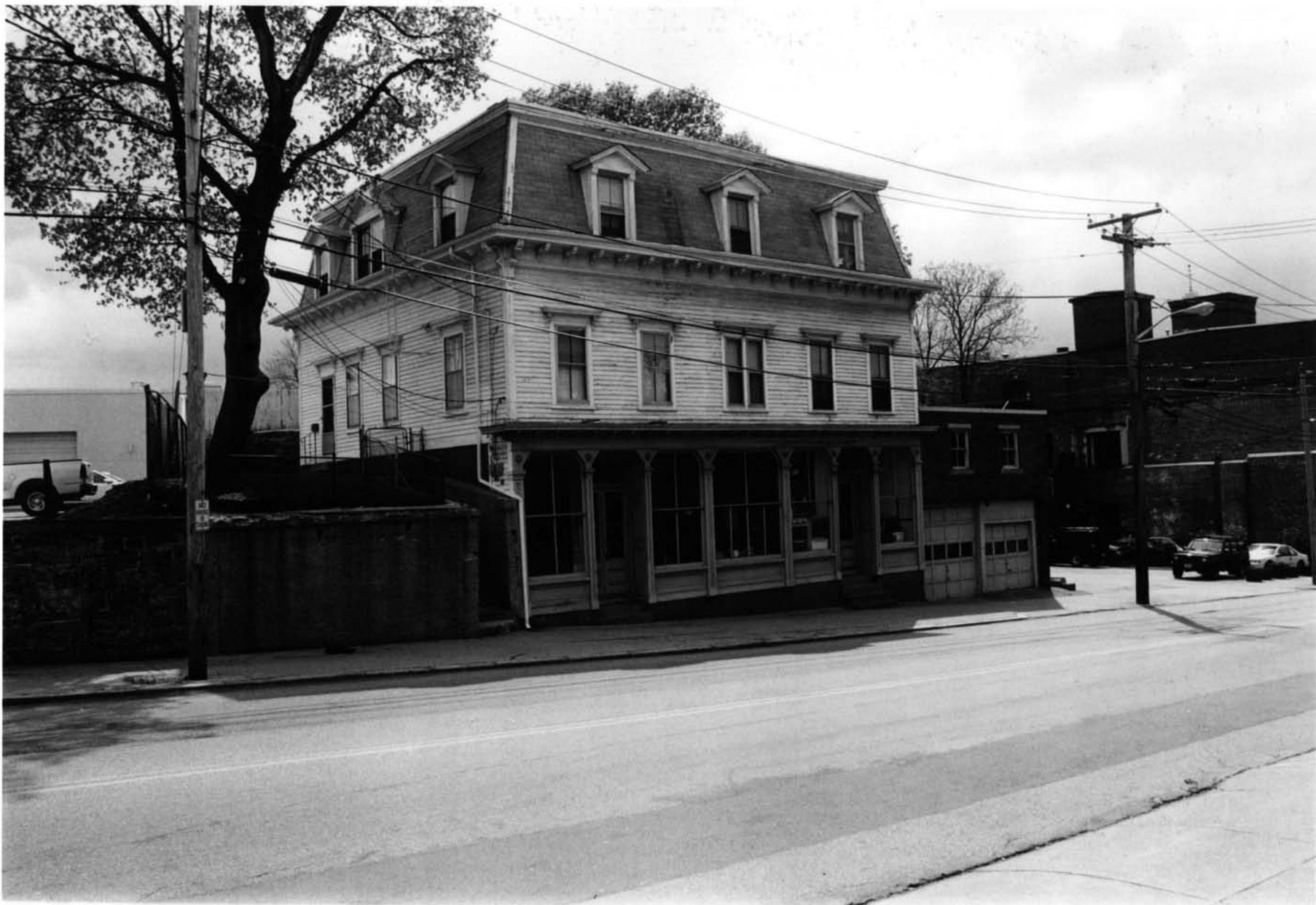
Nickerson-Charland Building Exchange Street Historic District Pawtucket, Providence County, Rhode Island Photograph No. 9