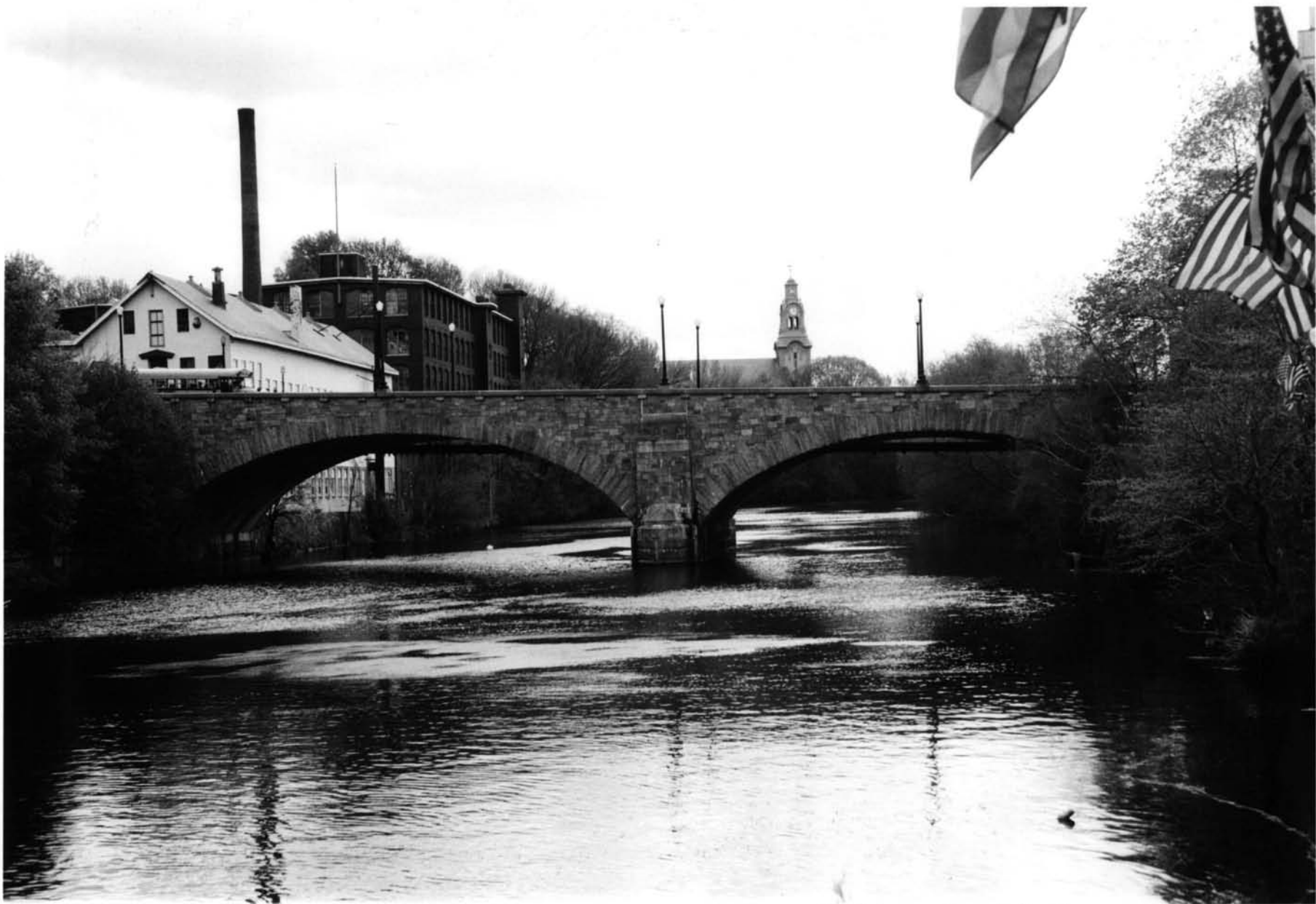
Exchange Street Bridge, Exchange Street Historic District Pawtucket, Providence County, Rhode Island Photograph No. 5