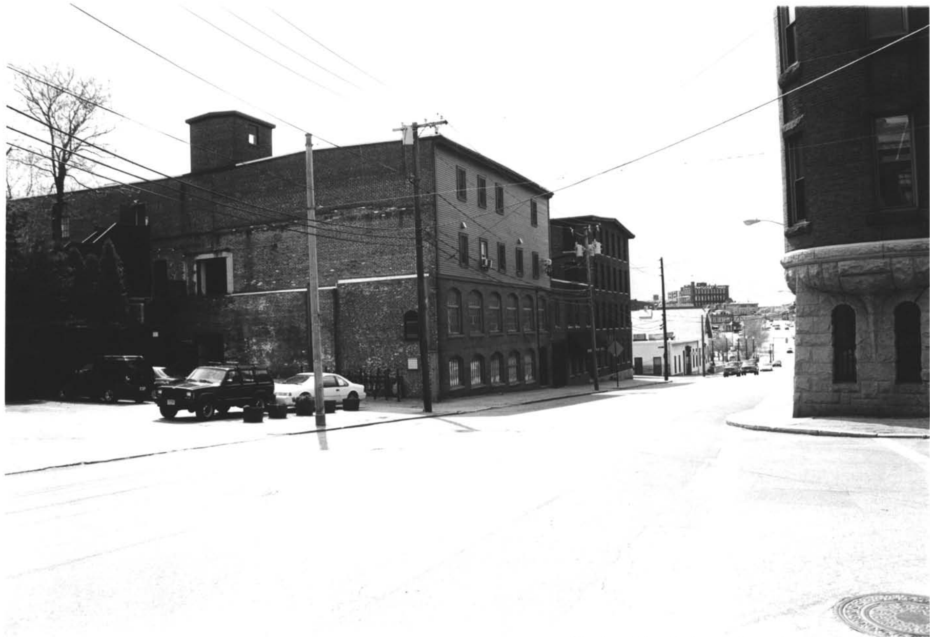
Rhode Island Card Board Company Exchange Street Historic District Pawtucket, Providence County, Rhode Island Photograph No. 10