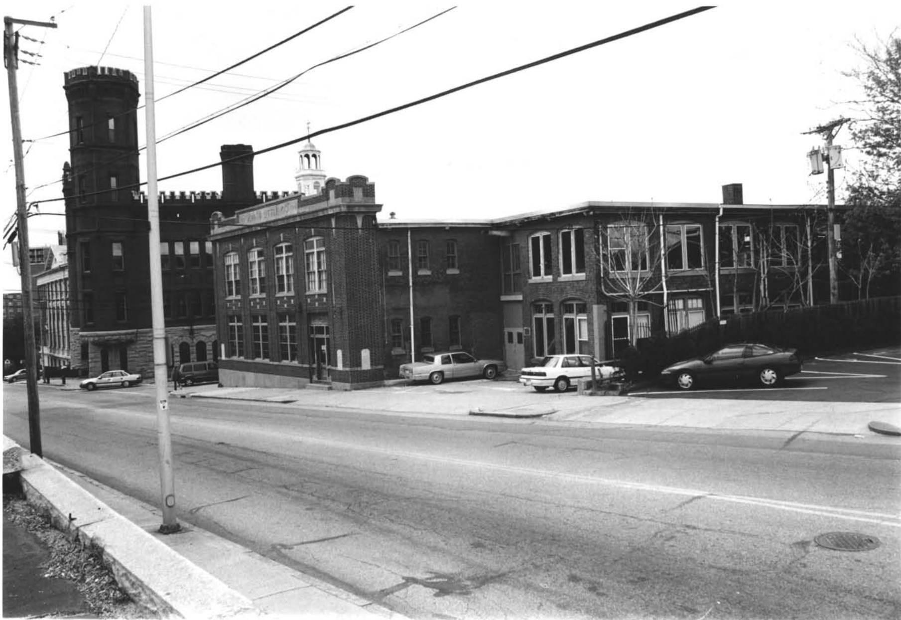
John W. Little Company Exchange Street Historic District Pawtucket, Providence County, Rhode Island Photograph No. 8