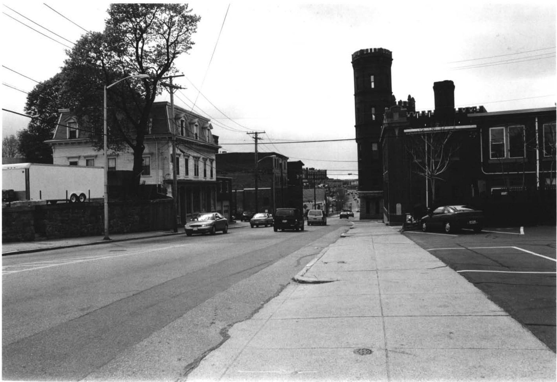
General view looking west Exchange Street Historic District Pawtucket, Providence County, Rhode Island Photograph No. 2