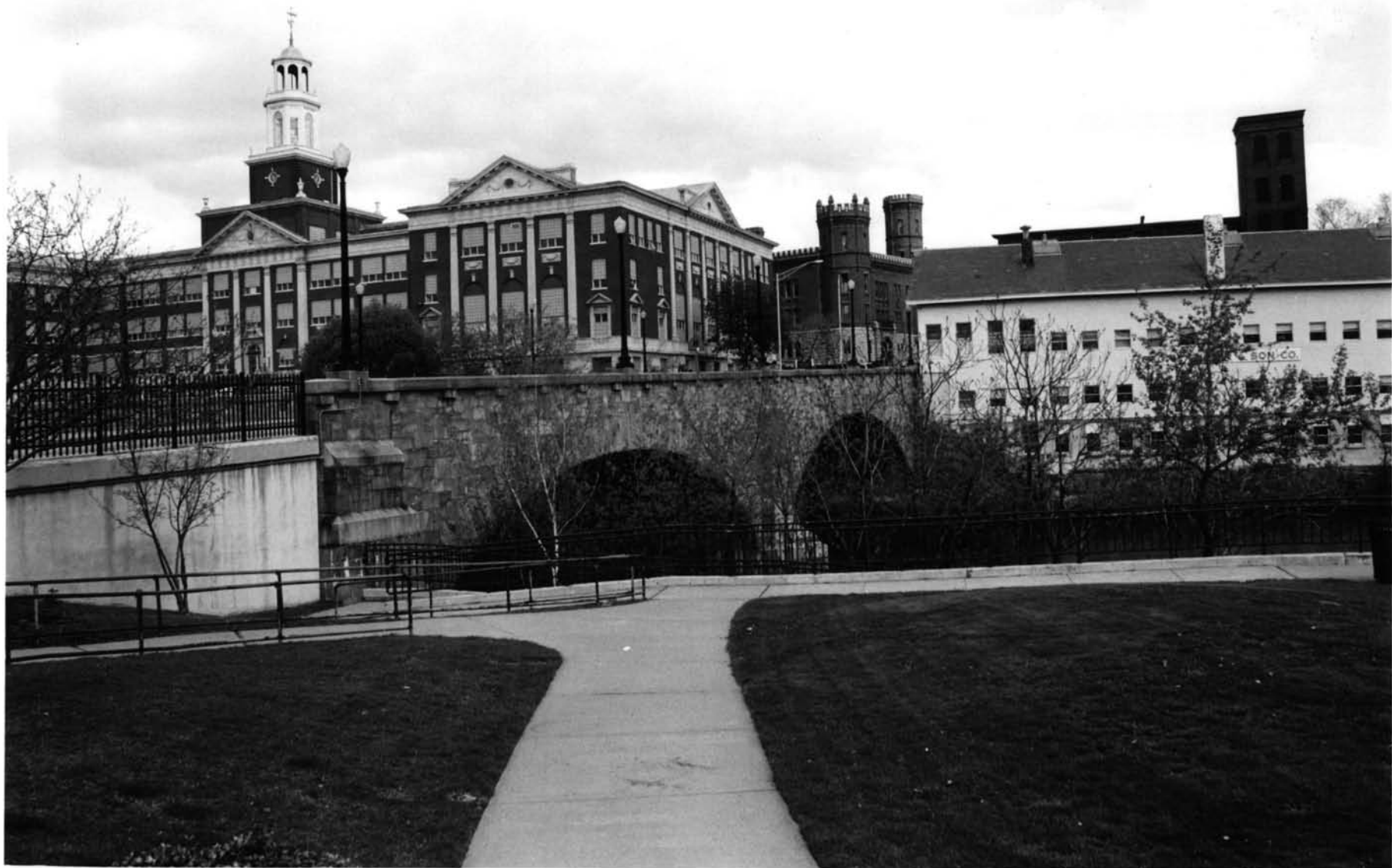
General view looking northeast Exchange Street Historic District Pawtucket, Providence County, Rhode Island Photograph No. 1