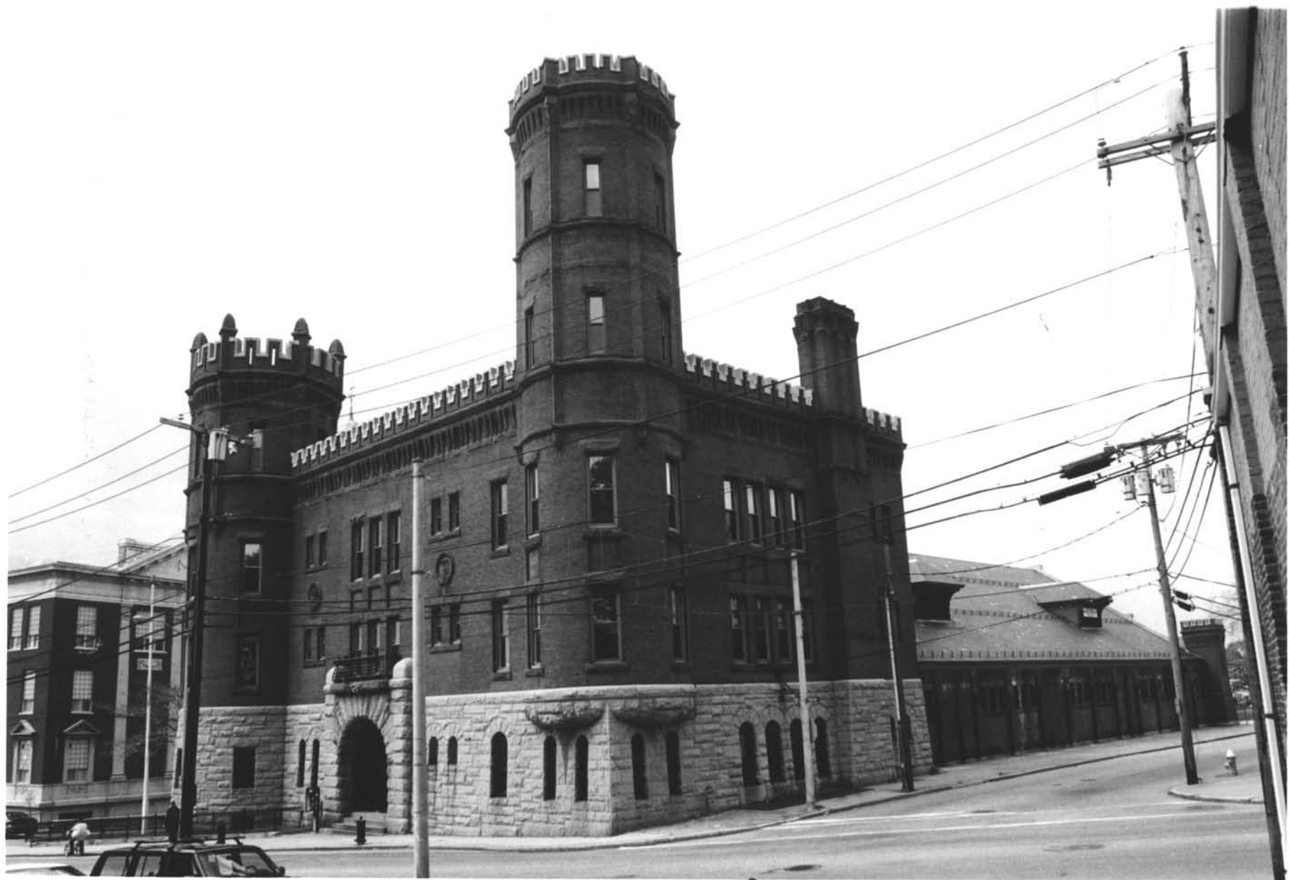
Pawtucket Armory Exchange Street Historic District Pawtucket, Providence County, Rhode Island Photograph No. 7