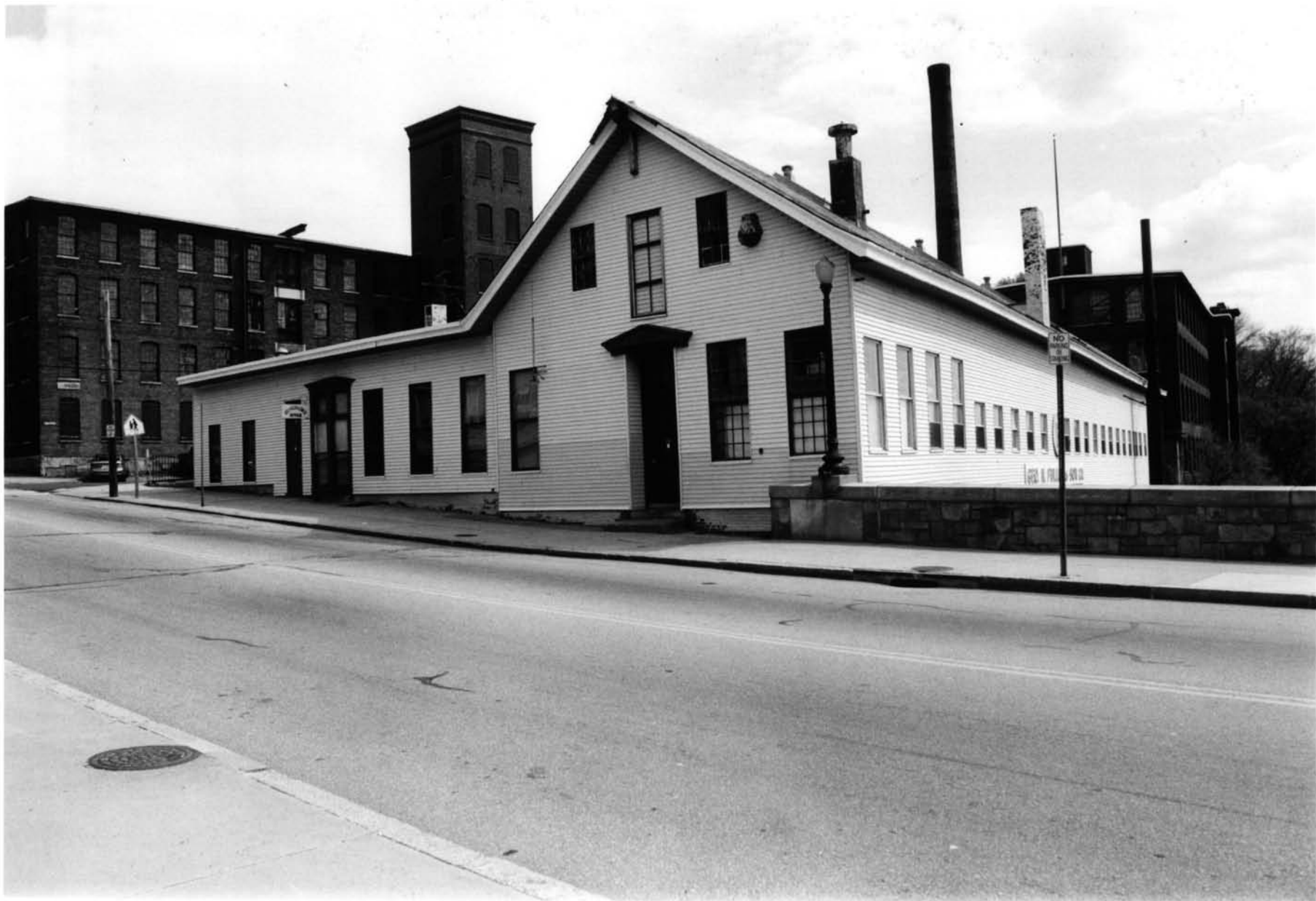
George H. Fuller & Son Company Exchange Street Historic District Pawtucket, Providence County, Rhode Island Photograph No. 4