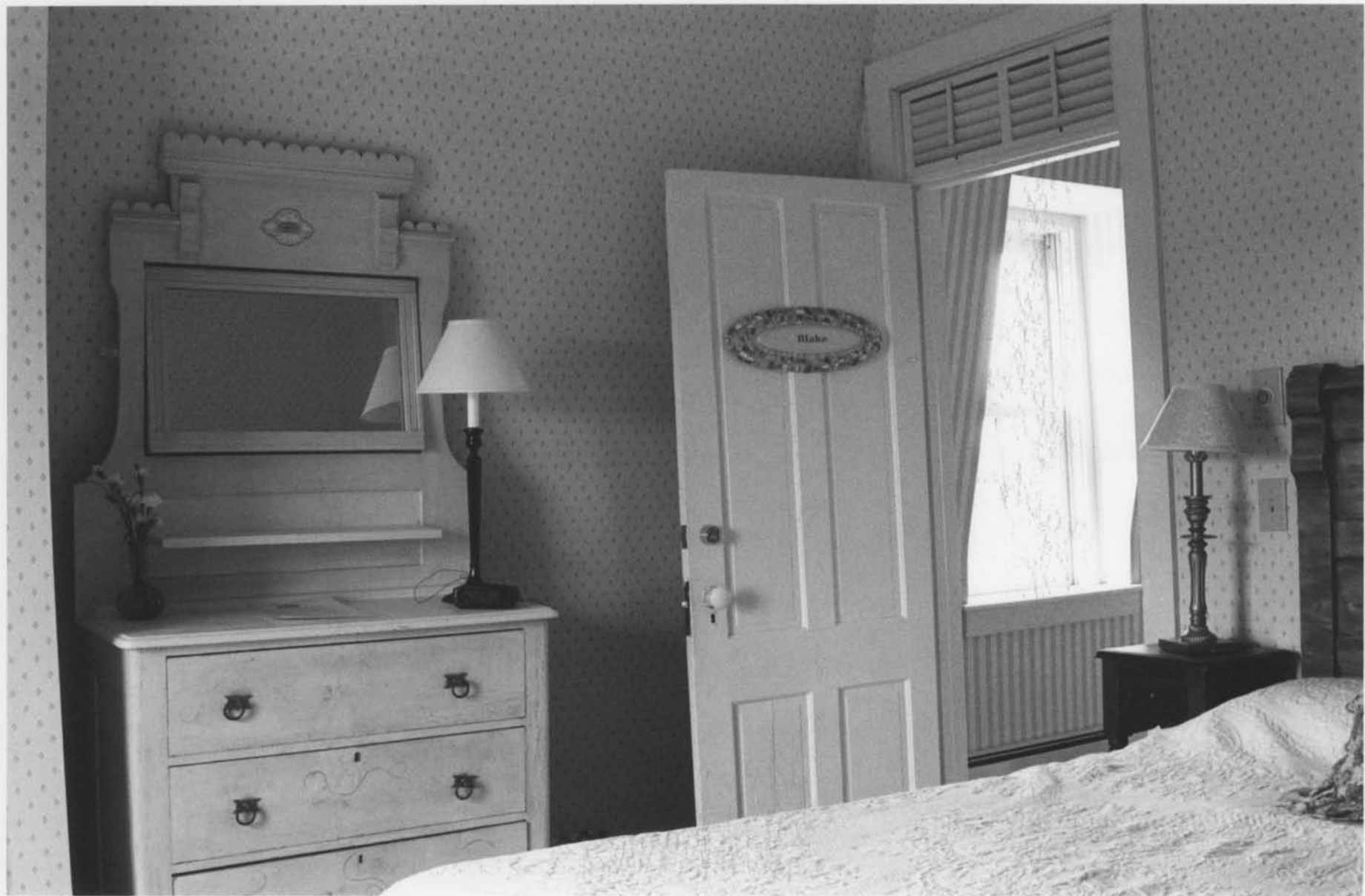
Hygeia House Washington County, New Shoreham, VT Photo # 5 of 5