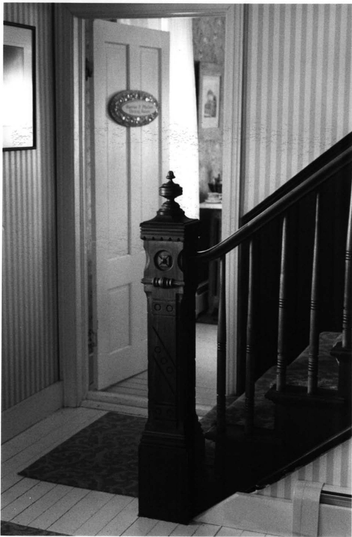
Hygeia House Washington County, New Shoreham, RI Photo # 3 of 5