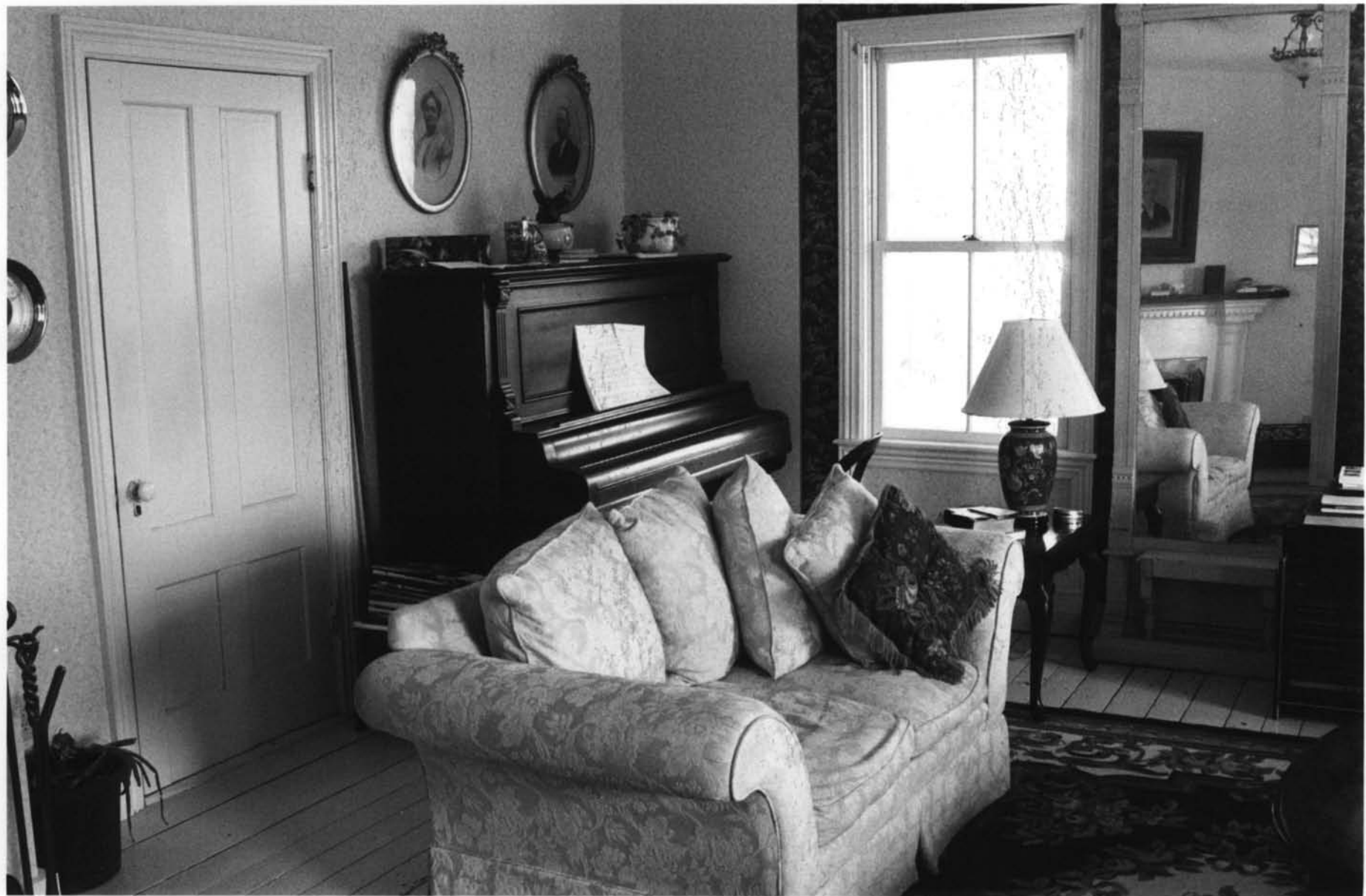
Hygeia House Washington County, New Shoreham, R.I. Photo #4 of 5