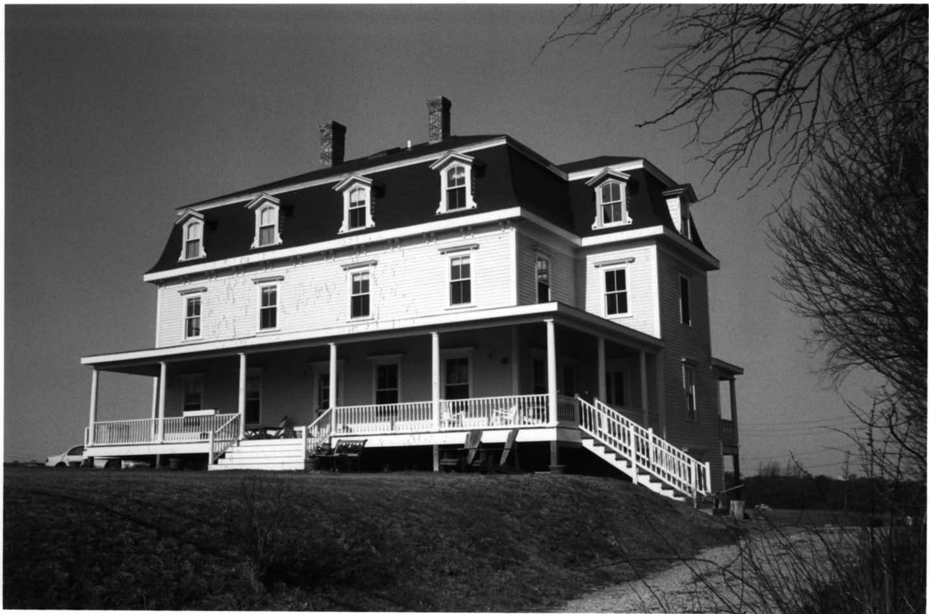
Hygeia House Washington County, New Shoreham, VT Photo #1 of 5